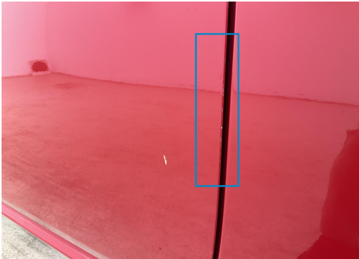
1. Door / Front Left Paint / Scratch / Scuff -