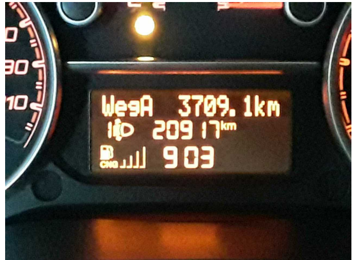
Figure 14: Documents