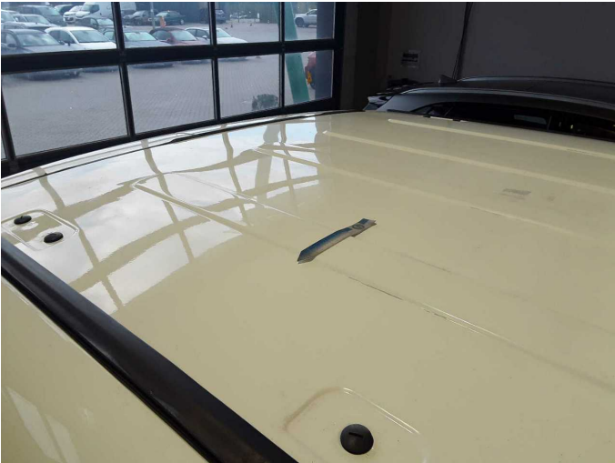
Damage 1: Roof: Roof - dent(s) - Smart repair