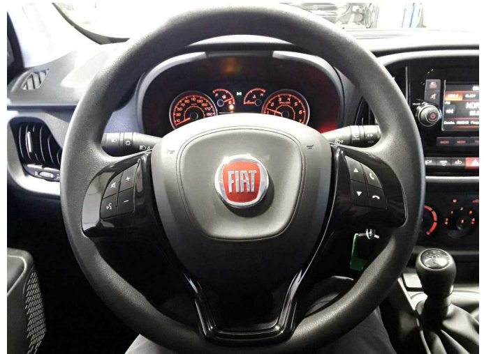
Figure 16: Misc.