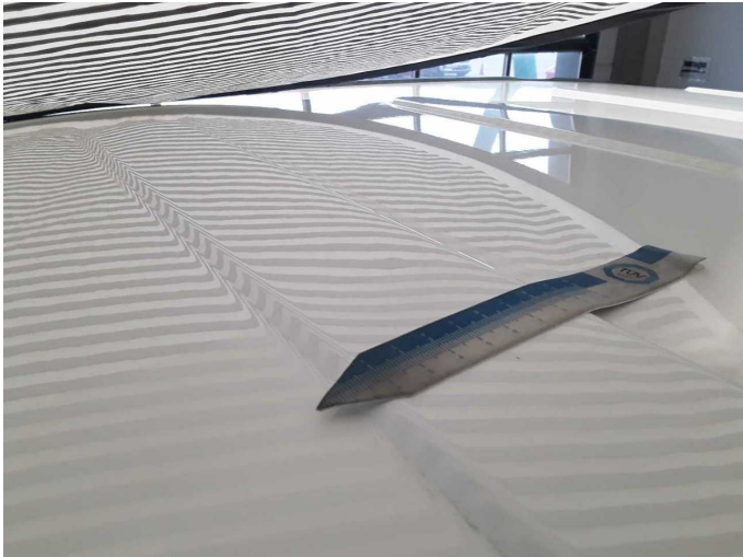
Damage 1: Roof: Roof - dent(s) - Smart repair