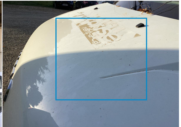
2. Hood Bodywork / Dent / Hail Area -