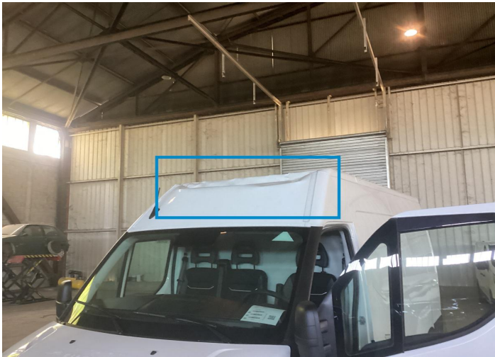
1. Roof Bodywork / Dent / Deformation -