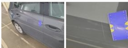
Wing RR, Dent(s) and scratch(es), Acceptable