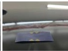
Bodywork, No damage, Check