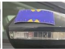
Roof, Chemical polution, Polish