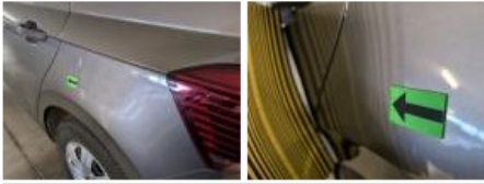
Door RR, Dent(s), Paintless dent repair