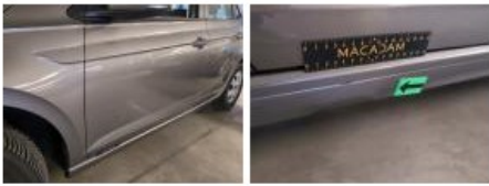
Wing RL, Dent(s), Acceptable