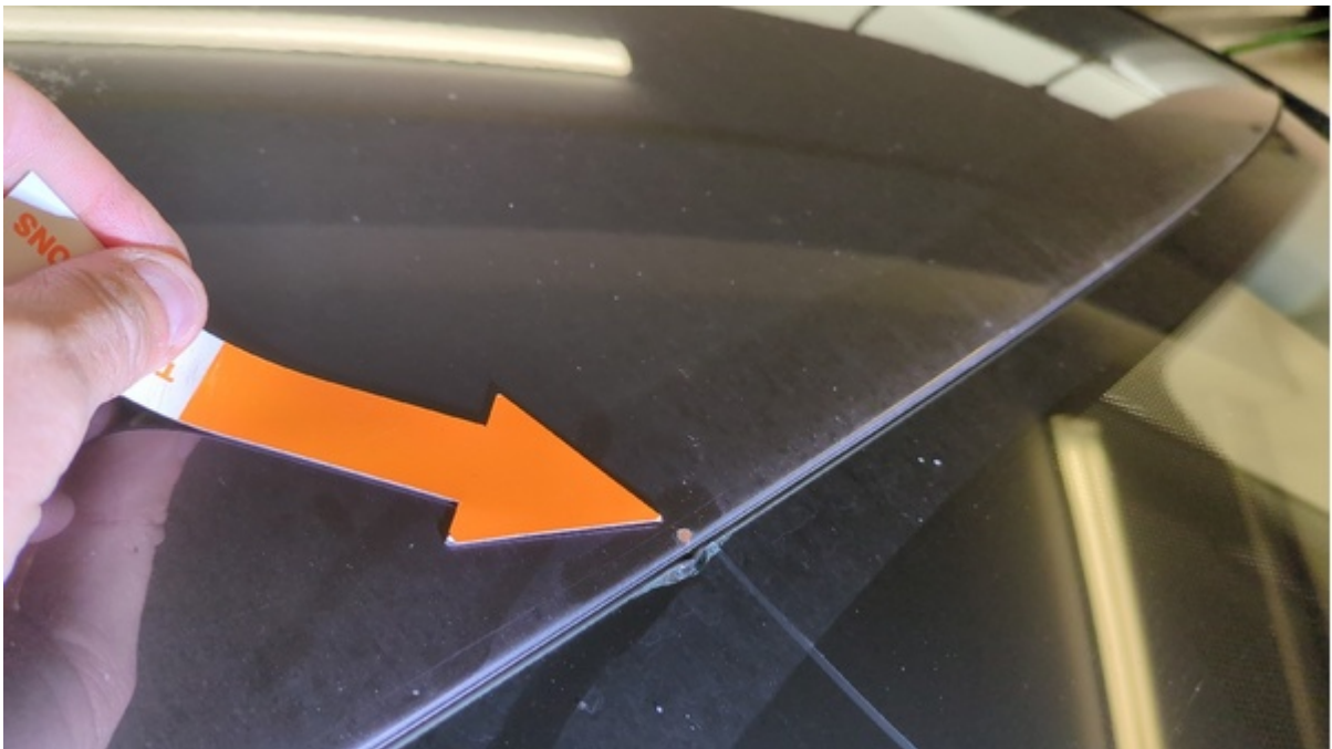
Tak Tak Smart repair Lackskada 1 000 kr