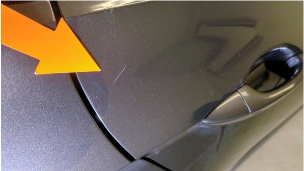
Dörr Höger bak Repa/Repor 2 000 kr