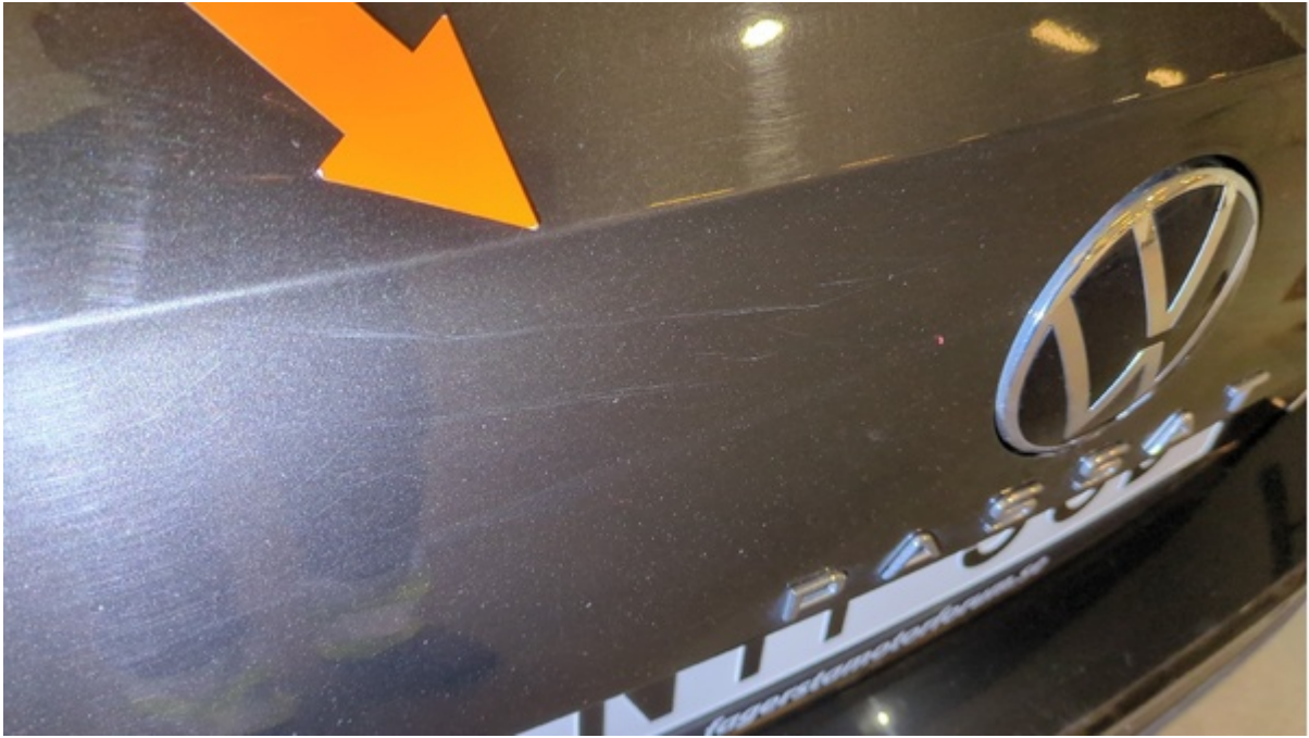
Bagagelucka Bagagelucka Repa/Repor 2 000 kr