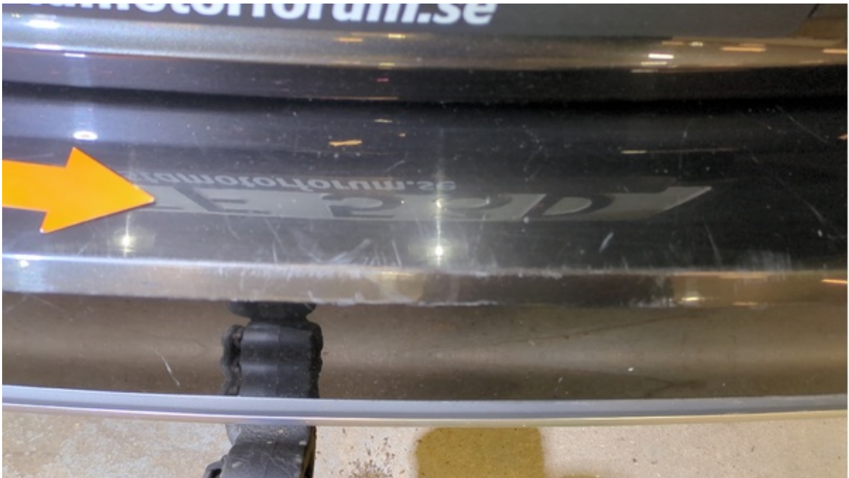
Stötfångare Bak Repa/Repor 3 500 kr