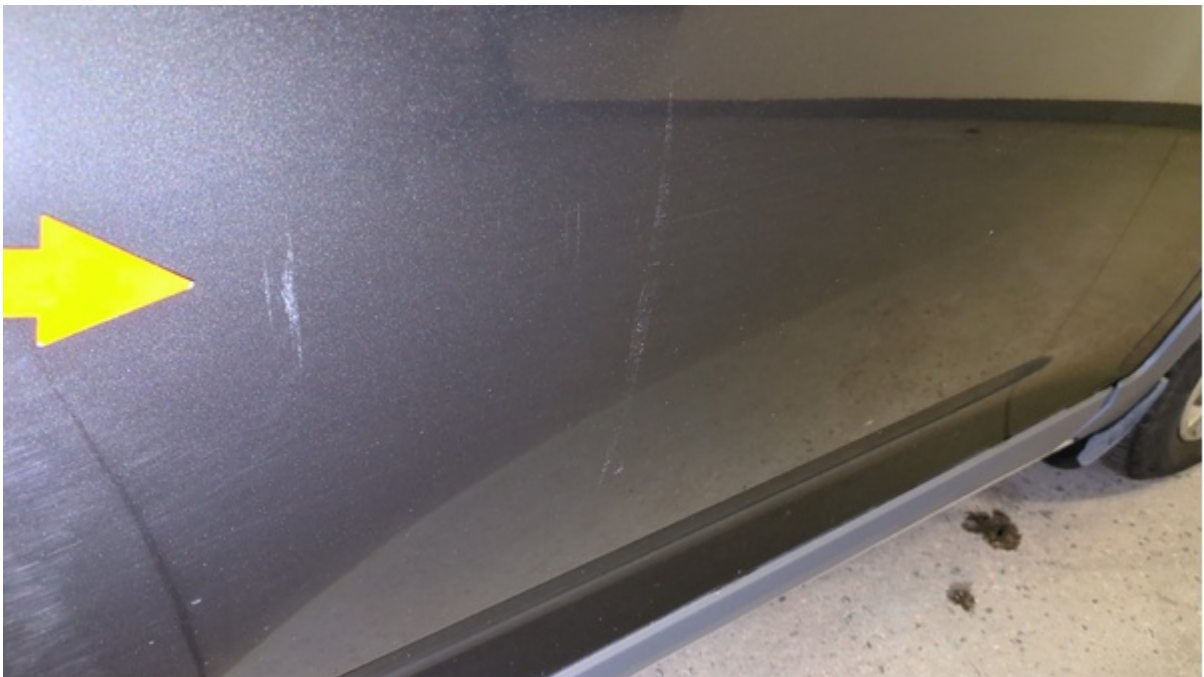
Dörr Höger fram Repa/Repor 2 000 kr