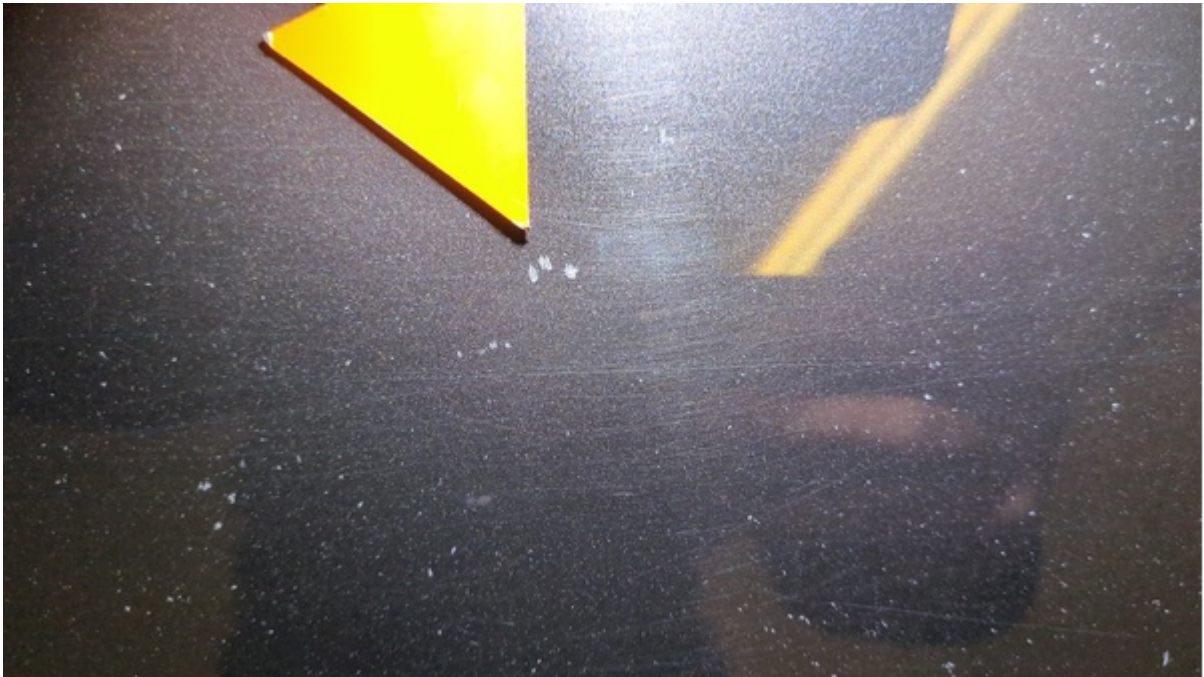
Motorhuv Motorhuv Liten buckla/Repor 4 000 kr