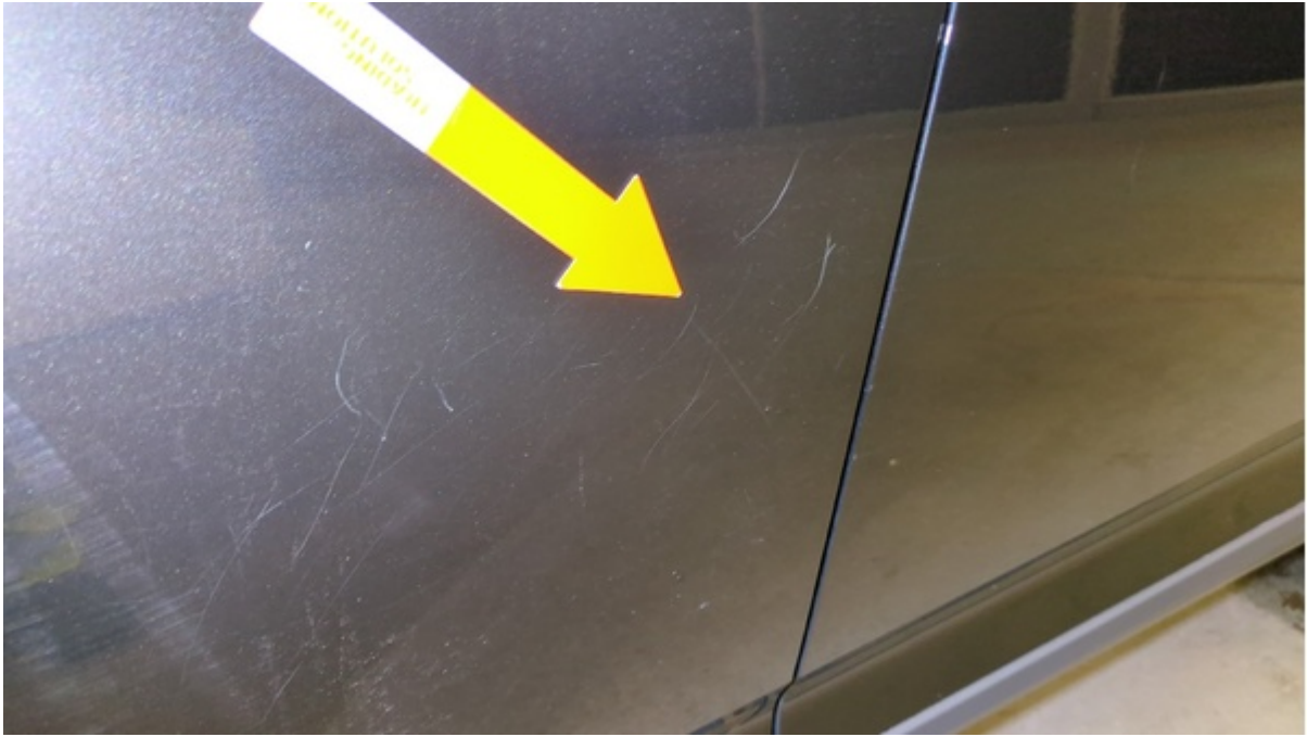
Dörr Vänster fram Repa/Repor 2 000 kr