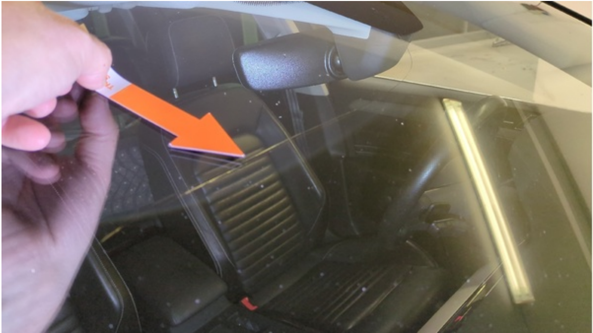
Glas Vindruta Stenskott/Spricka Det finns ingen skadeanmälan 7 000 kr