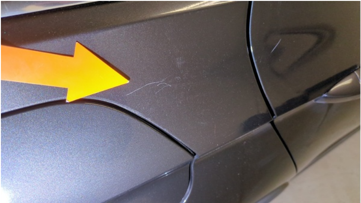
Skärm Höger bak Repa/Repor 3 500 kr