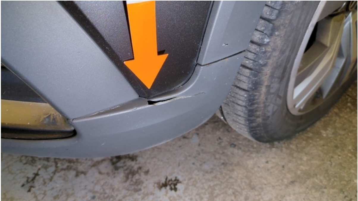
Stötfångare Fram Liten buckla/Repor 4 500 kr