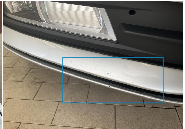
8. Bumper / Front Paint / Stone Chip -