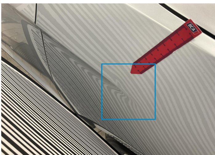
5. Fender / Front Right Bodywork / Dent / Dent -