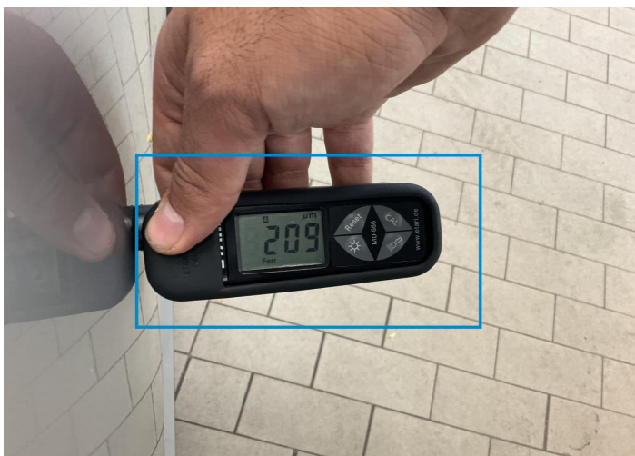
1. Door / Back Left Paint / Poor Previous Repair -