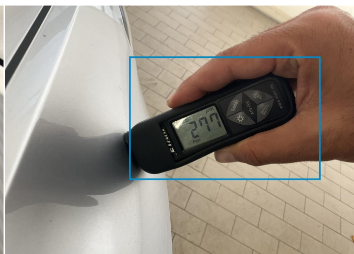
6. Fender / Front Right Paint / Poor Previous Repair -