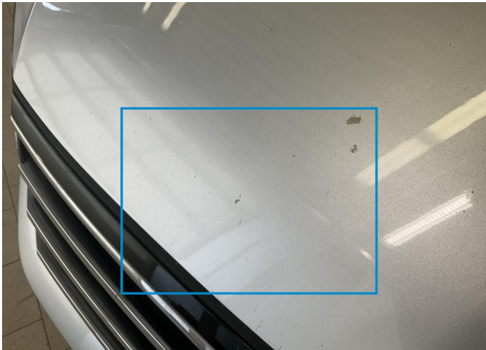
9. Hood Paint / Stone Chip -