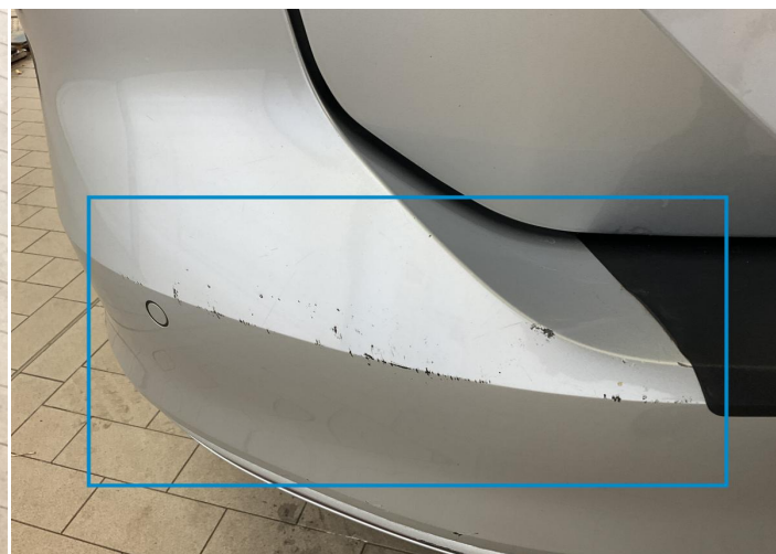
2. Bumper / Back Paint / Scratch / Scuff -