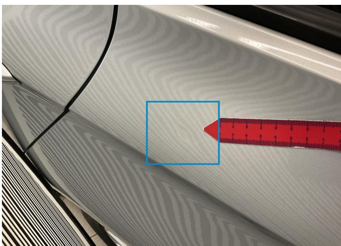
3. Fender / Back Left Bodywork / Dent / Dent -