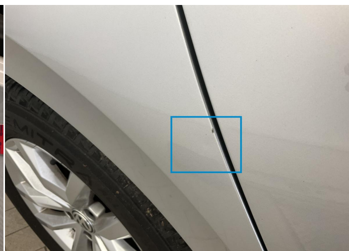
4. Fender / Back Right Paint / Scratch / Scuff -