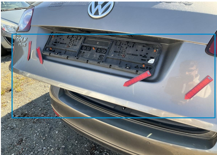
3. Tailgate Paint / Scratch / Scuff -