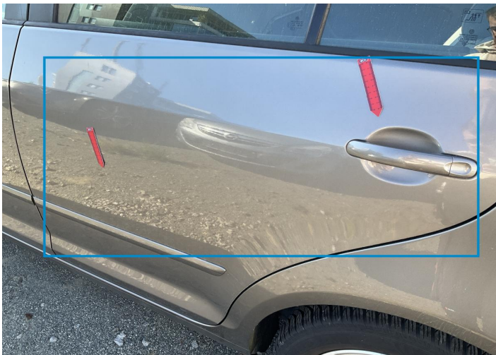
2. Door / Back Left Paint / Scratch / Scuff -