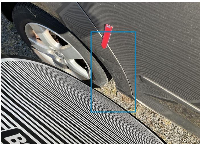
5. Side Panel / Back Right Bodywork / Dent / Dent -