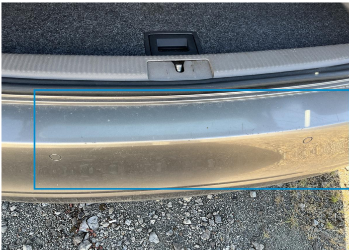
4. Bumper / Back Paint / Scratch / Scuff -