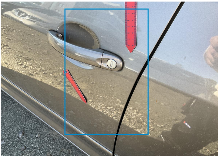
1. Door / Front Left Paint / Scratch / Scuff -