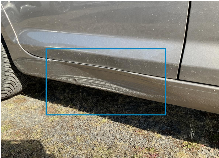
7. Rocker Panel / Center Right Bodywork / Dent / Dent -