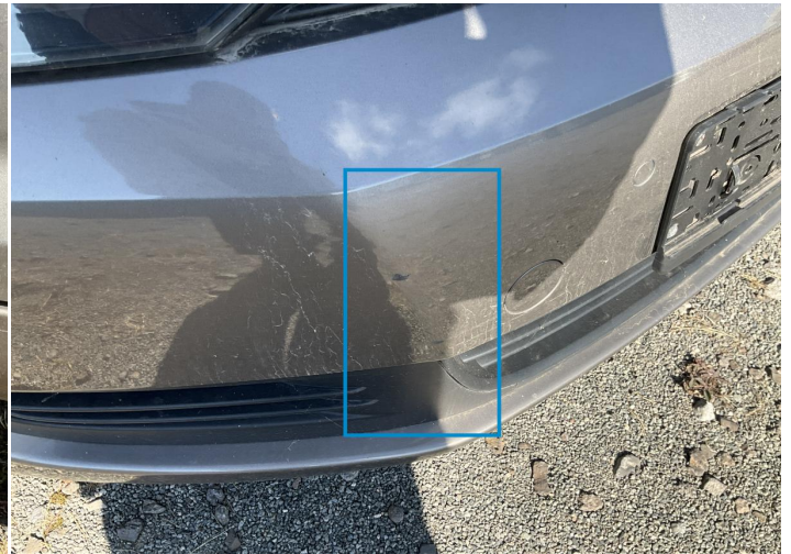
8. Bumper / Front Paint / Scratch / Scuff -