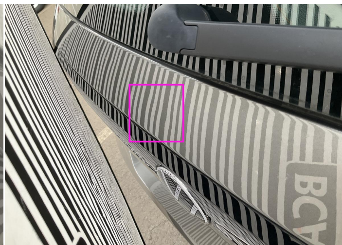
2. Tailgate Bodywork / Dent / Dent -