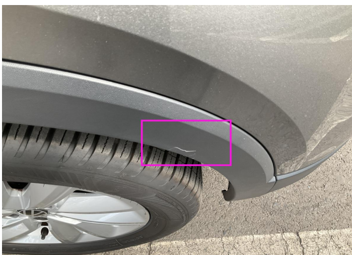
3. Fender / Front Right Paint / Scratch / Scuff -