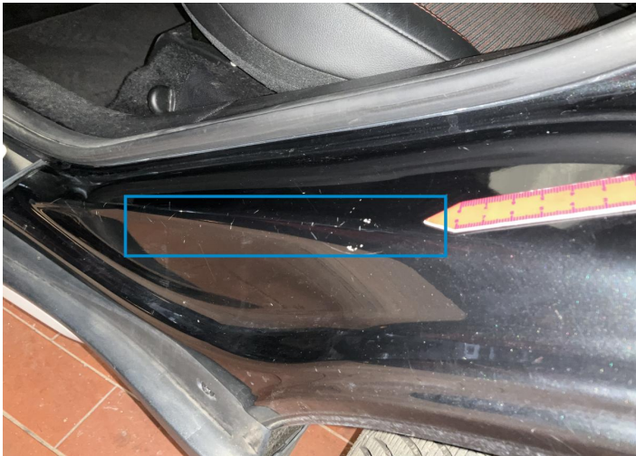
4. Door Edge / Back Left Paint / Scratch / Line -