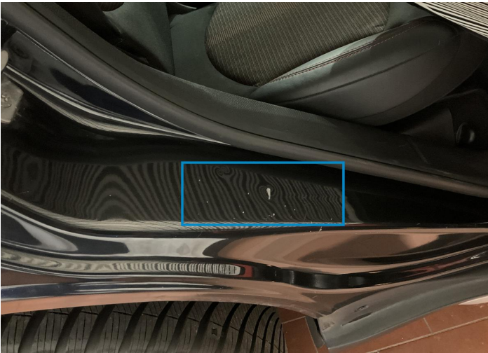
7. Door Edge / Back Right Bodywork / Dent / Dent -