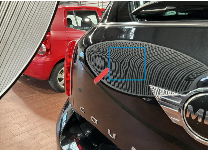
9. Tailgate Bodywork / Dent / Dent -