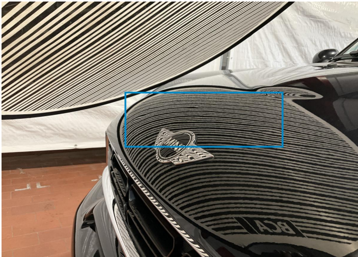
3. Hood Bodywork / Dent / Dent -