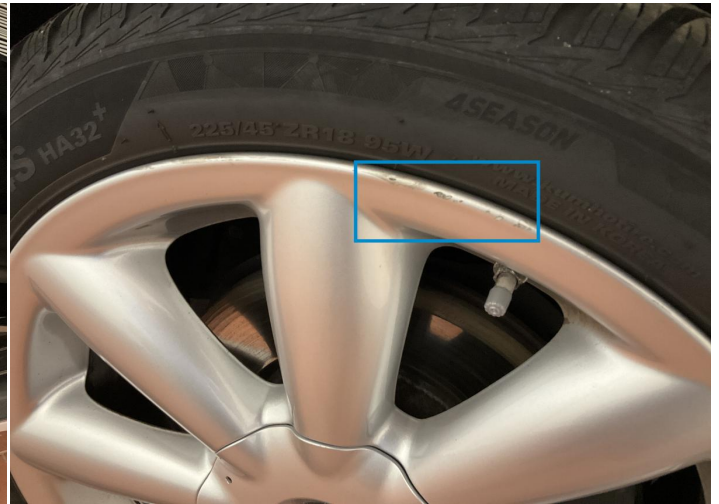
8. Paint / Scratch / Scuff -