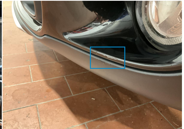
10. Corner Bumper / Front Left Paint / Stone Chip -