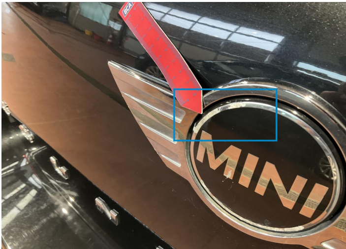
5. Monogram/Emblem / Back Center Paint / Scratch / Scuff -