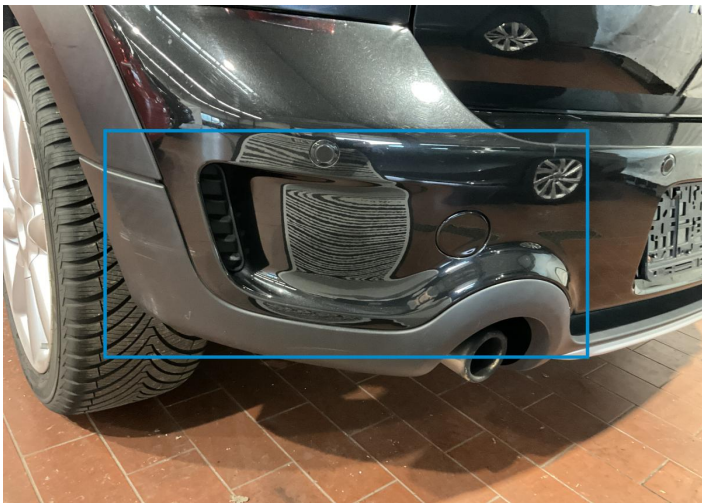
2. Corner Bumper / Back Left Paint / Scratch / Scuff -