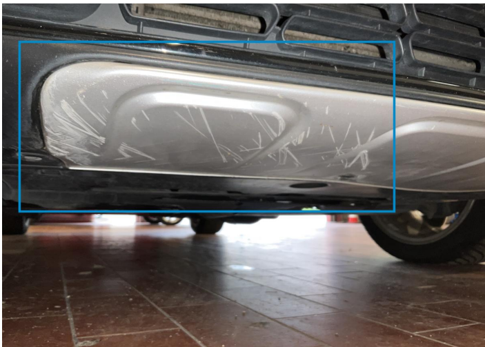
1. Blade/spoiler / Front Paint / Scratch / Scuff -