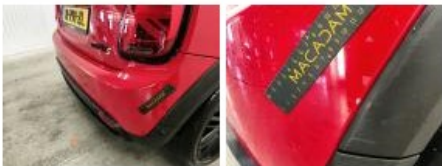
Bodywork, Paint measurement, Acceptable