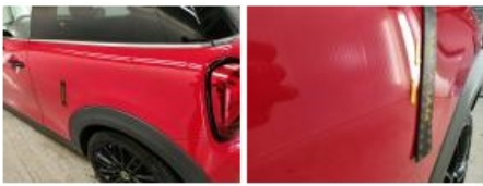
Door FL, Scratch(es), Repair and paint (complete)