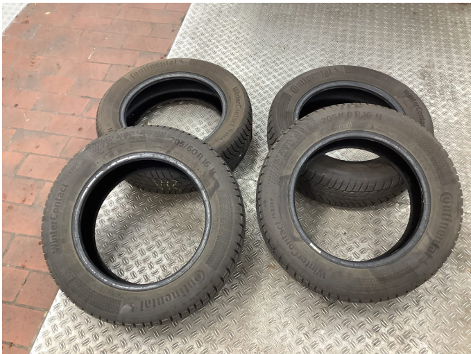
Figure 14: Additional tyres