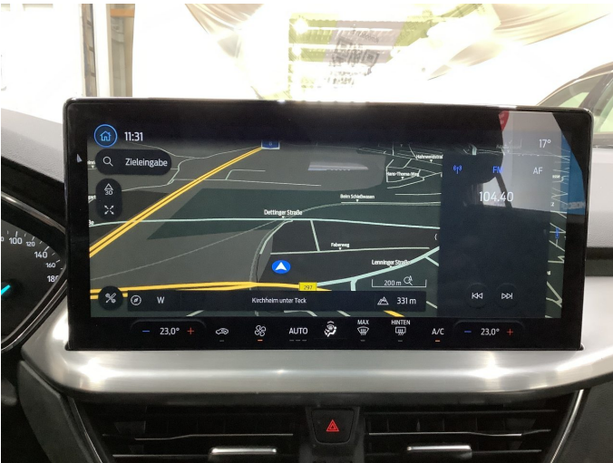
Figure 15: Navigation