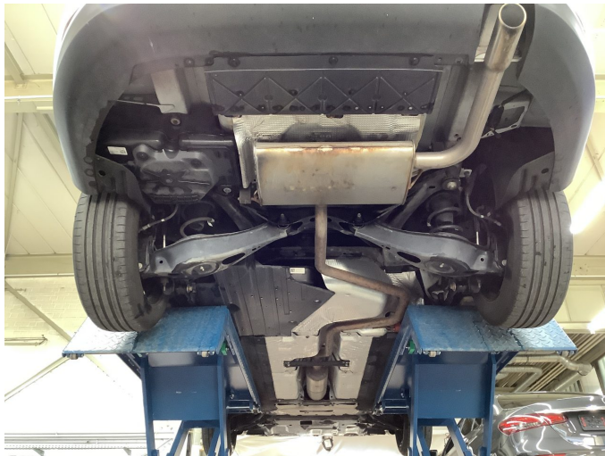
Figure 31: Misc.