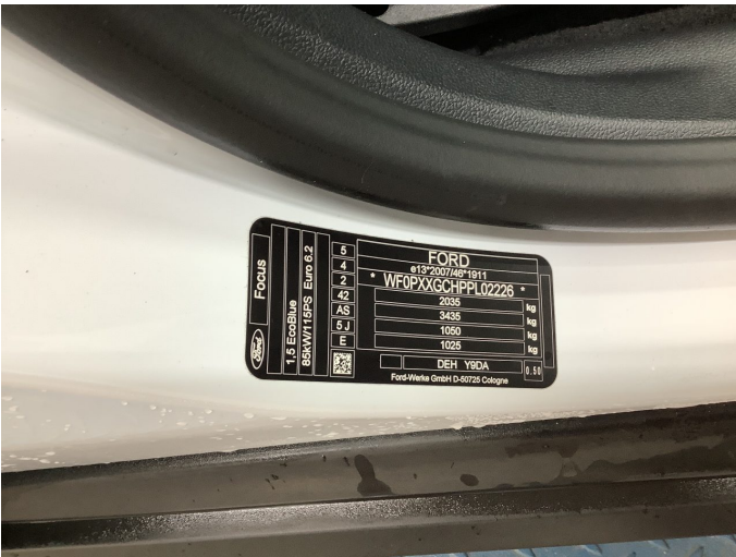
Figure 11: VIN