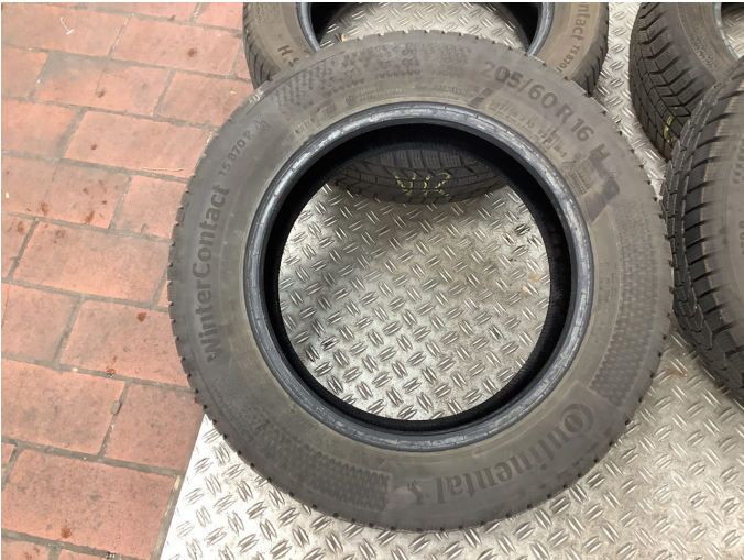
Figure 27: Misc.