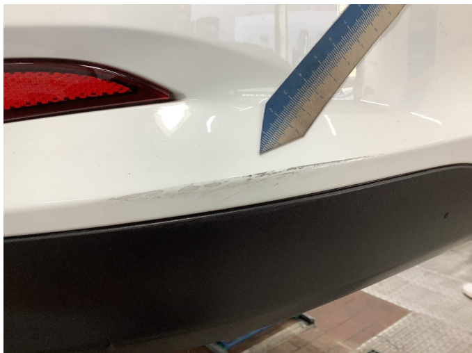
Damage 4: Rear bumper: Rear bumper - Scratched - Paint