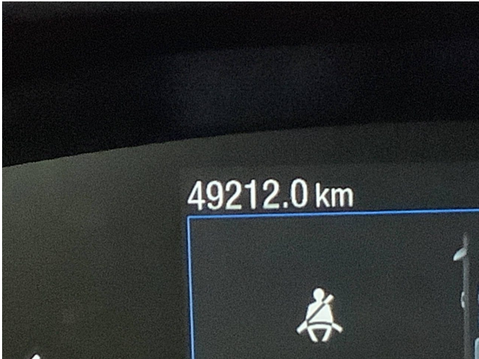
Figure 20: Misc.