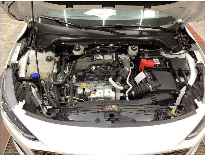
Figure 25: Misc.