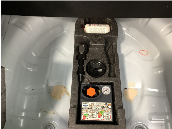
Figure 28: Misc.