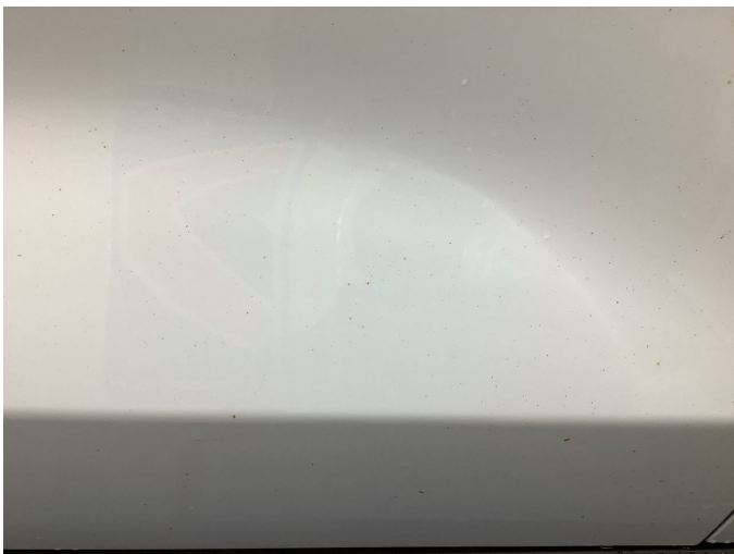
Damage 3: Body: Body (Flugrost) - Soiled - Clean