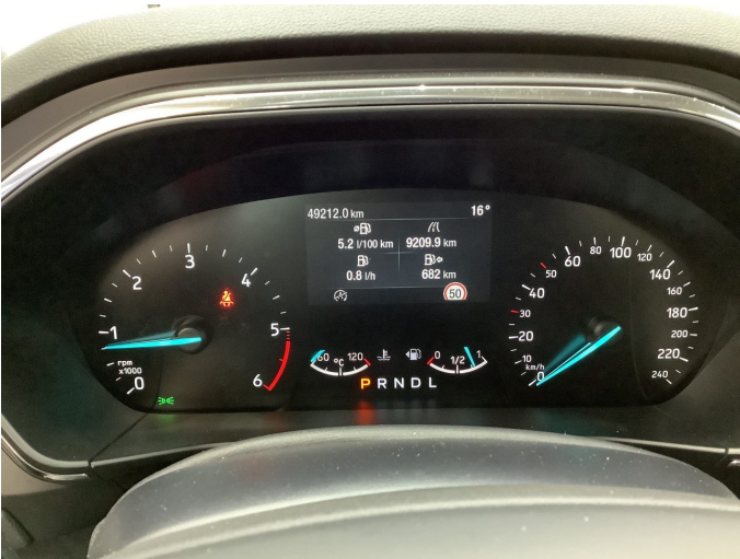
Figure 7: Instrument cluster