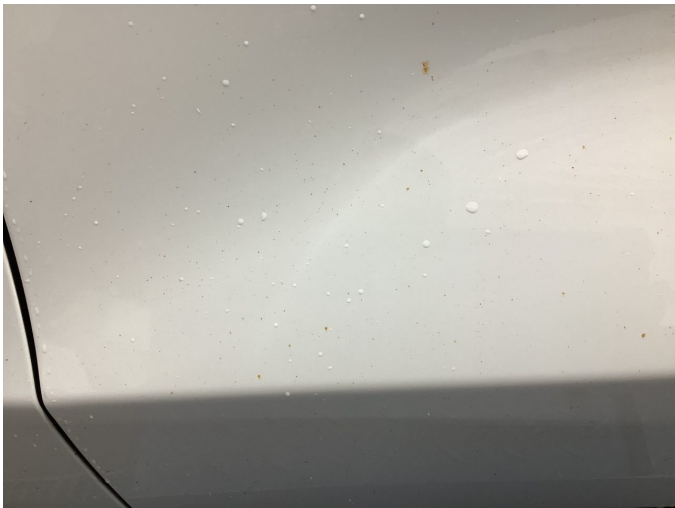
Damage 3: Body: Body (Flugrost) - Soiled - Clean