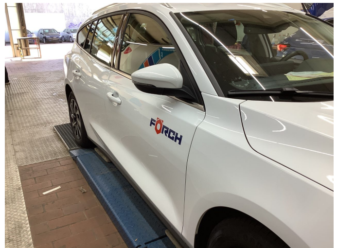
Damage 1: Body: Body - Glued / labelled - De-glue / neutralise