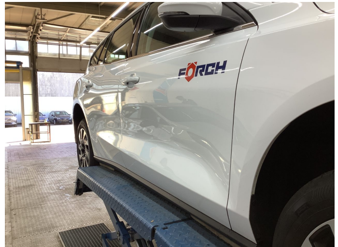
Damage 3: Body: Body (Flugrost) - Soiled - Clean