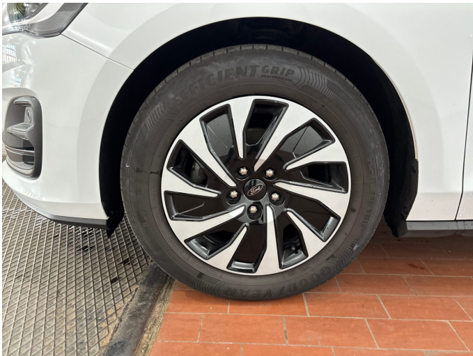
Figure 12: Mounted tyres