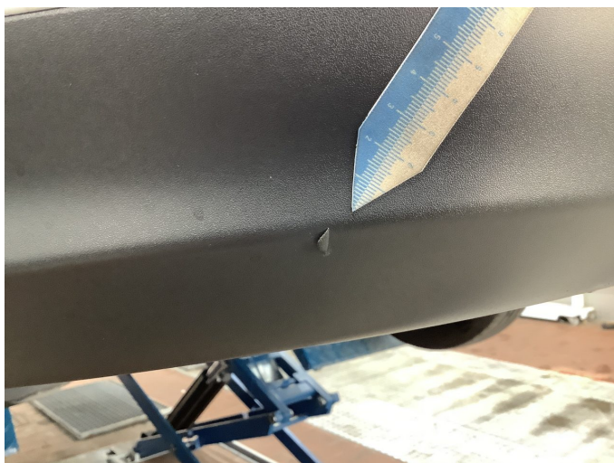
Wear and tear 1: Rear bumper: Spoiler - Scratch(es) - No deduction