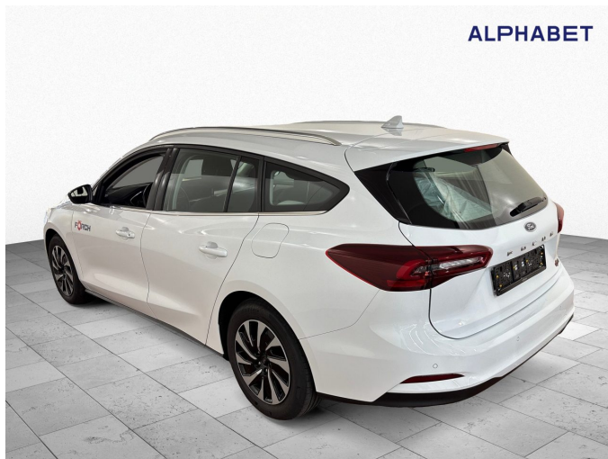
Figure 3: Diagonal rear (left)