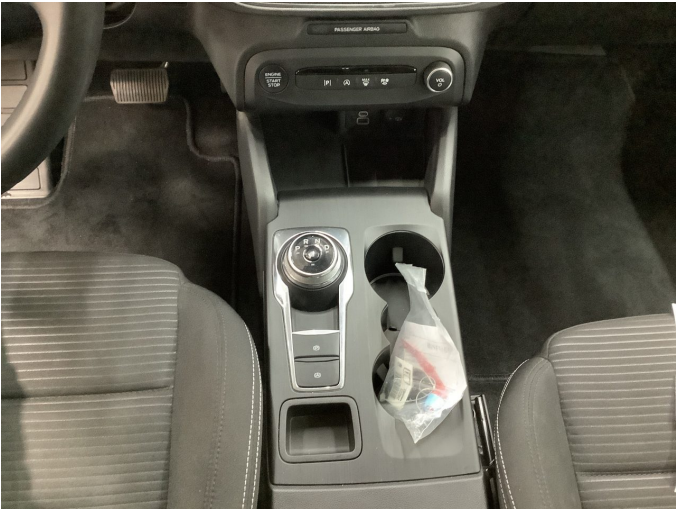
Figure 19: Misc.