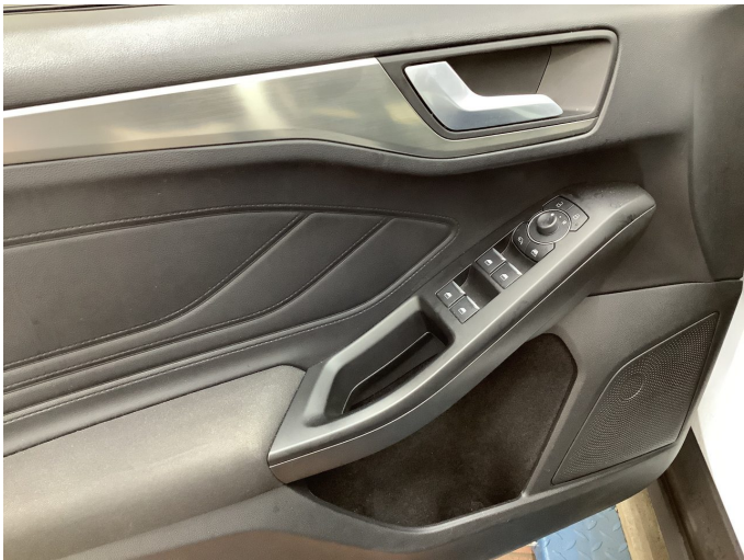
Figure 16: Misc.