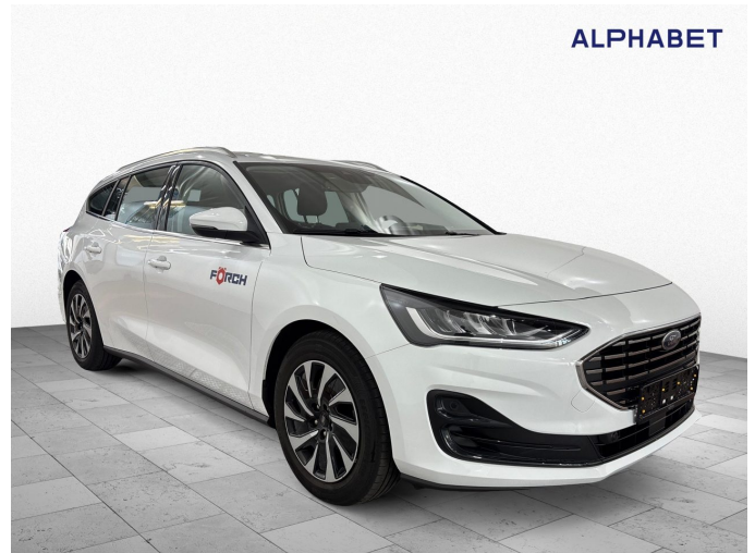
Figure 2: Diagonal front (right)