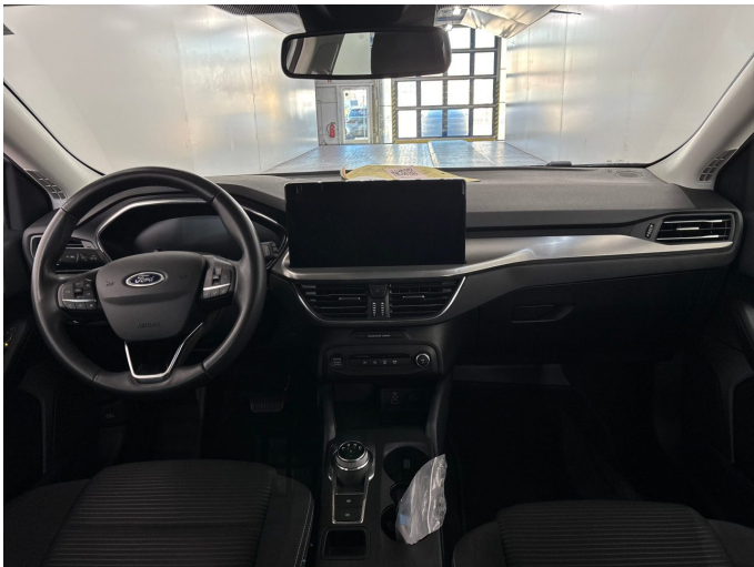
Figure 8: Instrument panel