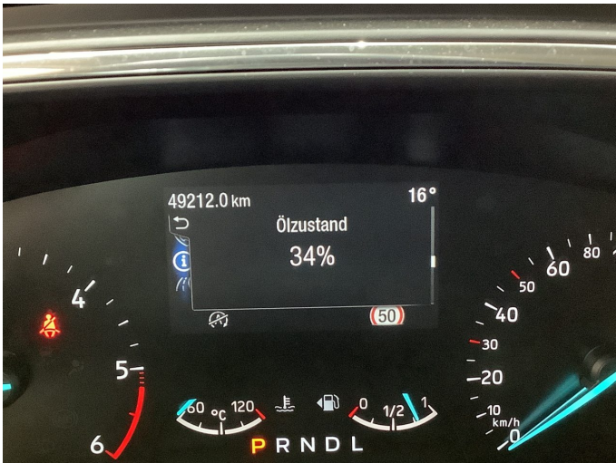
Figure 22: Misc.