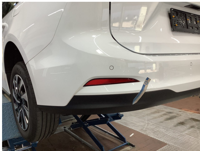
Wear and tear 1: Rear bumper: Spoiler - Scratch(es) - No deduction