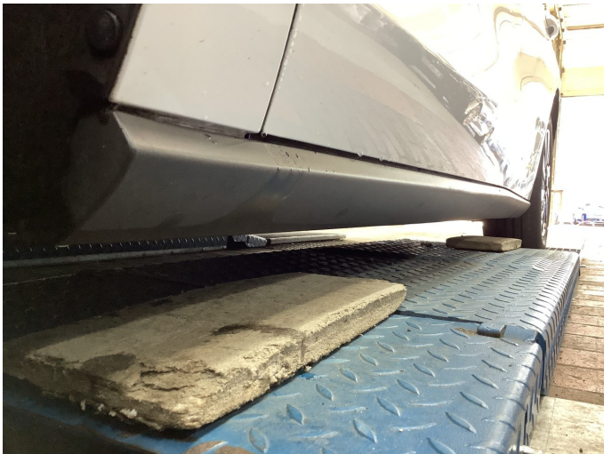
Figure 24: Misc.