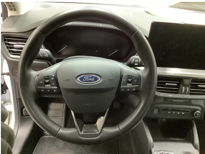
Figure 18: Misc.