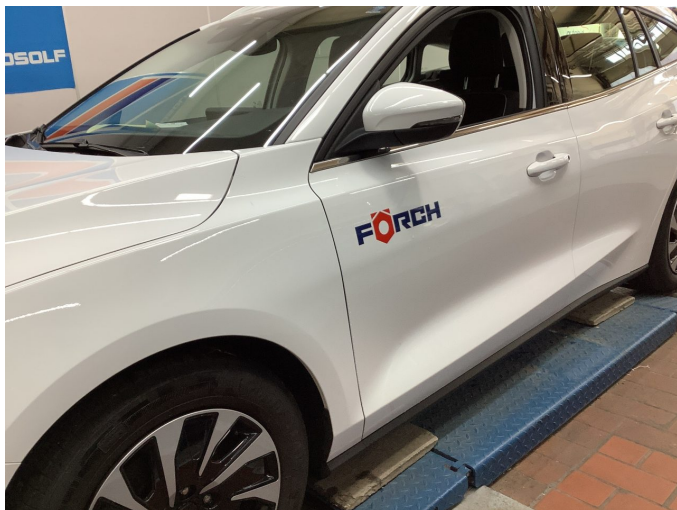
Damage 1: Body: Body - Glued / labelled - De-glue / neutralise