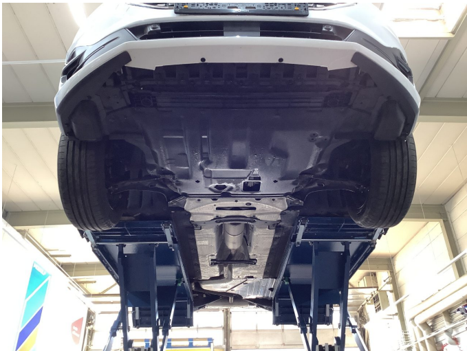
Figure 30: Misc.