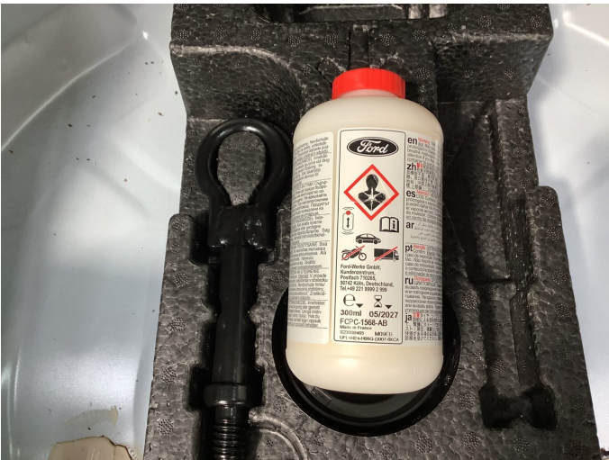
Figure 29: Misc.