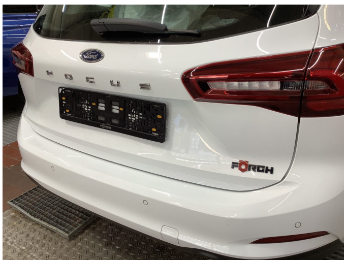
Damage 1: Body: Body - Glued / labelled - De-glue / neutralise