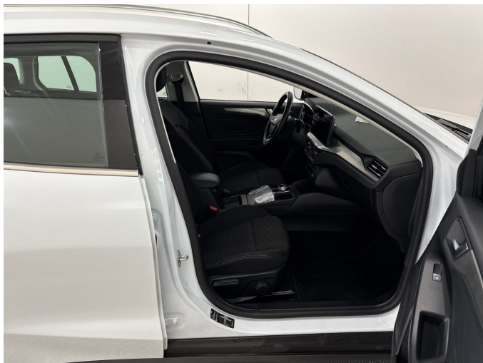
Figure 5: Interior - front