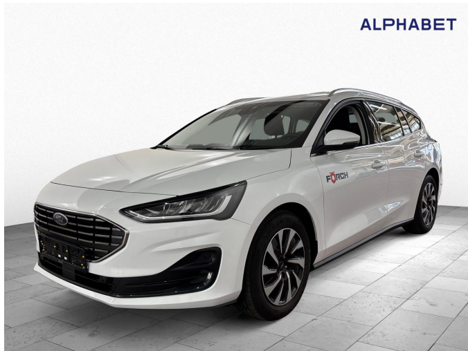
Figure 1: Diagonal front (left)