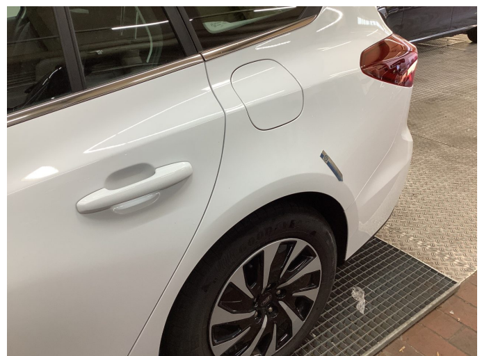
Damage 2: Side panel - rear left side: Side panel - dent(s) - Smart repair