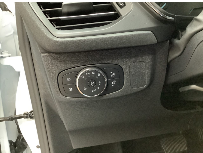
Figure 17: Misc.