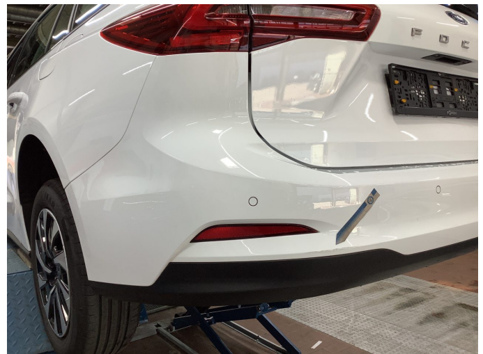
Damage 4: Rear bumper: Rear bumper - Scratched - Paint