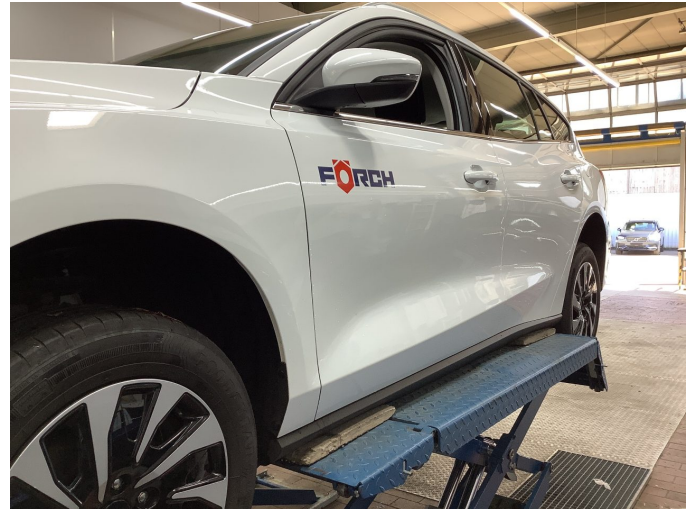
Damage 3: Body: Body (Flugrost) - Soiled - Clean