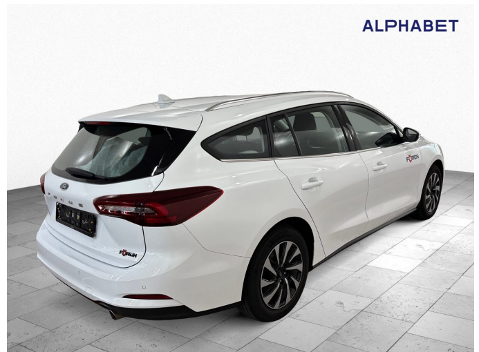
Figure 4: Diagonal rear (right)