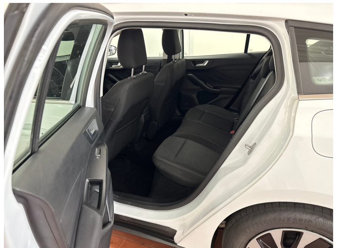
Figure 6: Interior - rear