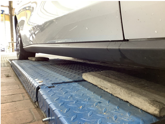
Figure 26: Misc.