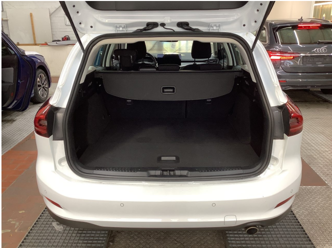
Figure 10: Cargo area