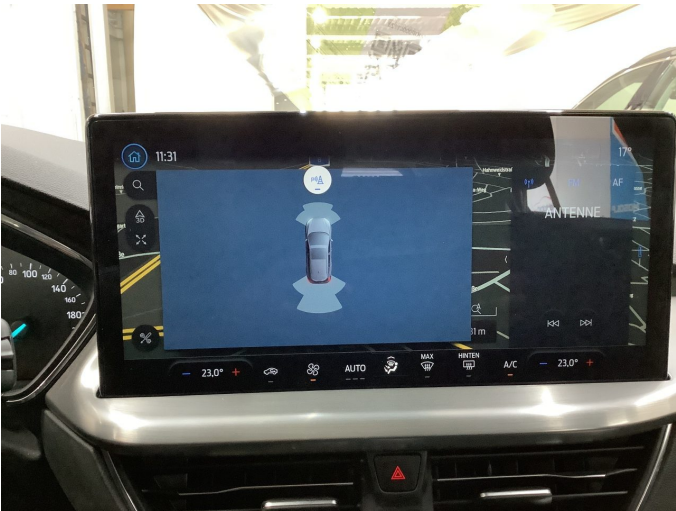
Figure 21: Misc.