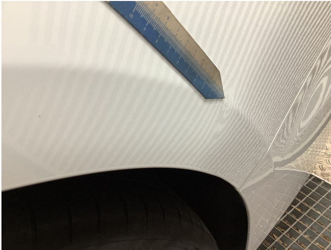
Damage 2: Side panel - rear left side: Side panel - dent(s) - Smart repair