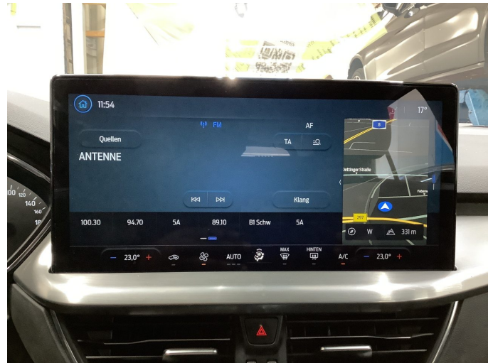
Figure 32: Misc.