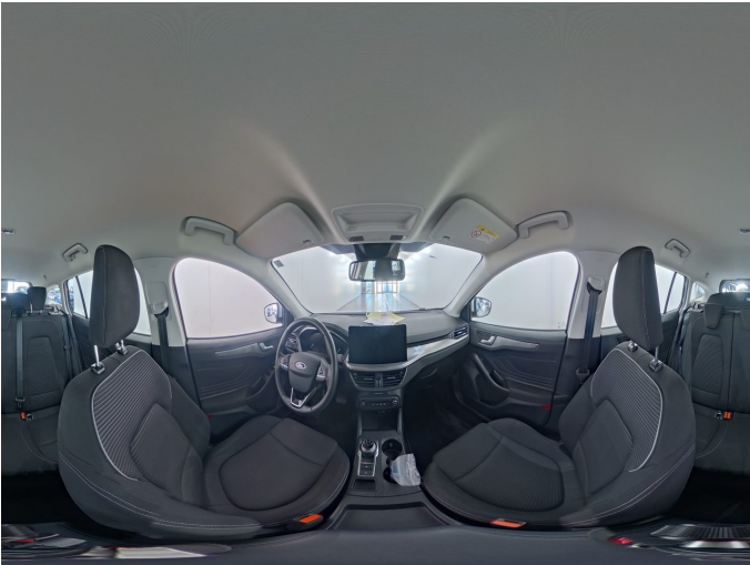
Figure 9: Interior 360° view