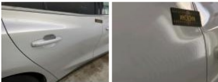
Wing FR, Scratch(es), Repair and paint (complete)