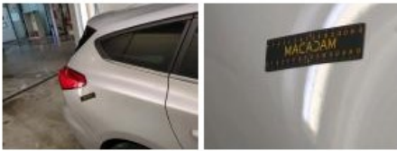
Door RR, Bad repair, Repair and paint (complete)