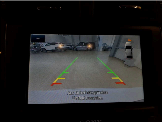
Figure 17: Misc.