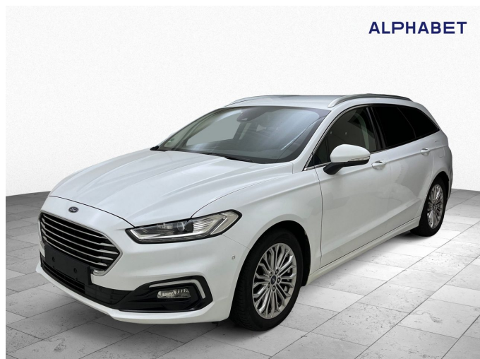
Figure 1: Diagonal front (left)