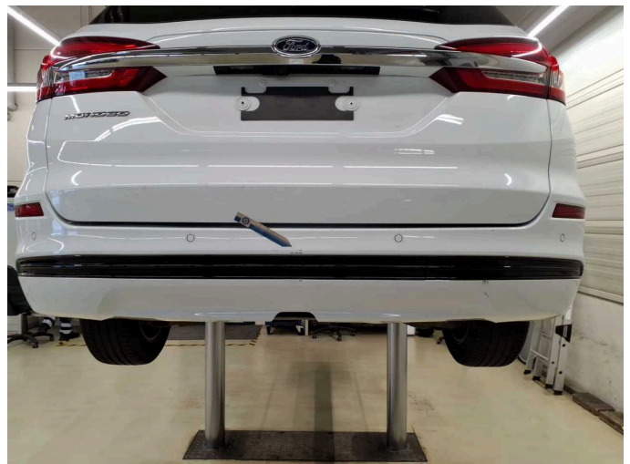
Damage 2: Rear bumper: Rear bumper - Scratch(es) - Paint