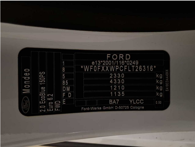
Figure 11: VIN