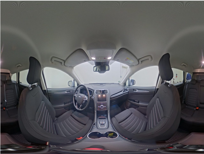
Figure 9: interior 360° view