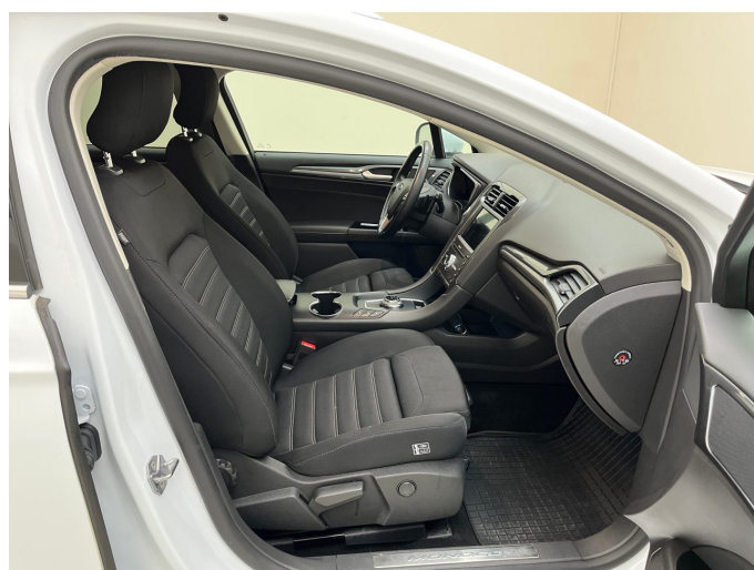
Figure 5: Interior - front