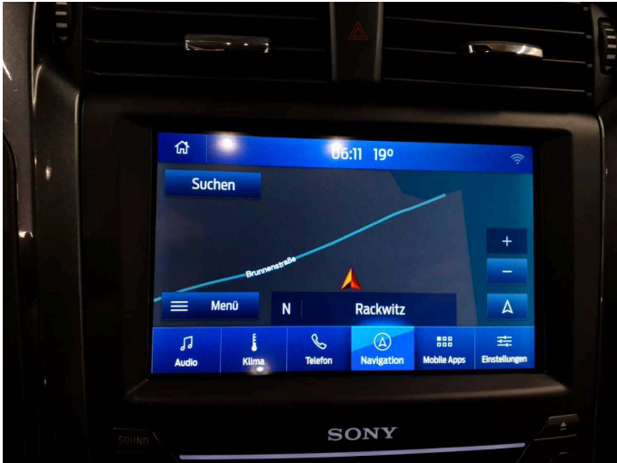
Figure 16: Navigation