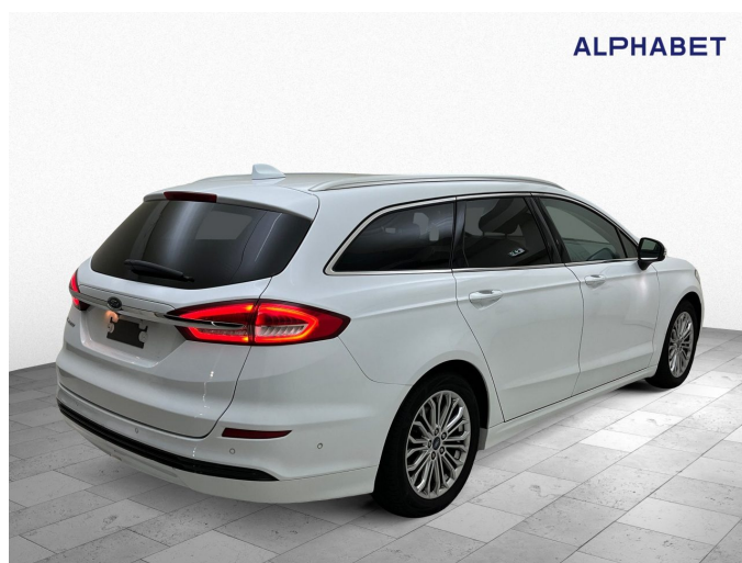
Figure 4: Diagonal rear (right)