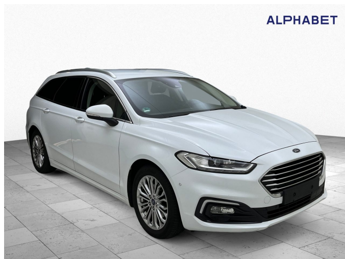
Figure 2: Diagonal front (right)