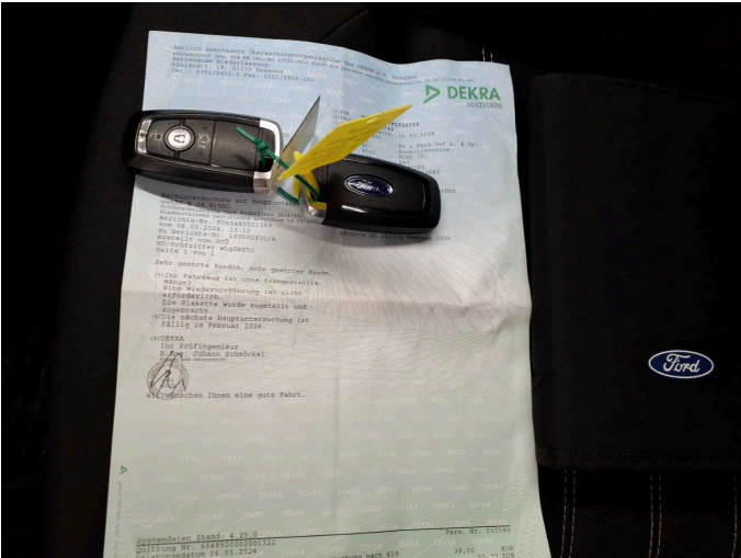
Figure 13: Documents