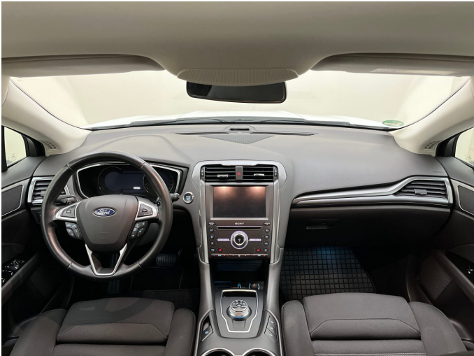
Figure 8: Instrument panel