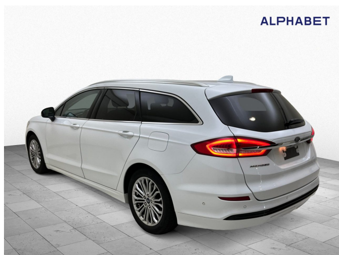
Figure 3: Diagonal rear (left)