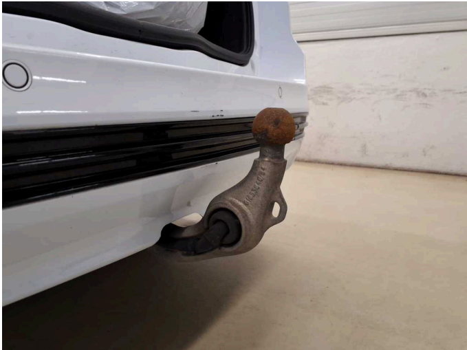
Figure 18: Misc.