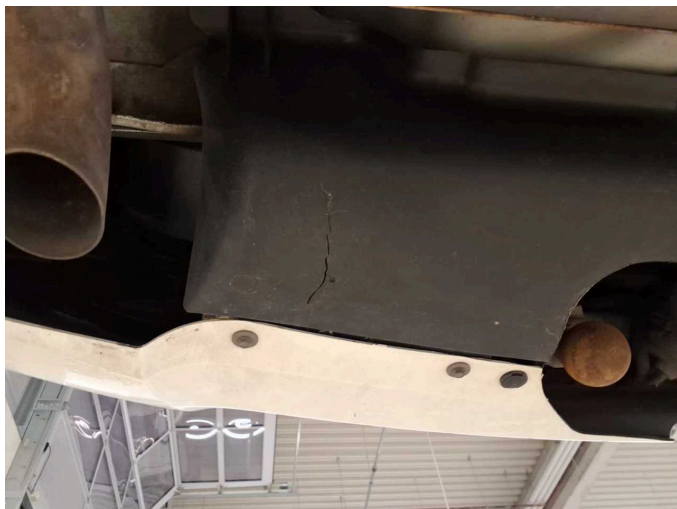
Damage 1: Body: Underbody panelling - Broken / torn - Replace