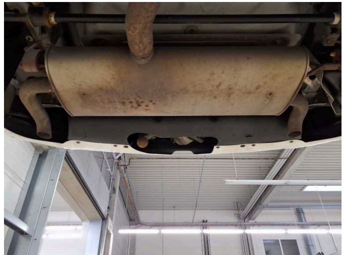
Damage 1: Body: Underbody panelling - Broken / torn - Replace