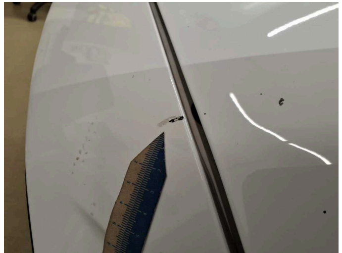
Damage 3: Front bumper: Front bumper - Scratch(es) - Paint