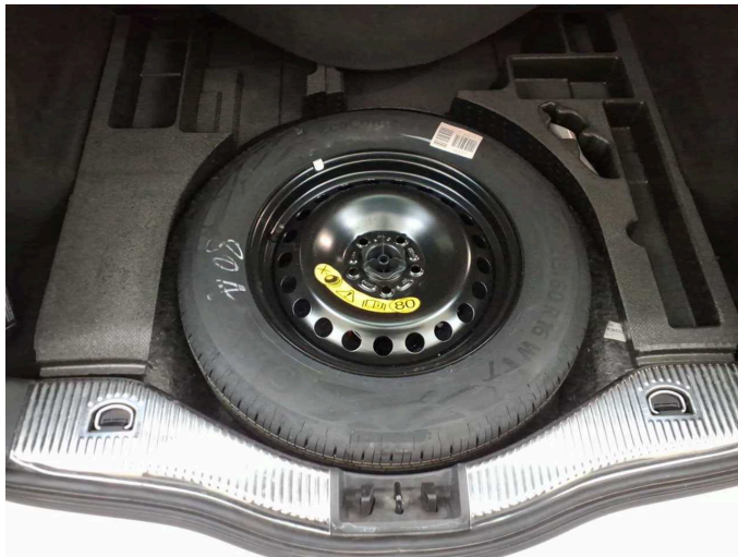
Figure 19: Misc.