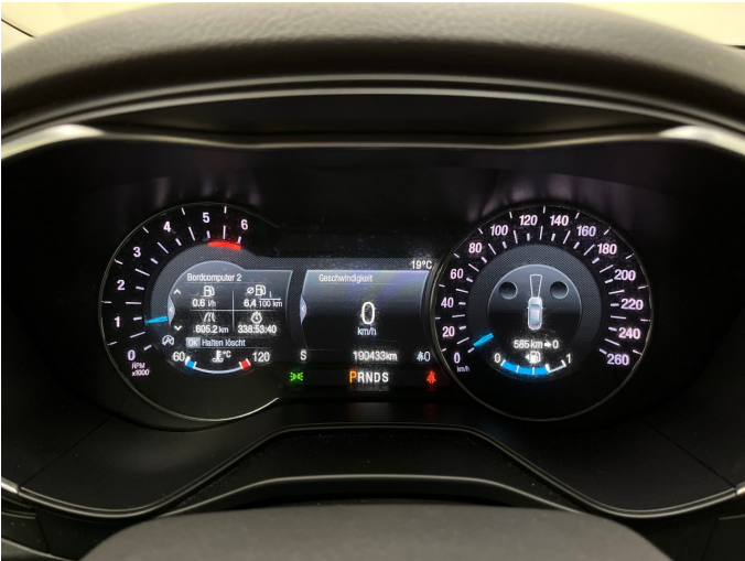
Figure 7: Instrument cluster