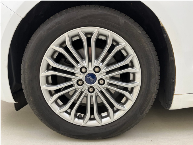
Figure 12: Mounted tyres