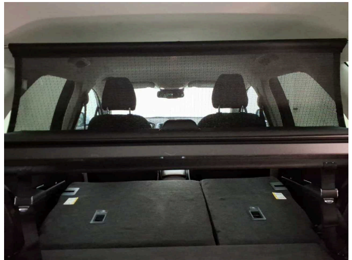
Figure 20: Misc.