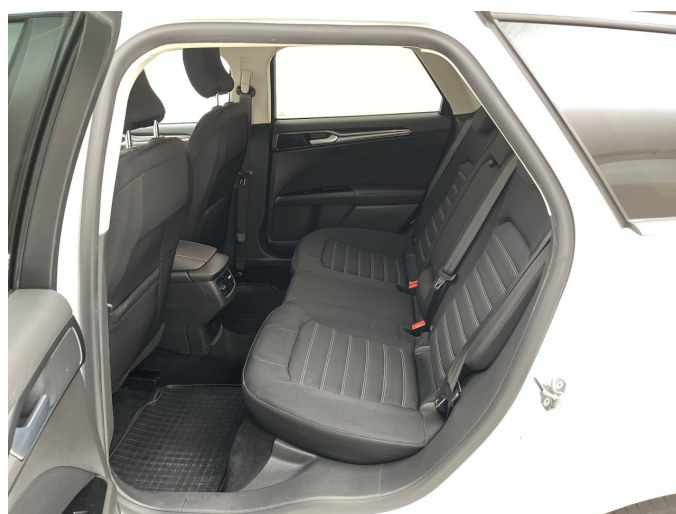
Figure 6: Interior - rear