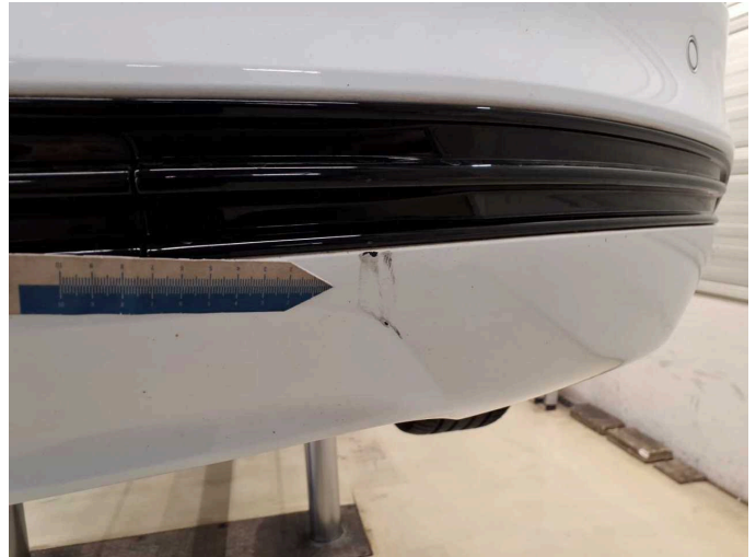
Damage 2: Rear bumper: Rear bumper - Scratch(es) - Paint