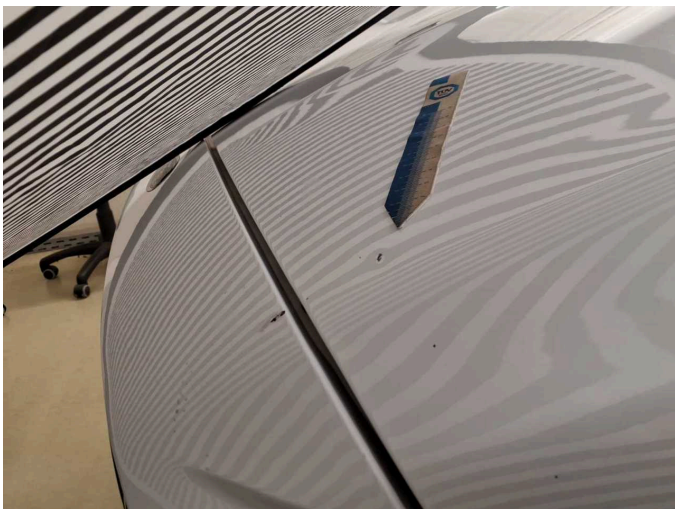
Damage 4: Bonnet: Bonnet - Dent / paintcoat damage - Repair and paint