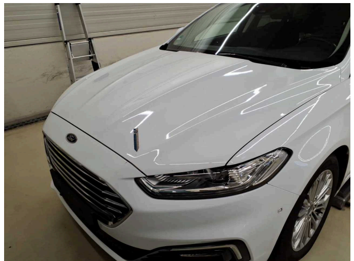
Damage 4: Bonnet: Bonnet - Dent / paintcoat damage - Repair and paint