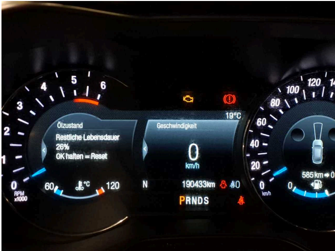
Figure 14: Documents