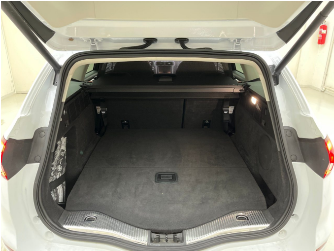
Figure 10: Cargo area