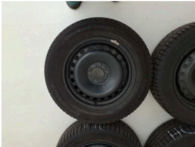
Figure 21: Misc.