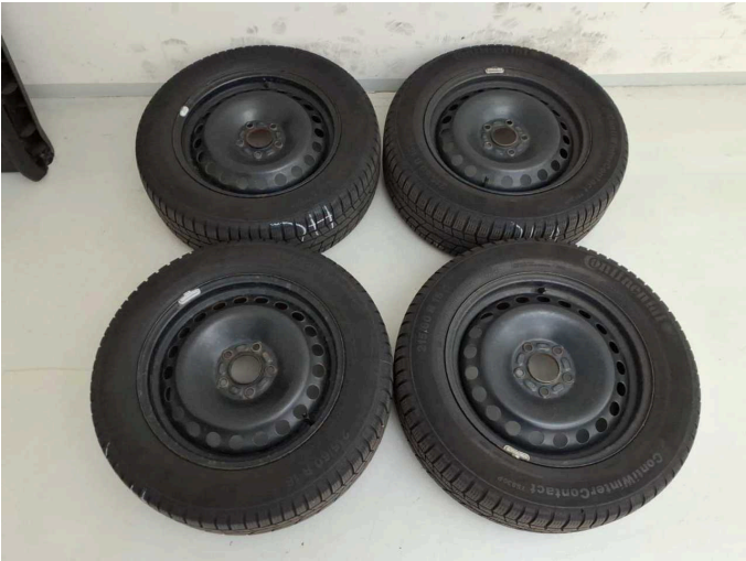
Figure 15: Additional tyres