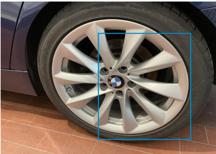
2. Rim / Back Left Out of Bodywork / Scratch -