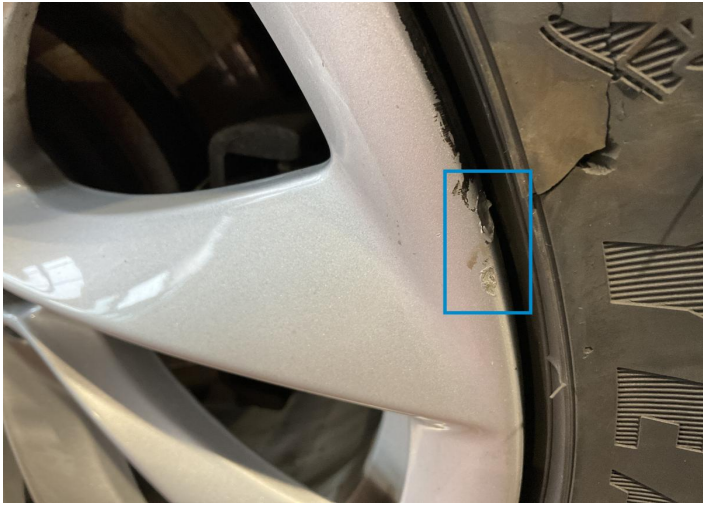
5. Rim / Back Right Paint / Stone Chip -