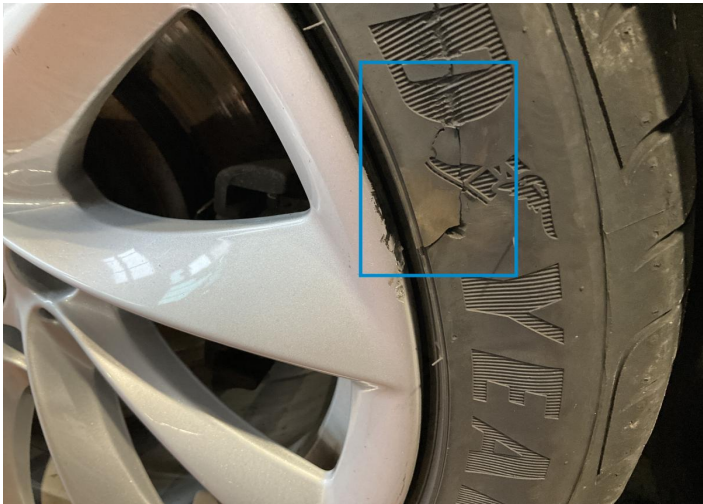
3. Tire / Back Right Bodywork / Breakage / Crack -