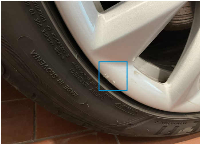
7. Rim / Front Left Paint / Stone Chip -