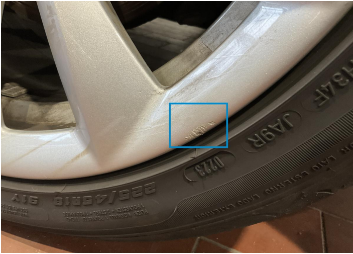
6. Rim / Front Right Paint / Stone Chip -