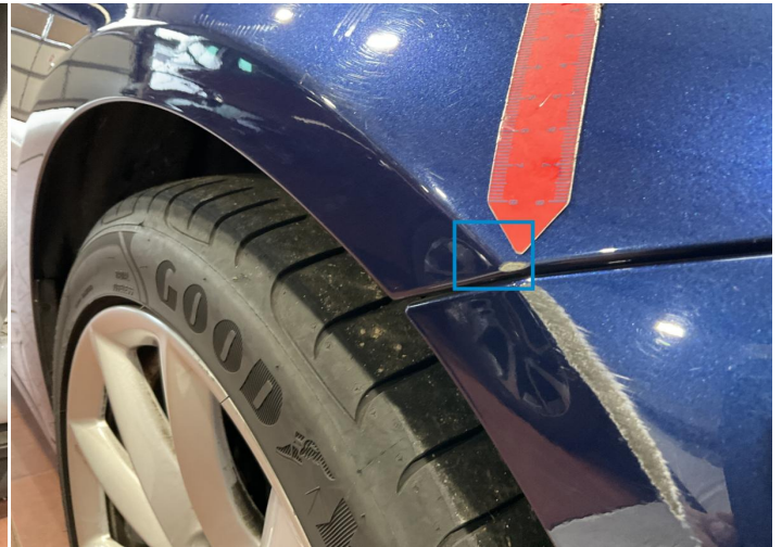
8. Fender / Front Right Paint / Stone Chip -