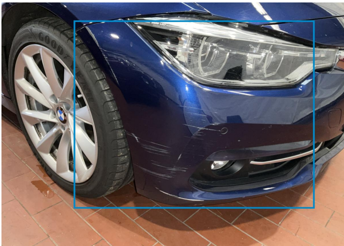
1. Bumper / Front Paint / Scratch / Scuff -