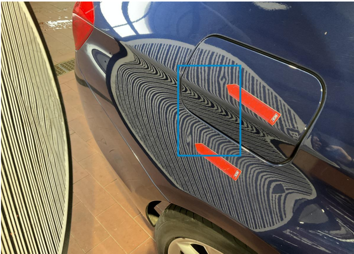
4. Fender / Back Right Bodywork / Dent / Dent -