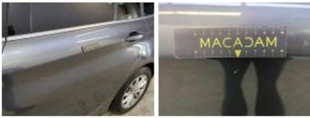
Wing RL, Dent(s) and scratch(es), Repair and paint (complete)