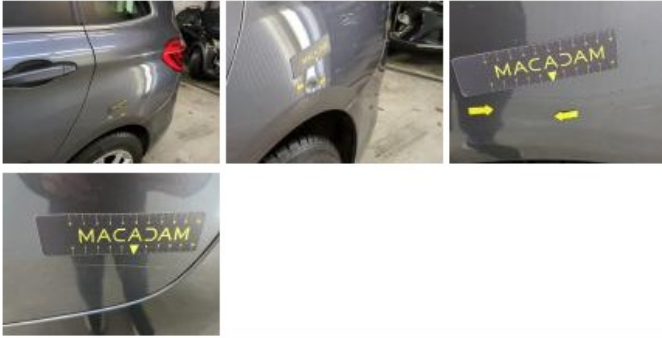
Bonnet, Hail damage, Paintless dent repair (hail)