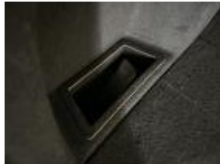
Boot lid covering R, Scratch(es), Smart repair