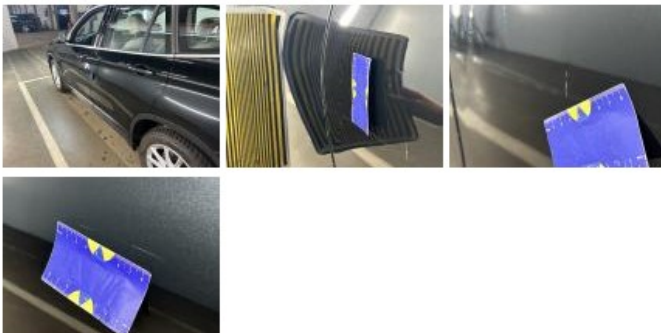
Door FL, Dent(s) and scratch(es), Spot repair