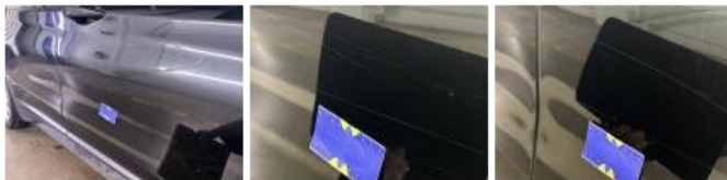
Door RR, Scratch(es), Polish