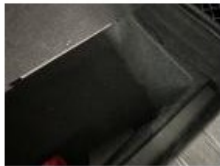
Compressor, Missing, Replace