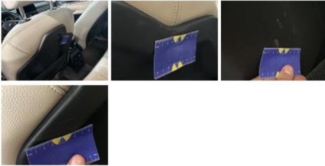
Backrest cover FR, Scratch(es), Smart repair