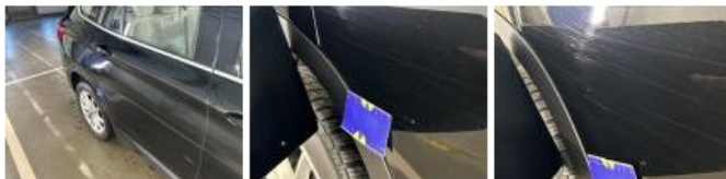
Wing RR, Scratch(es), Polish