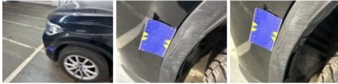
Composite repair kit, max. 1 m², Missing, Replace