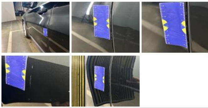
Wing trim FL, Deformed / Strained, Replace