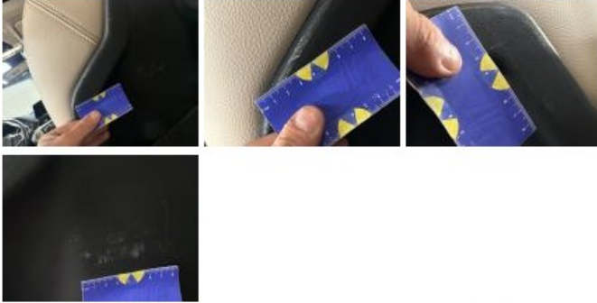
Door panel RL, Tear, Replace