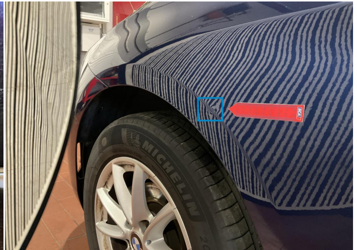
2. Fender / Front Left Bodywork / Dent / Dent -