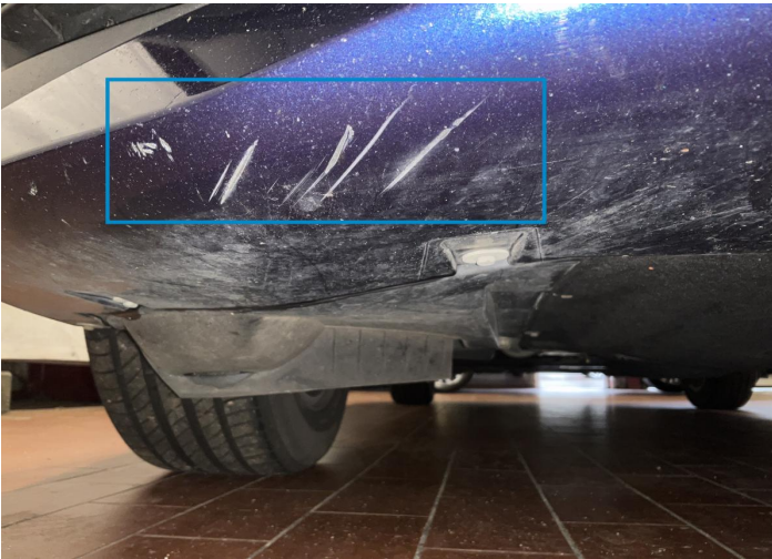
1. Bumper / Front Paint / Scratch / Scuff -