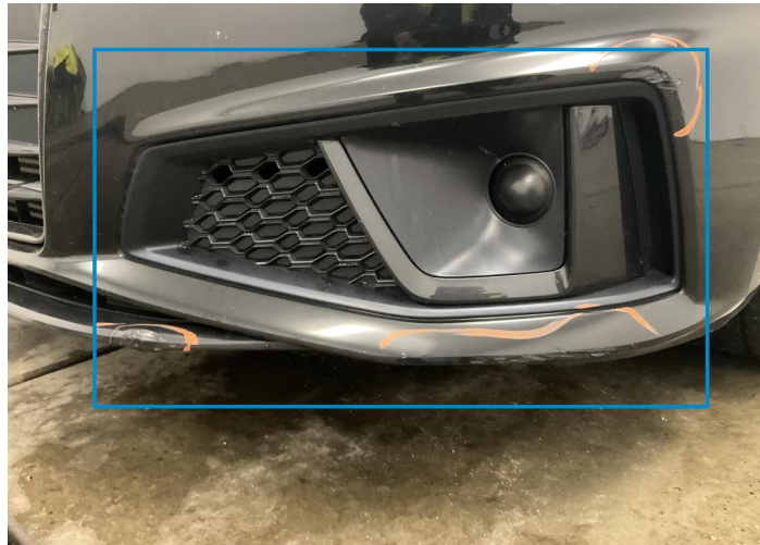
1. Corner Bumper / Front Left Bodywork / Breakage / Hole -