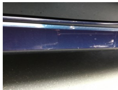
Left sill - Scratch