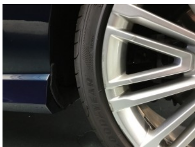
Rear left rim - Scratch