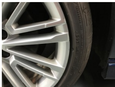
Front left rim - Scratch