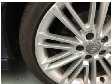
Front right rim - Scratch