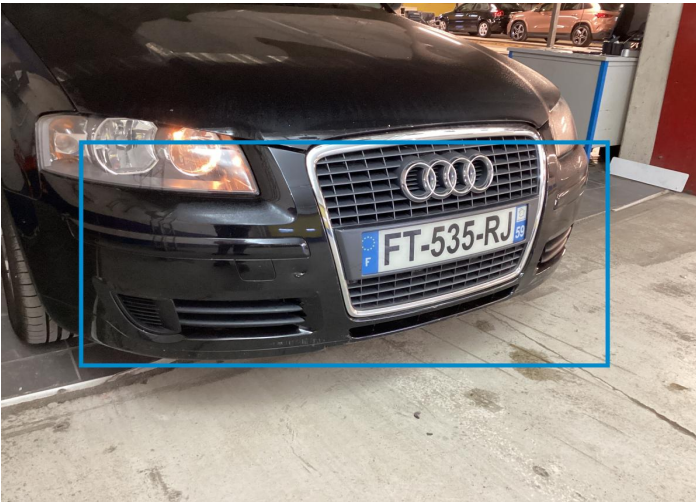
9. Bumper / Front Paint / Scratch / Scuff -