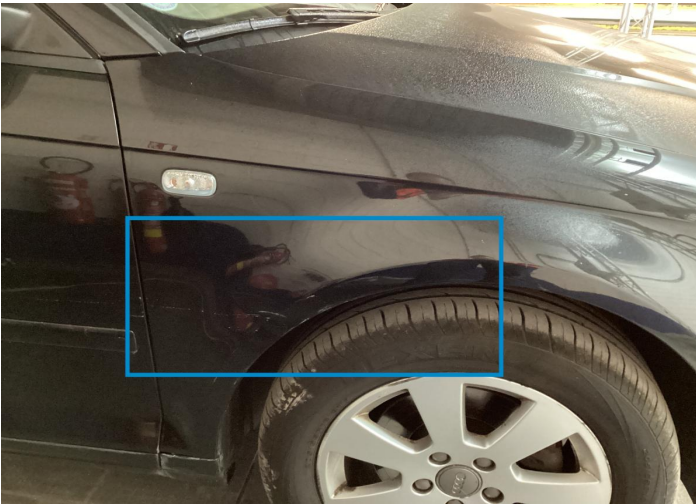
7. Fender / Front Right Paint / Scratch / Scuff -