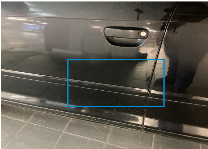
2. Door / Front Left Paint / Scratch / Scuff -