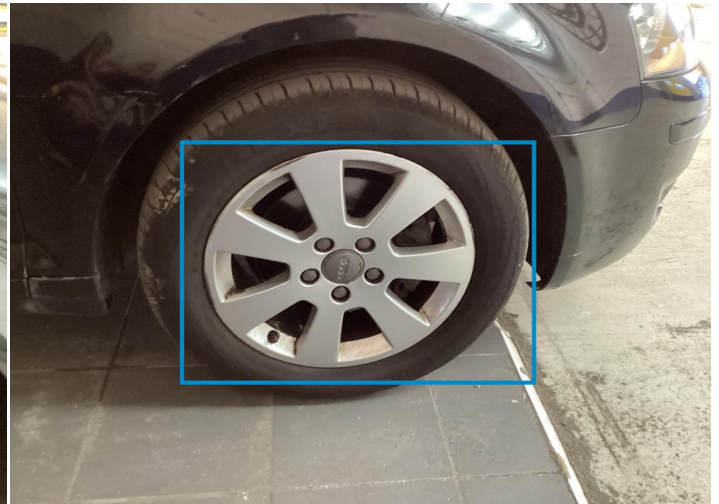
8. Rim / Front Right Out of Bodywork / Scratch -