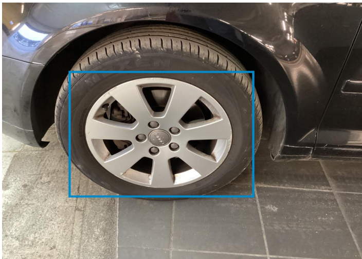
1. Rim / Front Left Out of Bodywork / Scratch -