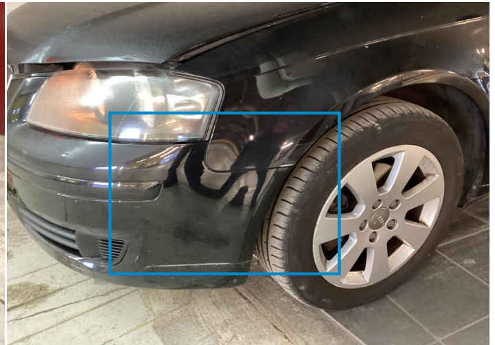
10. Bumper / Front Paint / Scratch / Scuff -