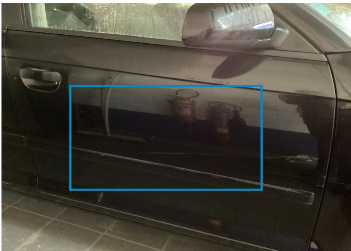
6. Door / Front Right Paint / Scratch / Scuff -