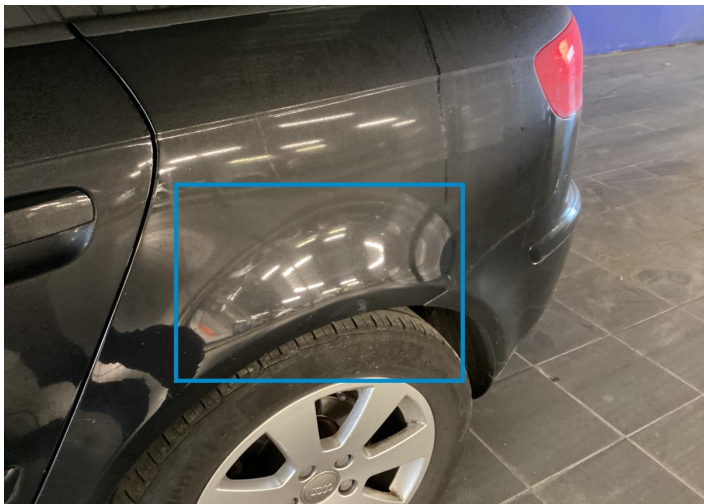
3. Fender / Back Left Paint / Scratch / Scuff -