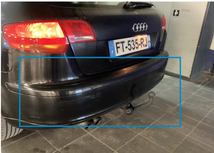
4. Bumper / Back Paint / Scratch / Scuff -