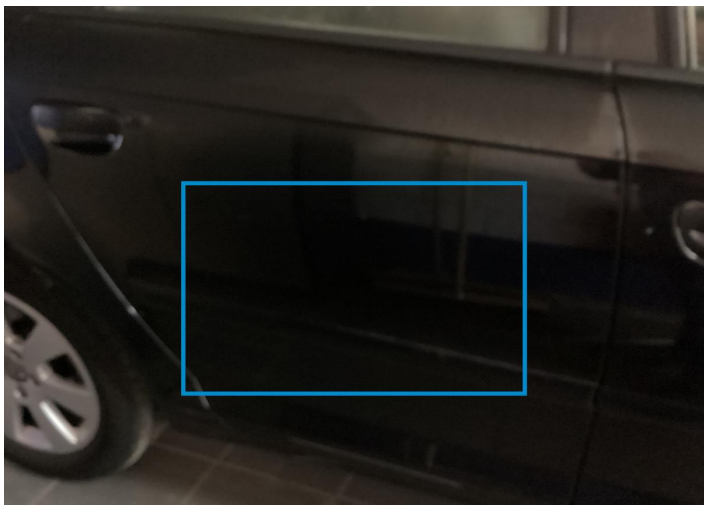
5. Door / Back Right Paint / Scratch / Scuff -