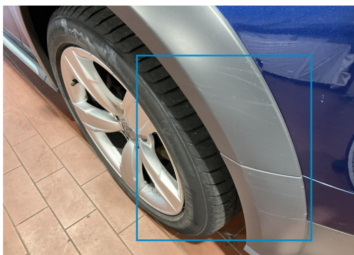
5. Wing Stick / Front Right Paint / Scratch / Line -