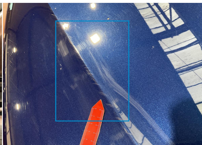
2. Hood Paint / Scratch / Line -