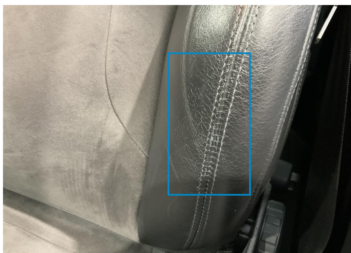
3. Seat / Front Left Interior / Scratched -