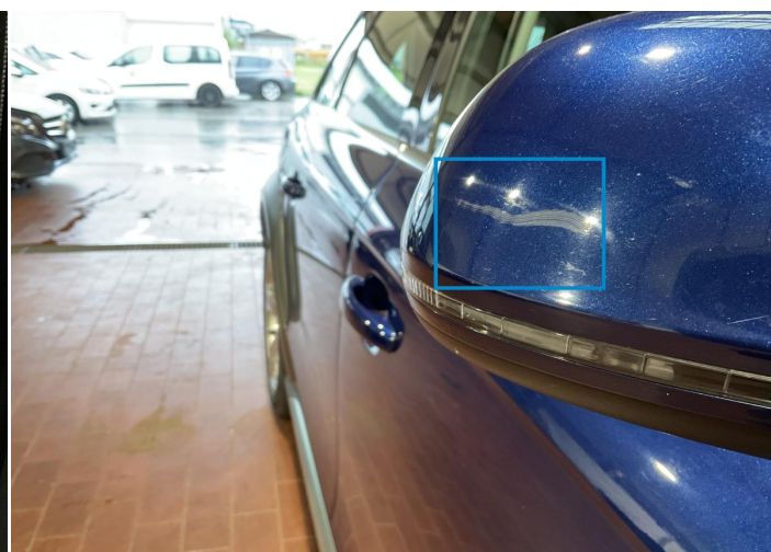
4. Mirror / Front Right Paint / Scratch / Scuff -