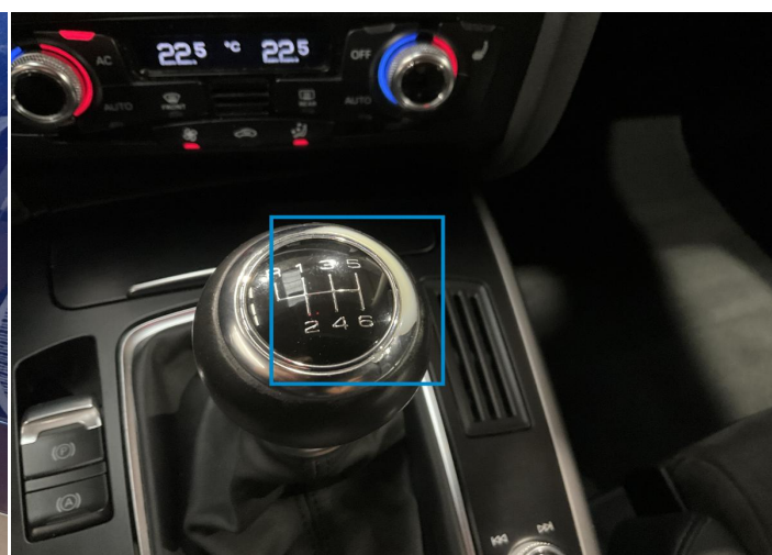
6. Gear Knob Interior / Scratched -