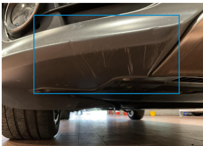
1. Blade/spoiler / Front Paint / Scratch / Scuff -