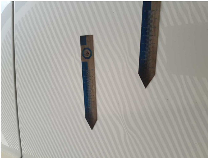
Damage 4: Sliding door, right: Sliding door - Deformed - Repair and paint