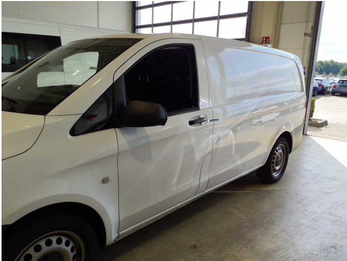
Wear and tear 5: Door - front left side: Door - dent(s) - No deduction