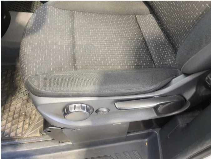
Figure 19: Misc.