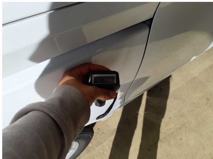
Repainting 1: Bonnet, Side panel - rear right side, Door - rear right side