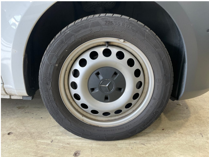
Figure 12: Mounted tyres