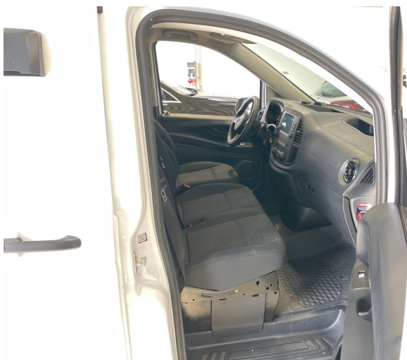
Figure 5: Interior - front