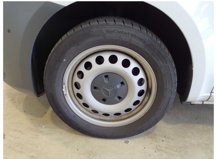
Damage 2: Wheel / tyres: Tyre - front - Does not meet the leasing specifications - Replace