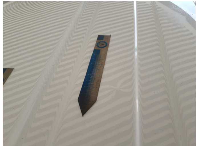
Damage 3: Roof: Roof - Dent / paintcoat damage - Loss in value