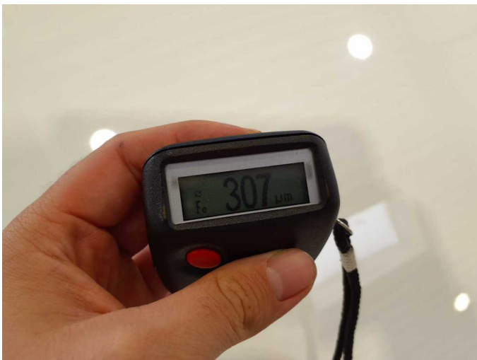
Repainting 1: Bonnet, Side panel - rear right side, Door - rear right side