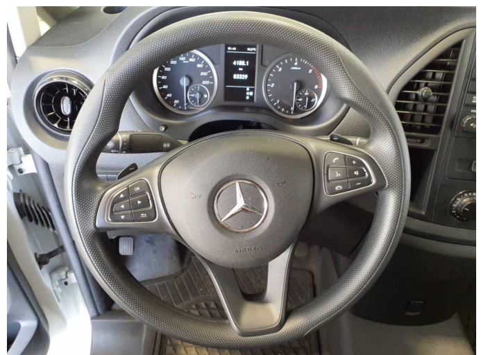
Figure 18: Misc.