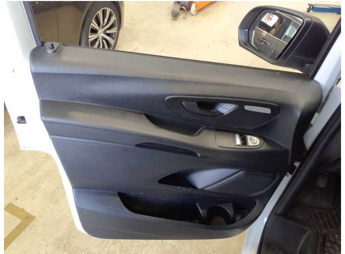
Figure 20: Misc.