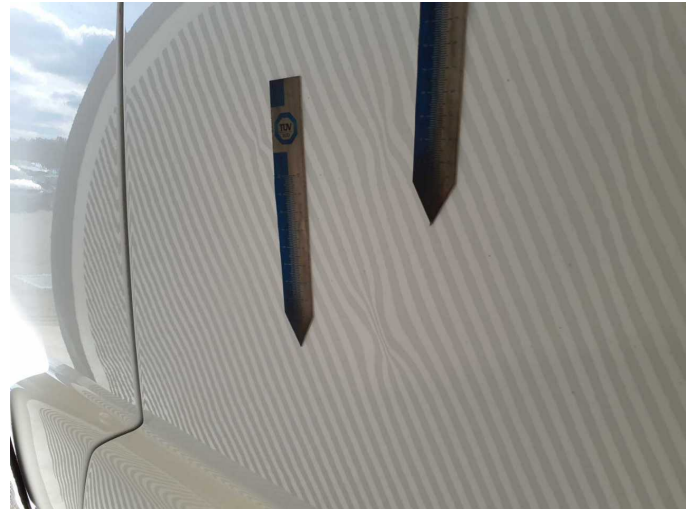
Damage 4: Sliding door, right: Sliding door - Deformed - Repair and paint