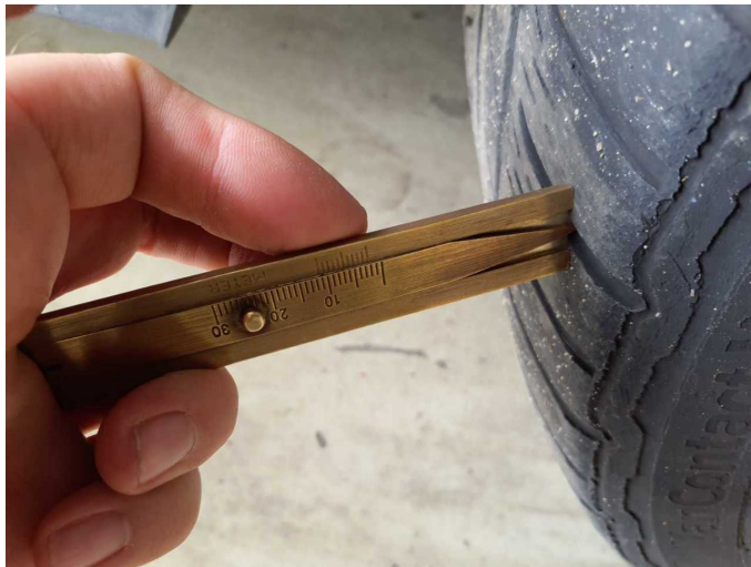
Damage 2: Wheel / tyres: Tyre - front - Does not meet the leasing specifications - Replace