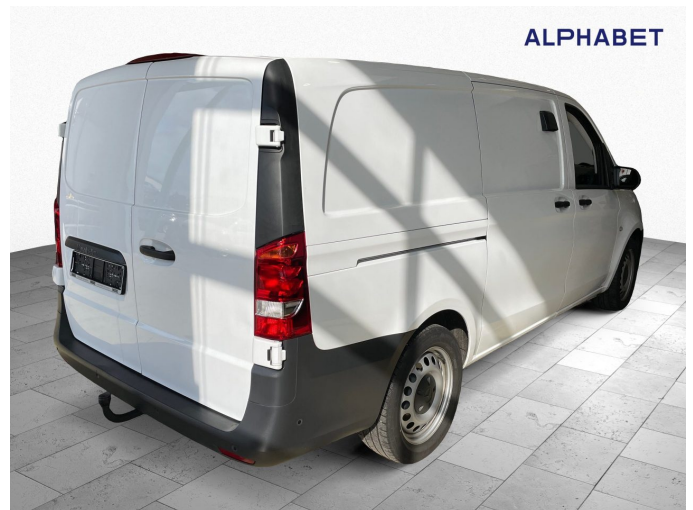
Figure 4: Diagonal rear (right)