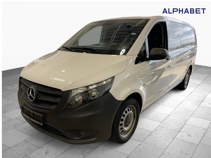
Figure 1: Diagonal front (left)