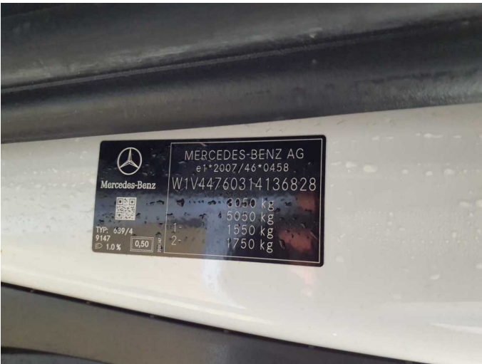
Figure 11: VIN