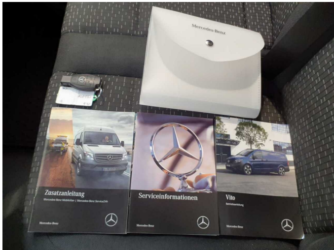
Figure 13: Documents