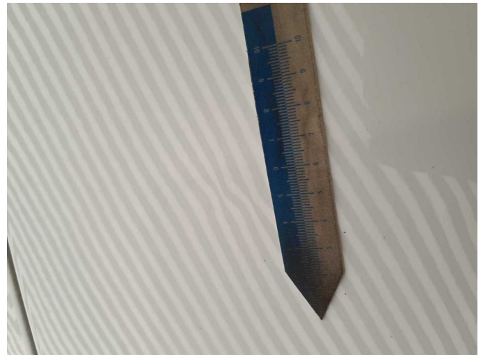
Damage 4: Sliding door, right: Sliding door - Deformed - Repair and paint