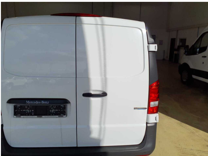
Damage 5: Boot lid / rear door: Rear door - right side - Deformed - Repair and paint