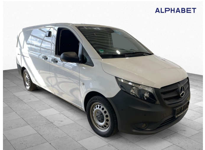
Figure 2: Diagonal front (right)