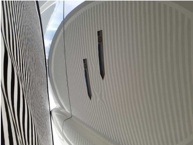
Damage 4: Sliding door, right: Sliding door - Deformed - Repair and paint