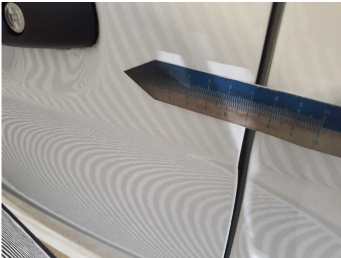
Wear and tear 5: Door - front left side: Door - dent(s) - No deduction