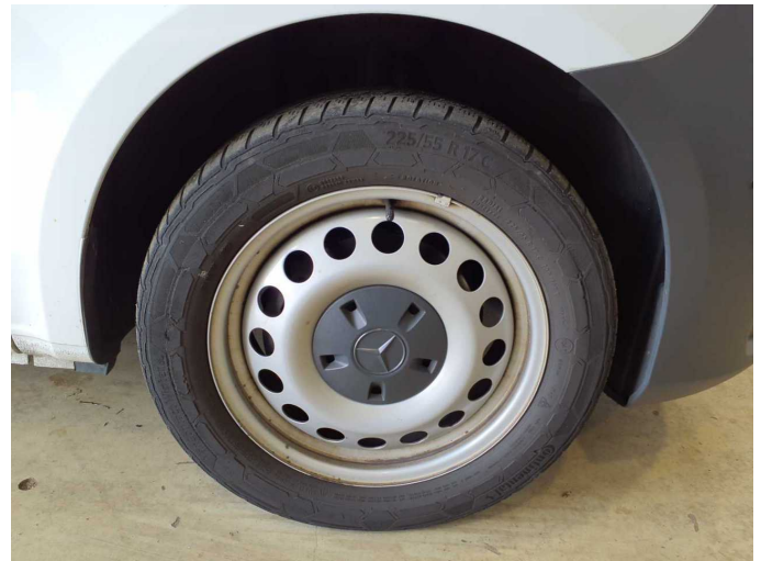
Damage 2: Wheel / tyres: Tyre - front - Does not meet the leasing specifications - Replace