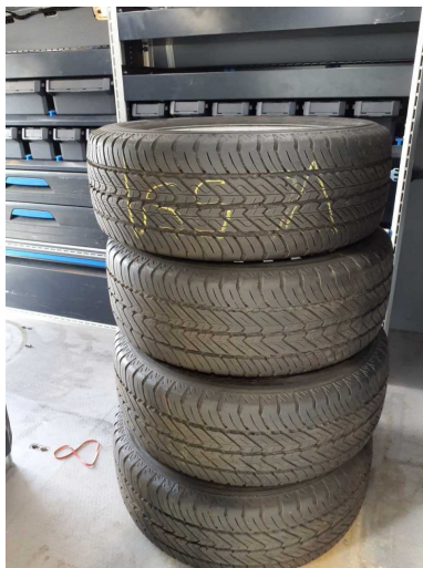
Figure 15: Additional tyres