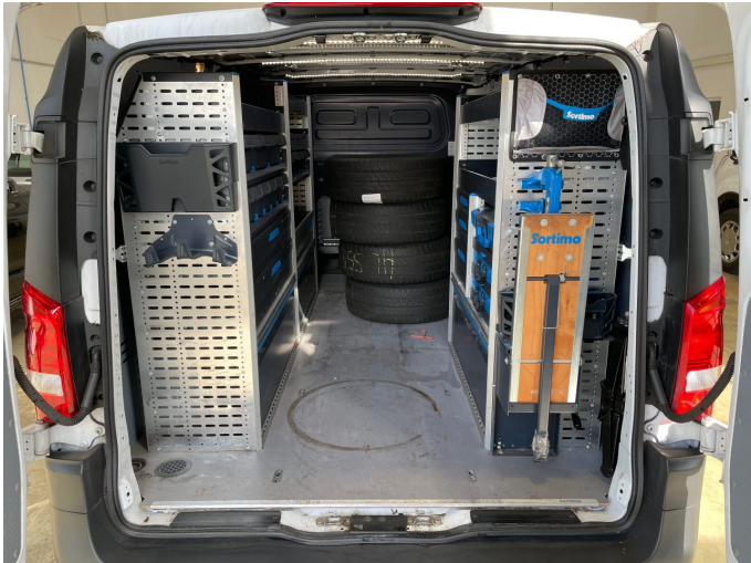
Figure 10: Cargo area