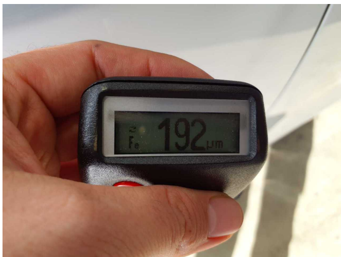
Repainting 1: Bonnet, Side panel - rear right side, Door - rear right side