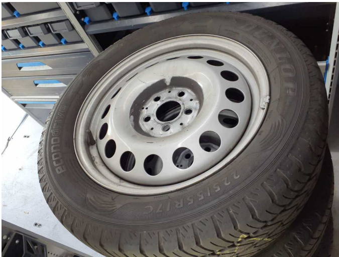
Figure 21: Misc.