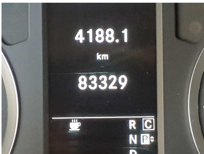
Figure 17: Misc.