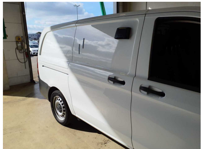
Damage 4: Sliding door, right: Sliding door - Deformed - Repair and paint