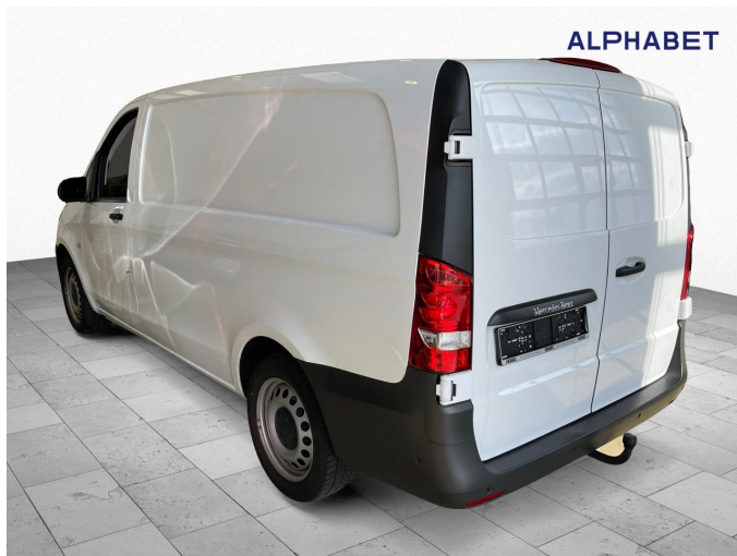
Figure 3: Diagonal rear (left)