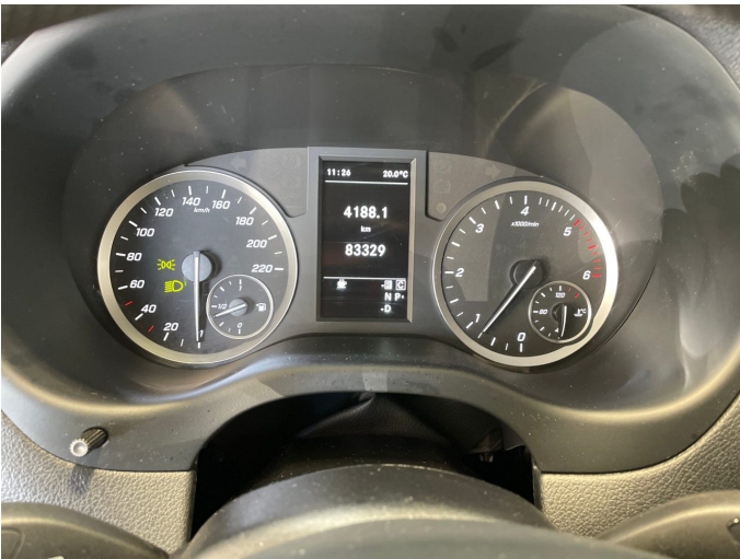
Figure 7: Instrument cluster