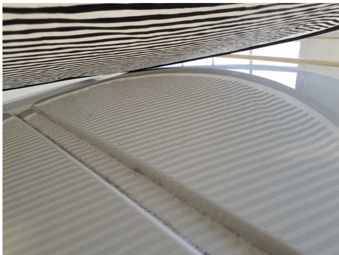
Damage 3: Roof: Roof - Dent / paintcoat damage - Loss in value