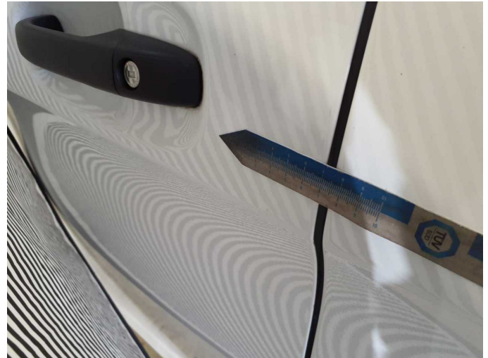
Wear and tear 5: Door - front left side: Door - dent(s) - No deduction