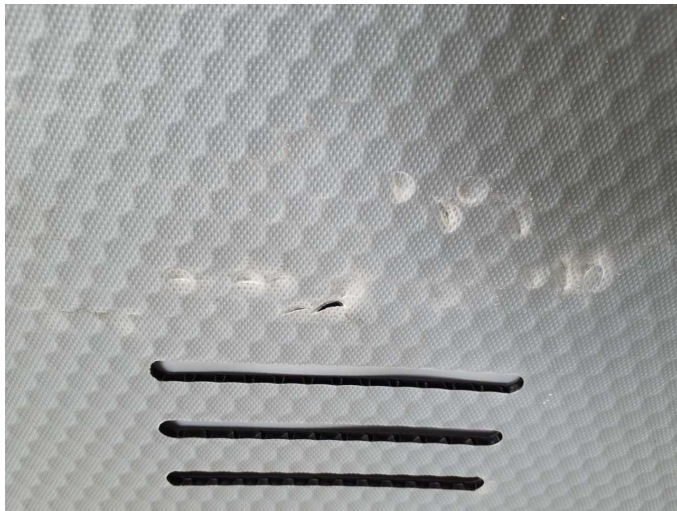
Damage 1: Boot lid / rear door: Rear door - left side (Innenverkleidung) - Damaged - Replace