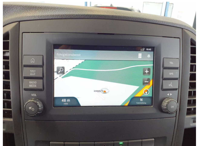
Figure 16: Navigation