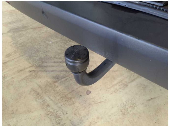
Figure 22: Misc.