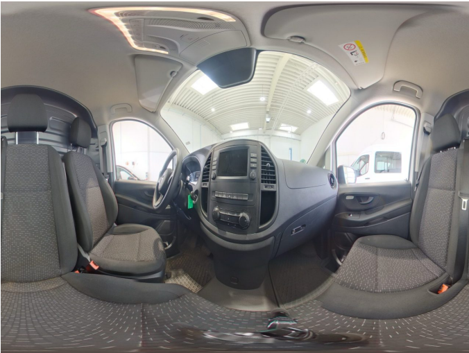
Figure 9: Interior 360° view