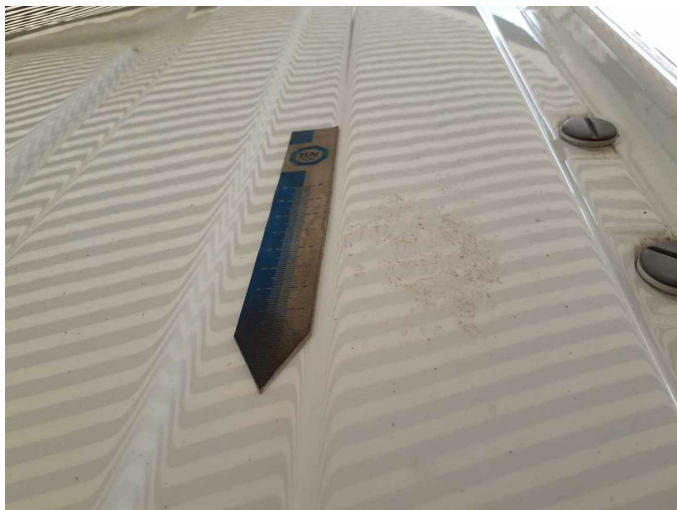
Damage 3: Roof: Roof - Dent / paintcoat damage - Loss in value