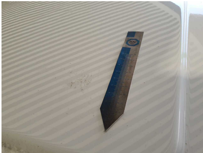
Damage 3: Roof: Roof - Dent / paintcoat damage - Loss in value