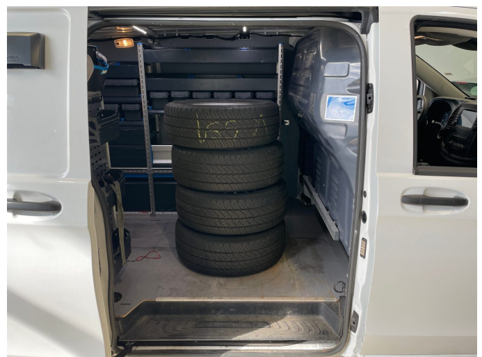
Figure 6: Interior - rear