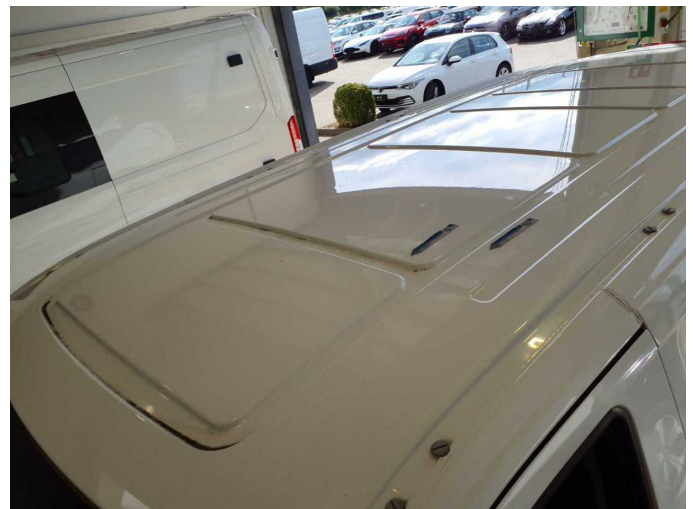
Damage 3: Roof: Roof - Dent / paintcoat damage - Loss in value