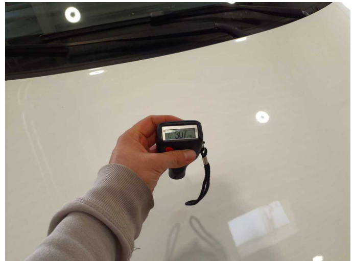
Repainting 1: Bonnet, Side panel - rear right side, Door - rear right side