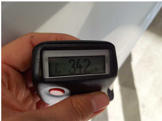
Repainting 1: Bonnet, Side panel - rear right side, Door - rear right side