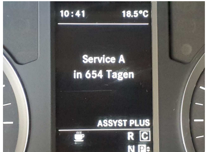
Figure 14: Documents