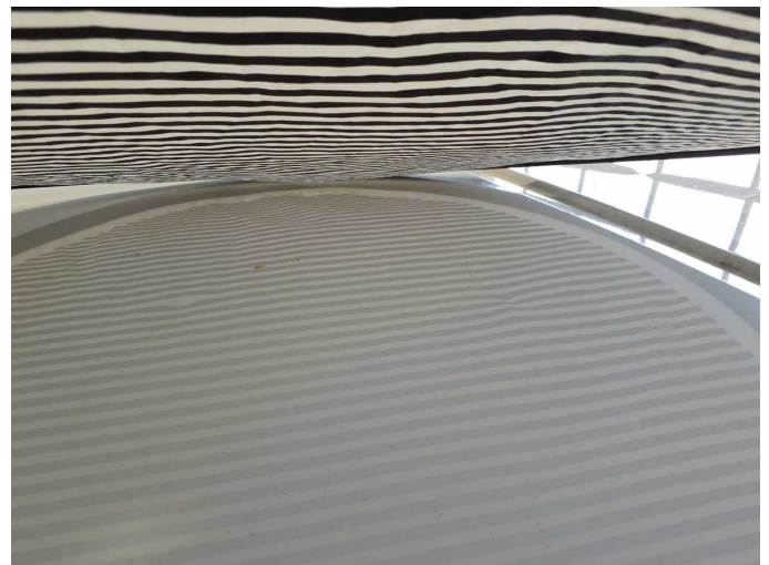
Damage 3: Roof: Roof - Dent / paintcoat damage - Loss in value