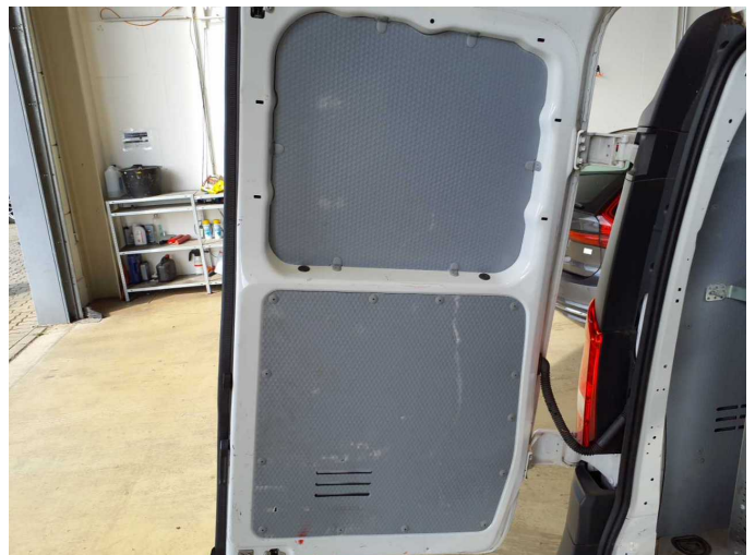
Damage 1: Boot lid / rear door: Rear door - left side (Innenverkleidung) - Damaged - Replace