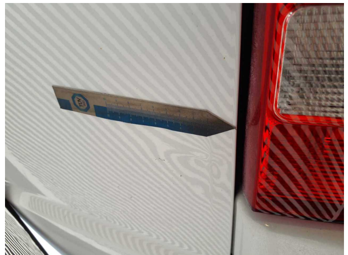
Damage 5: Boot lid / rear door: Rear door - right side - Deformed - Repair and paint