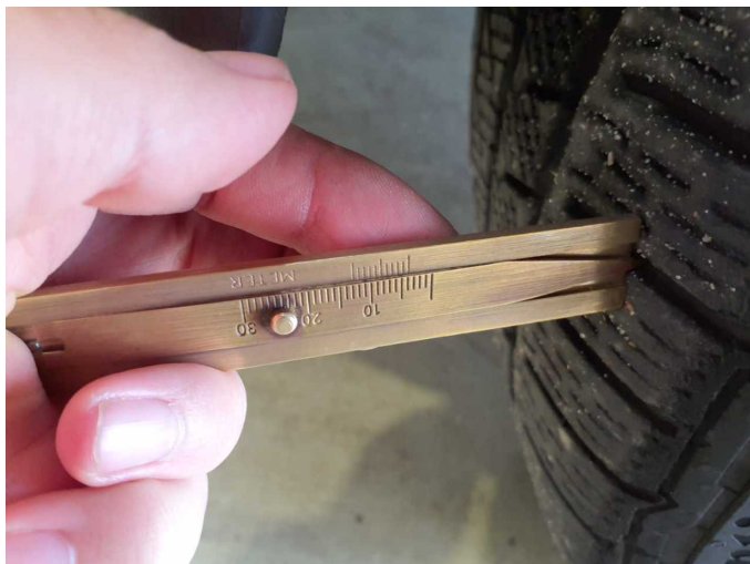
Damage 2: Wheel / tyres: Tyre - front - Does not meet the leasing specifications - Replace