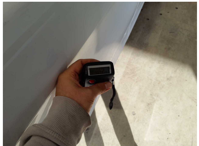
Repainting 1: Bonnet, Side panel - rear right side, Door - rear right side