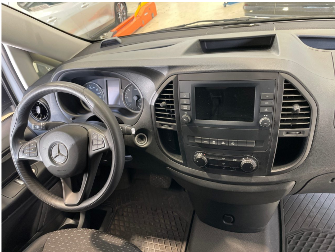
Figure 8: Instrument panel