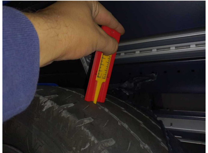
Damage 1: 2nd wheel set: Tyres - complete set - Does not meet the leasing specifications - No deduction