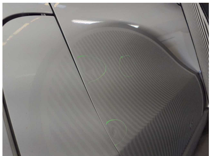
Damage 5: Sliding door - left side: Sliding door (Dellen+Beulen) - dent(s) - Smart repair