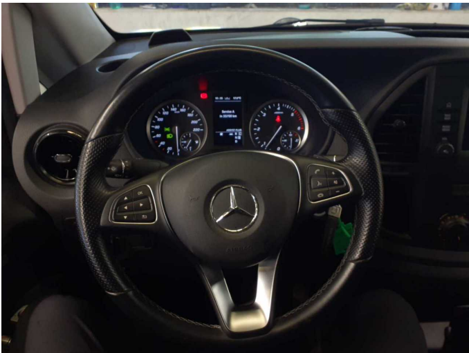
Figure 22: Misc.