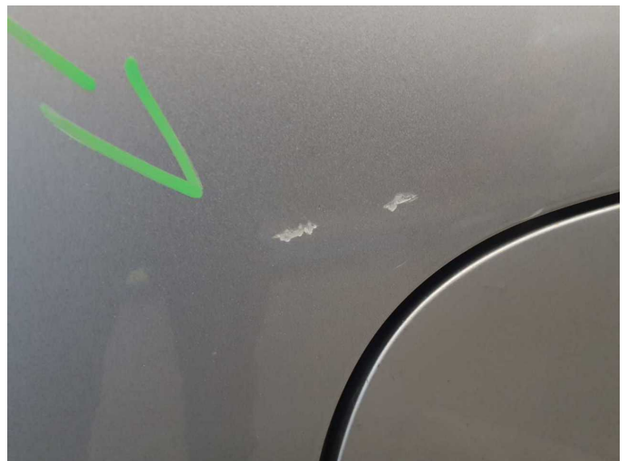
Damage 3: Door - front left side: Door - Scratch(es) - Smart repair