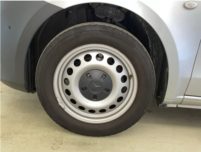
Figure 13: Mounted tyres