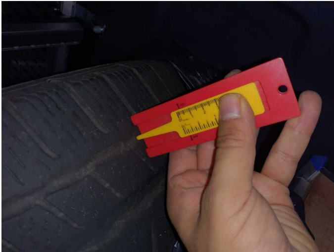
Damage 1: 2nd wheel set: Tyres - complete set - Does not meet the leasing specifications - No deduction