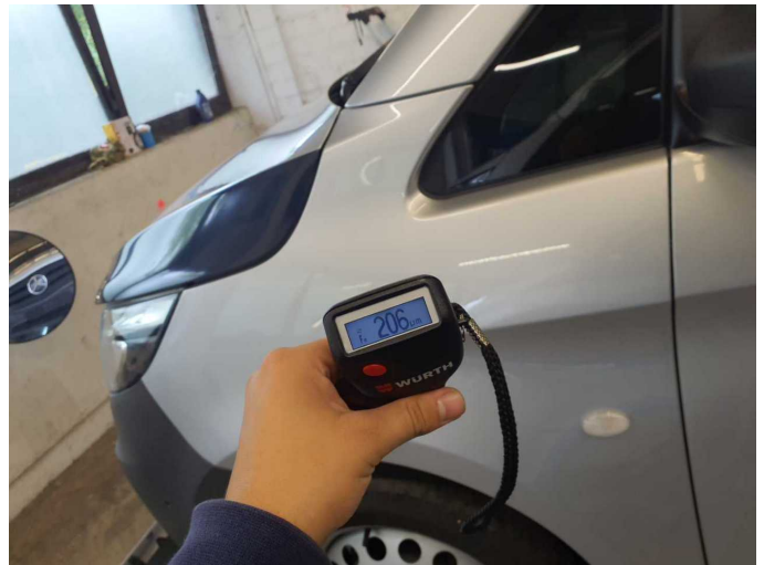
Repainting 1: Mudguard - left side, Door - front left side