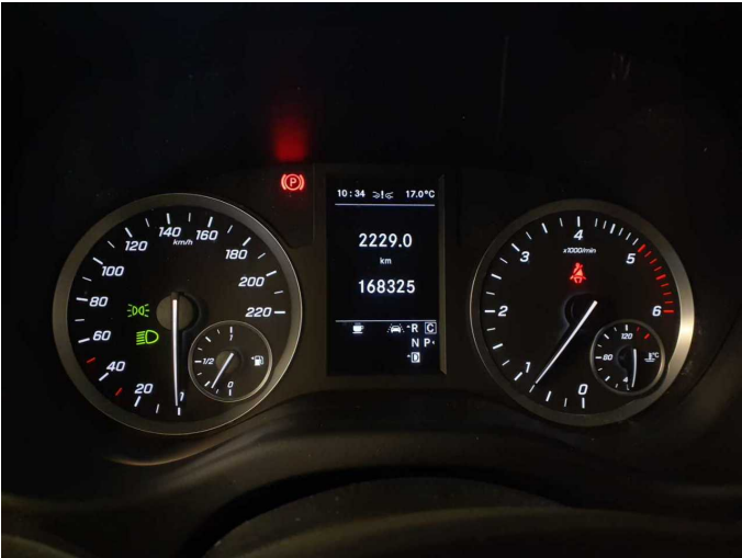
Figure 7: Instrument cluster