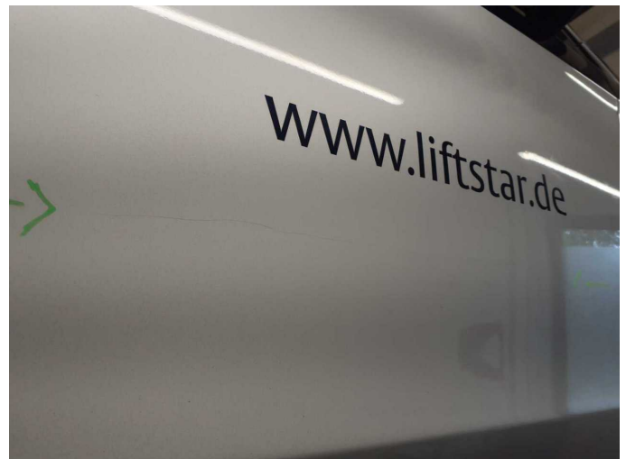
Damage 8: Door - front right side: Door (Dellen+Kratzer) - Dent / paintcoat damage - Repair and paint