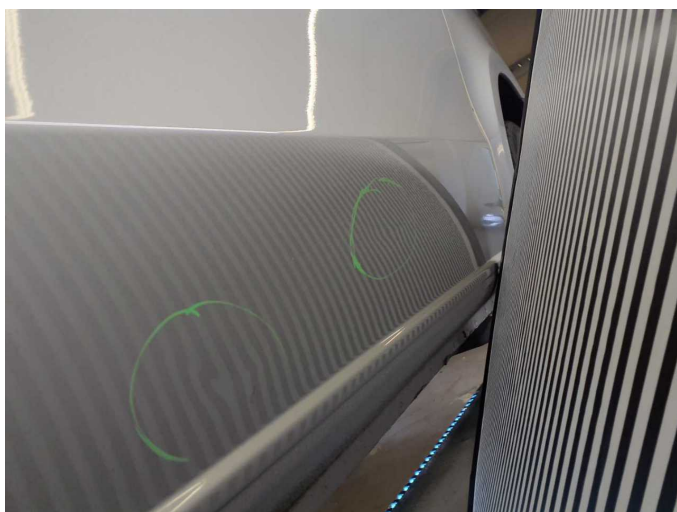
Damage 5: Sliding door - left side: Sliding door (Dellen+Beulen) - dent(s) - Smart repair