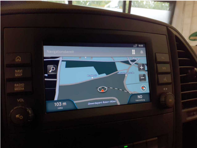
Figure 17: Navigation