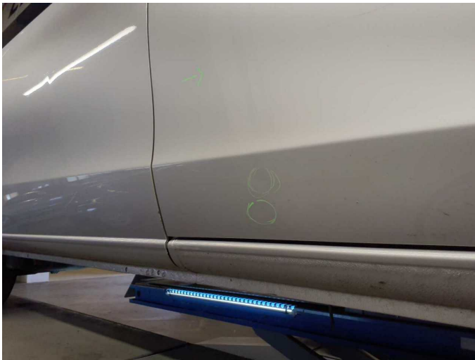
Damage 8: Door - front right side: Door (Dellen+Kratzer) - Dent / paintcoat damage - Repair and paint