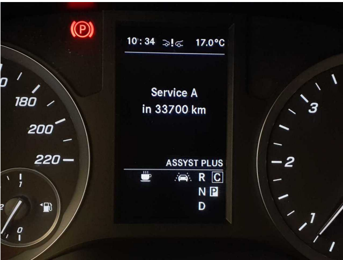
Figure 21: Misc.