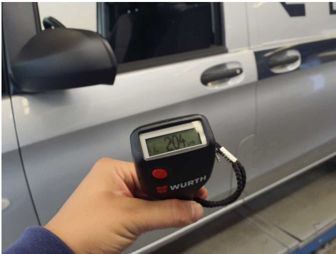
Repainting 1: Mudguard - left side, Door - front left side