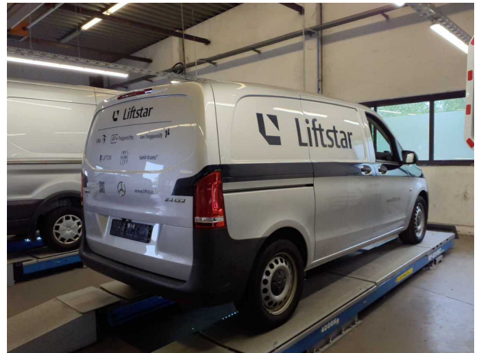
Damage 6: Body: Body - Glued / labelled - De-glue / neutralise