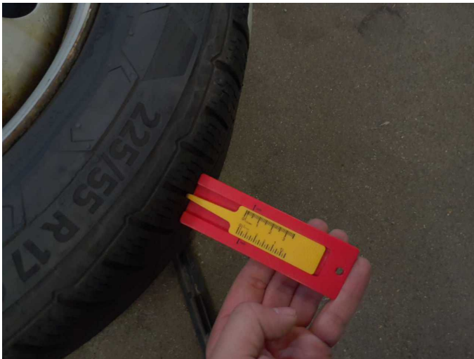
Damage 1: 2nd wheel set: Tyres - complete set - Does not meet the leasing specifications - No deduction