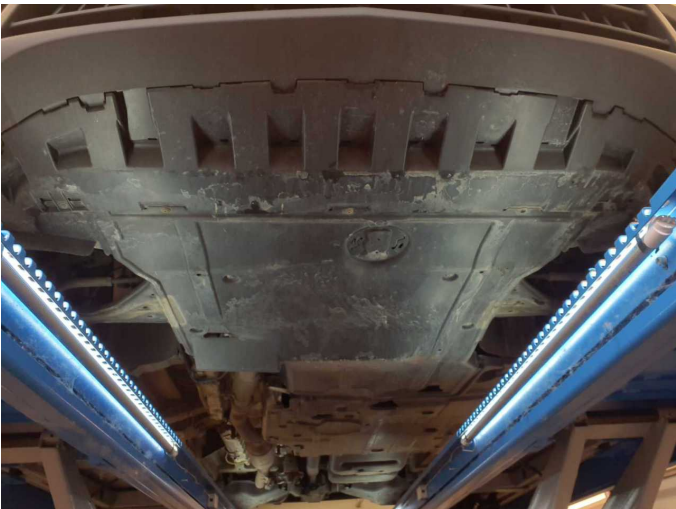
Figure 29: Misc.