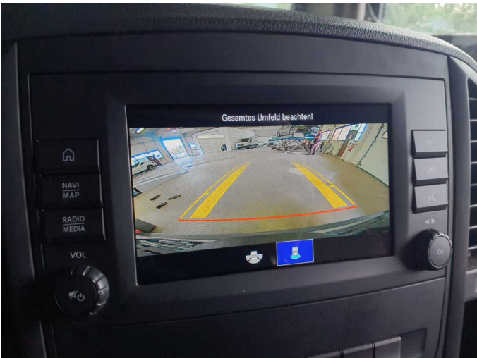
Figure 19: Misc.