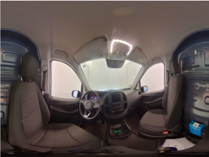
Figure 9: Interior 360° view