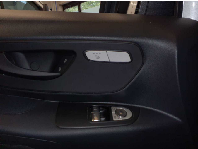
Figure 25: Misc.