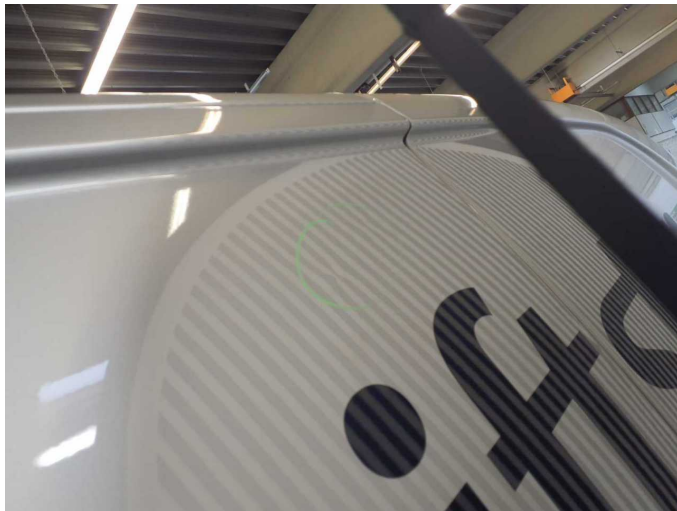
Damage 5: Sliding door - left side: Sliding door (Dellen+Beulen) - dent(s) - Smart repair