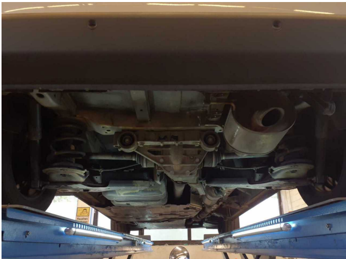
Figure 30: Misc.