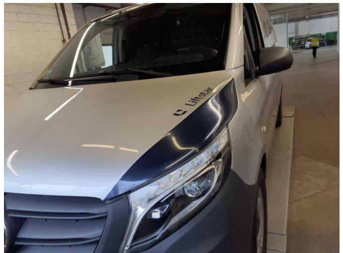
Damage 6: Body: Body - Glued / labelled - De-glue / neutralise