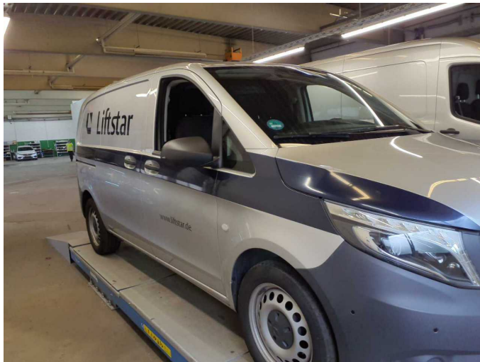
Damage 6: Body: Body - Glued / labelled - De-glue / neutralise