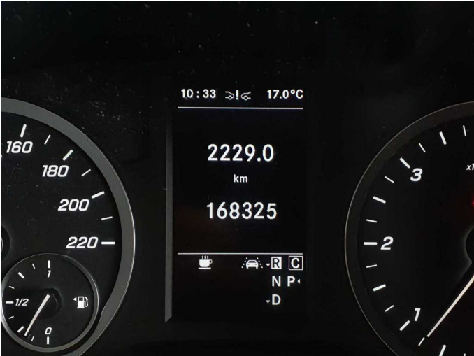
Figure 18: Misc.