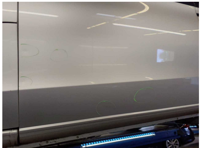
Damage 5: Sliding door - left side: Sliding door (Dellen+Beulen) - dent(s) - Smart repair