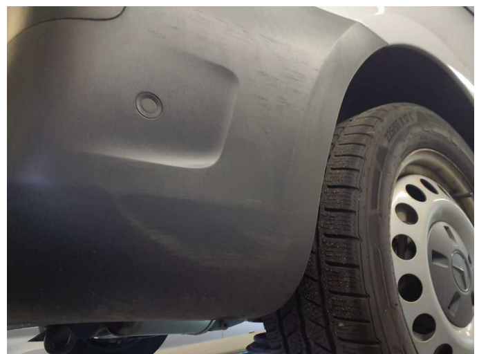
Damage 7: Rear bumper: Rear bumper - Scratched - Replace