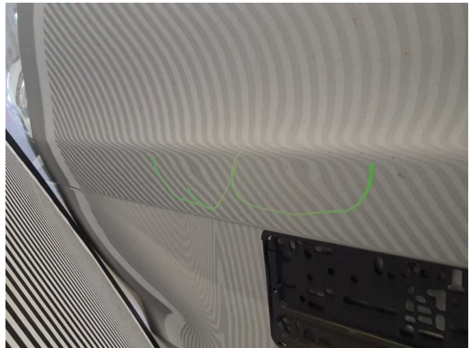
Damage 4: Boot lid / rear door: Boot lid - dent(s) - Smart repair