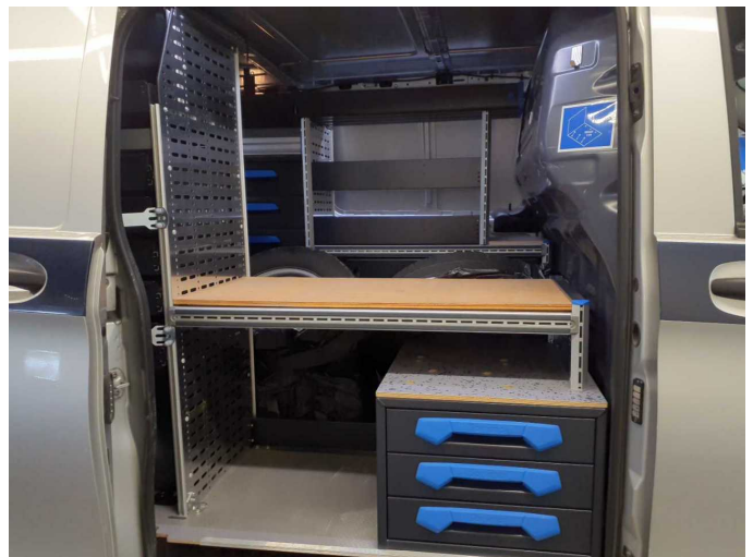
Figure 6: Interior - rear