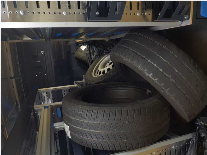
Figure 16: Additional tyres