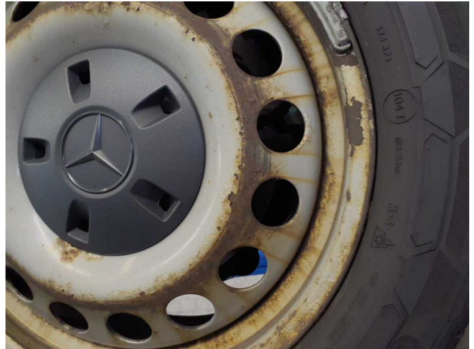
Wear and tear 2: Wheel / tyres: Wheel rim - rear left side - Corrosion - No deduction