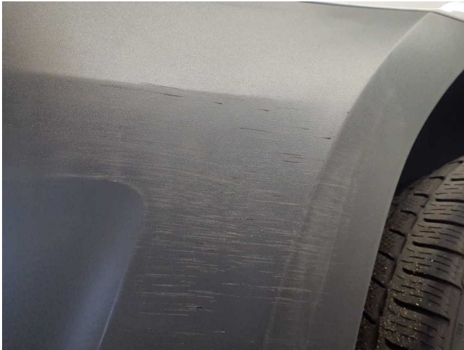
Damage 7: Rear bumper: Rear bumper - Scratched - Replace