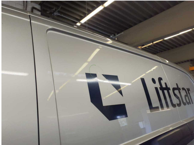
Damage 5: Sliding door - left side: Sliding door (Dellen+Beulen) - dent(s) - Smart repair