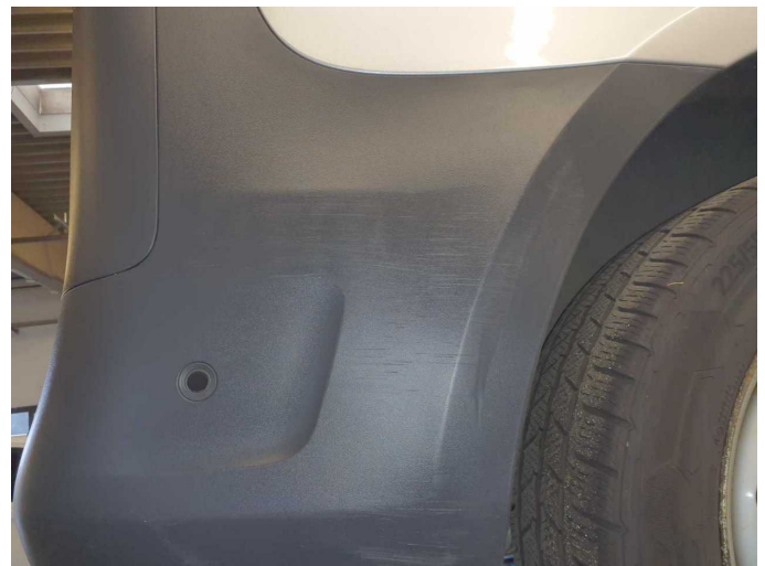
Damage 7: Rear bumper: Rear bumper - Scratched - Replace