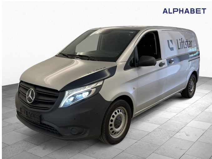
Figure 1: Diagonal front (left)