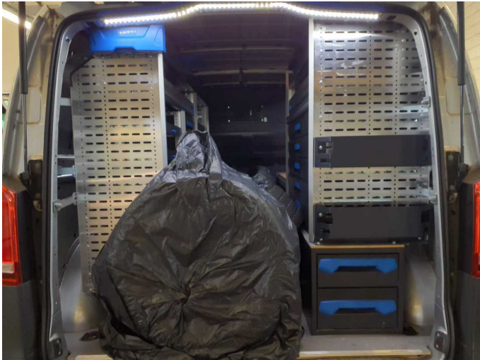
Figure 10: Cargo area