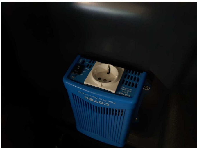
Figure 24: Misc.