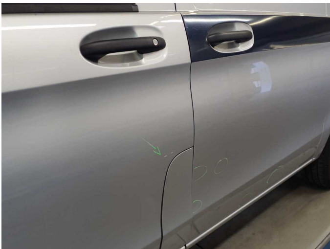
Damage 3: Door - front left side: Door - Scratch(es) - Smart repair