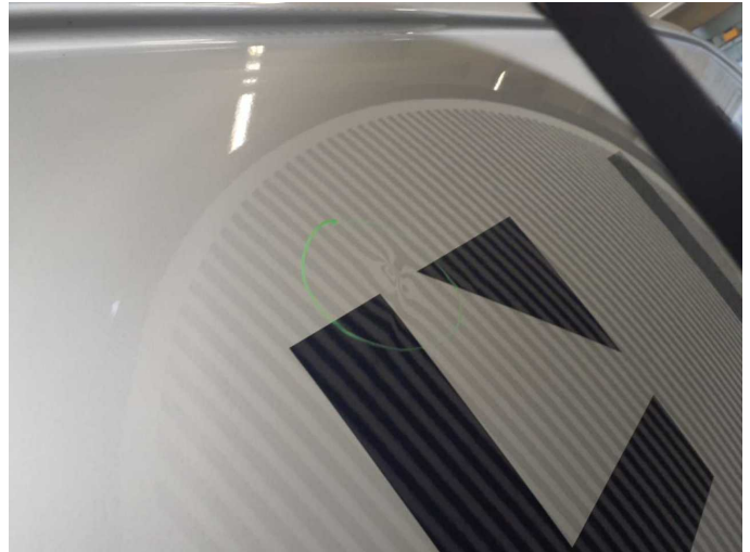
Damage 5: Sliding door - left side: Sliding door (Dellen+Beulen) - dent(s) - Smart repair