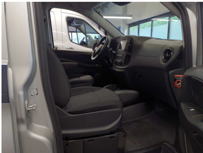
Figure 5: Interior - front