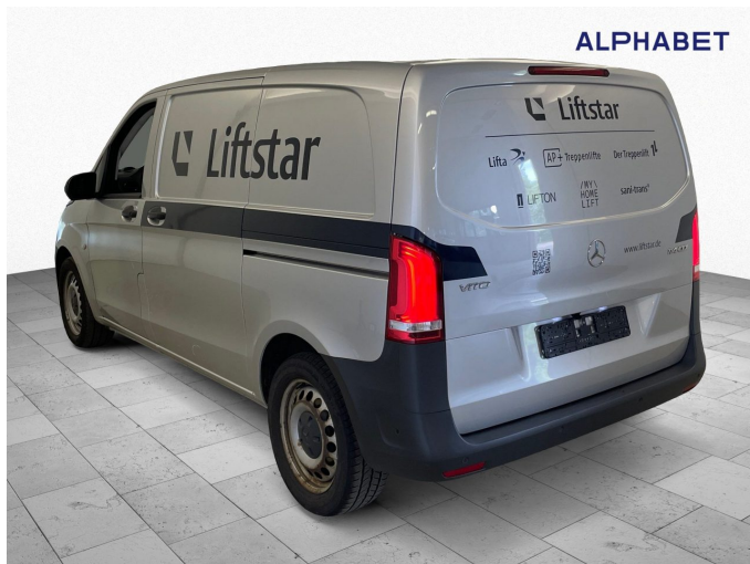
Figure 3: Diagonal rear (left)