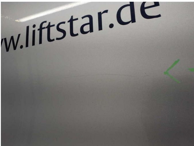
Damage 8: Door - front right side: Door (Dellen+Kratzer) - Dent / paintcoat damage - Repair and paint