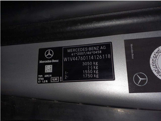
Figure 11: VIN