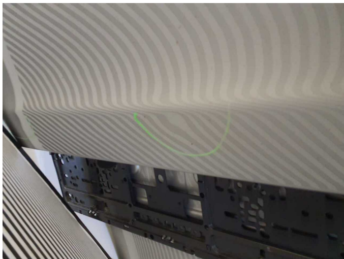
Damage 4: Boot lid / rear door: Boot lid - dent(s) - Smart repair