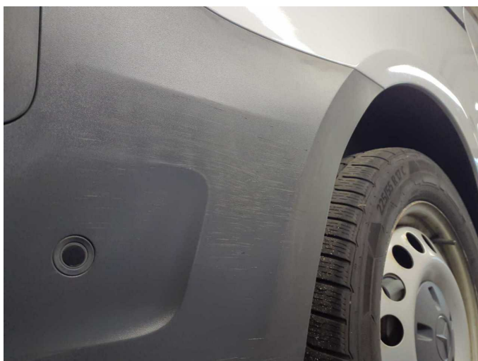
Damage 7: Rear bumper: Rear bumper - Scratched - Replace