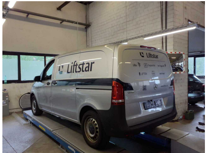
Damage 6: Body: Body - Glued / labelled - De-glue / neutralise