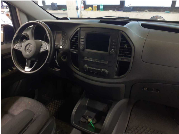
Figure 8: Instrument panel