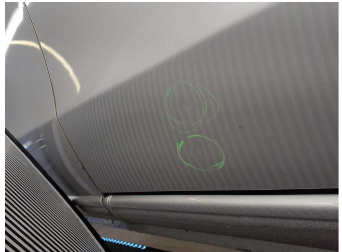
Damage 8: Door - front right side: Door (Dellen+Kratzer) - Dent / paintcoat damage - Repair and paint