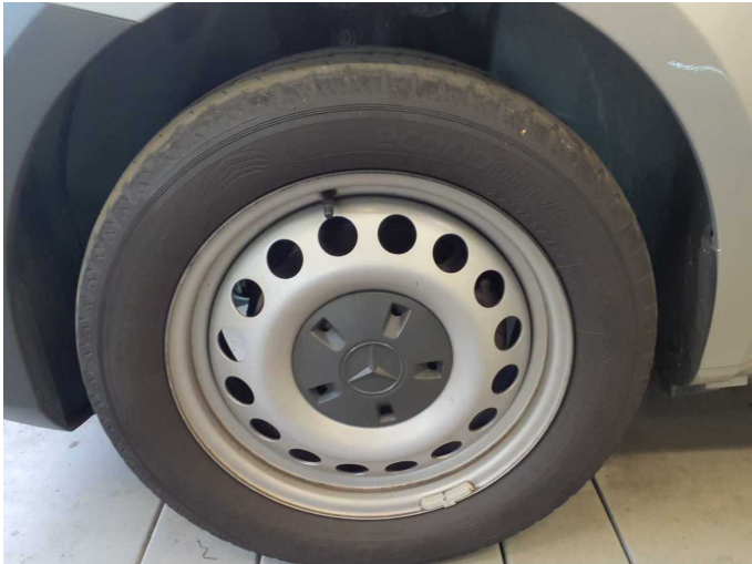
Figure 12: Mounted tyres