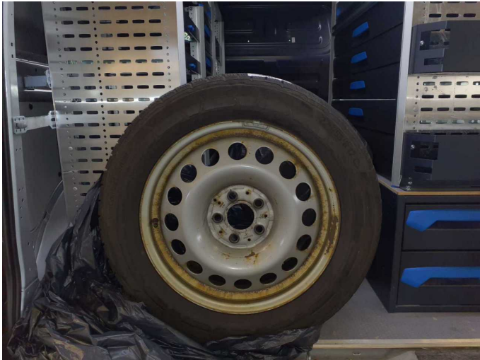
Figure 26: Misc.