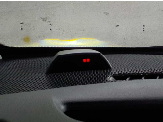
Figure 20: Misc.