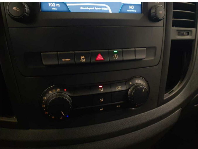
Figure 23: Misc.