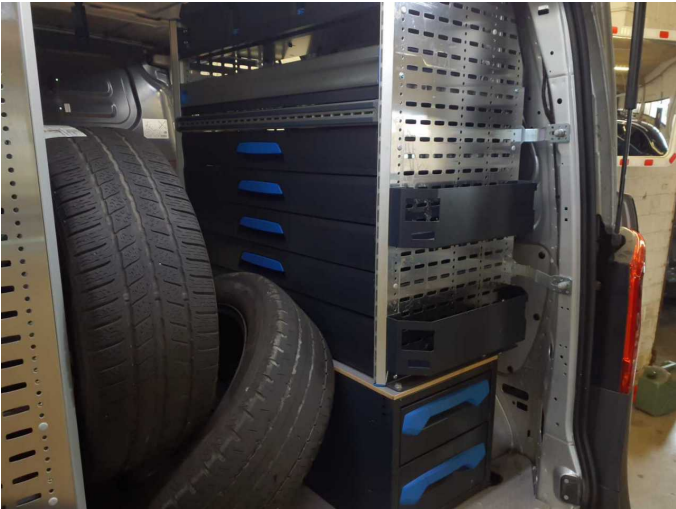
Figure 27: Misc.