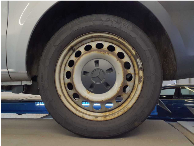
Wear and tear 2: Wheel / tyres: Wheel rim - rear left side - Corrosion - No deduction