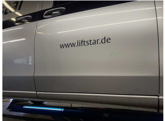
Damage 8: Door - front right side: Door (Dellen+Kratzer) - Dent / paintcoat damage - Repair and paint