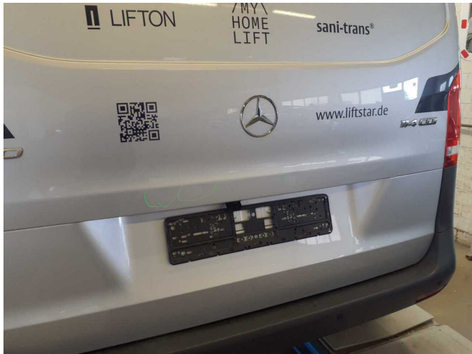
Damage 4: Boot lid / rear door: Boot lid - dent(s) - Smart repair