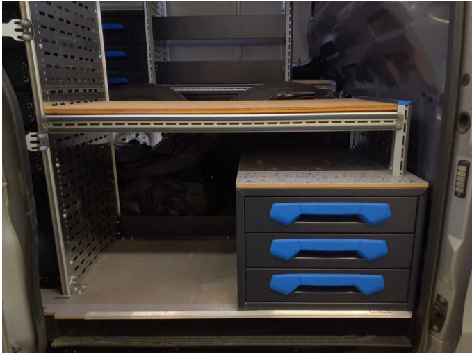
Figure 28: Misc.