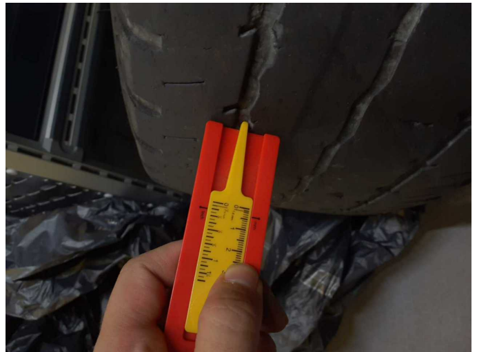
Damage 1: 2nd wheel set: Tyres - complete set - Does not meet the leasing specifications - No deduction