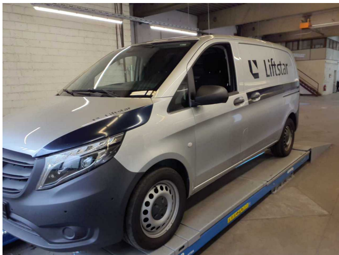
Damage 6: Body: Body - Glued / labelled - De-glue / neutralise