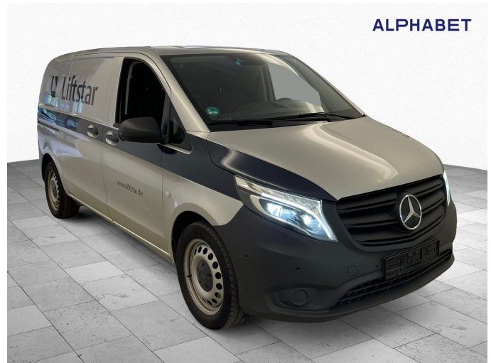
Figure 2: Diagonal front (right)