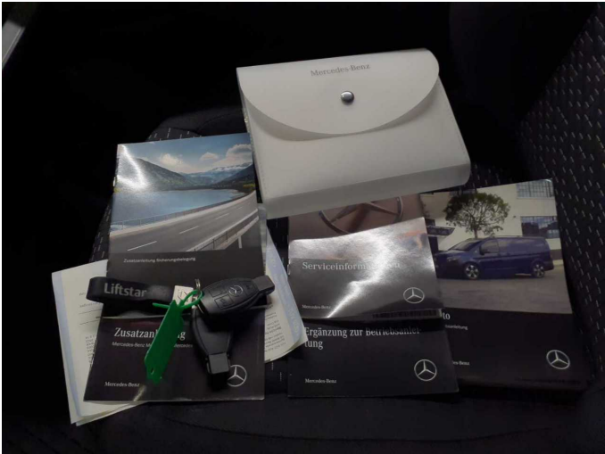
Figure 14: Documents