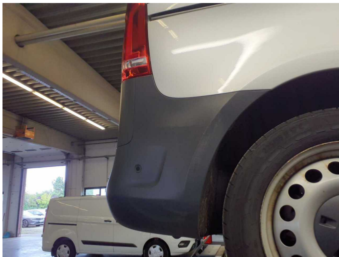
Damage 7: Rear bumper: Rear bumper - Scratched - Replace