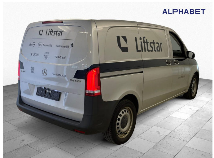
Figure 4: Diagonal rear (right)