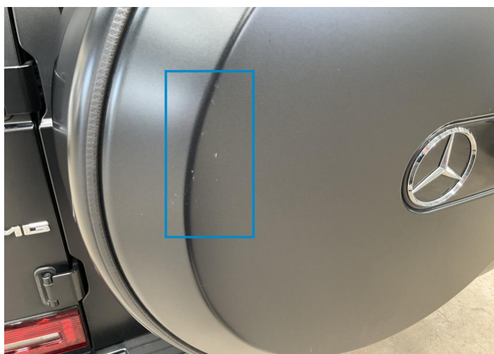
3. Wheel cover Paint / Scratch / Scuff -