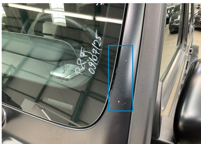
5. Deflector / Front Left Paint / Stone Chip -