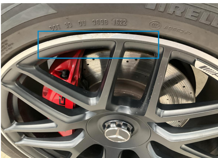
2. Rim / Front Right Out of Bodywork / Scratch -