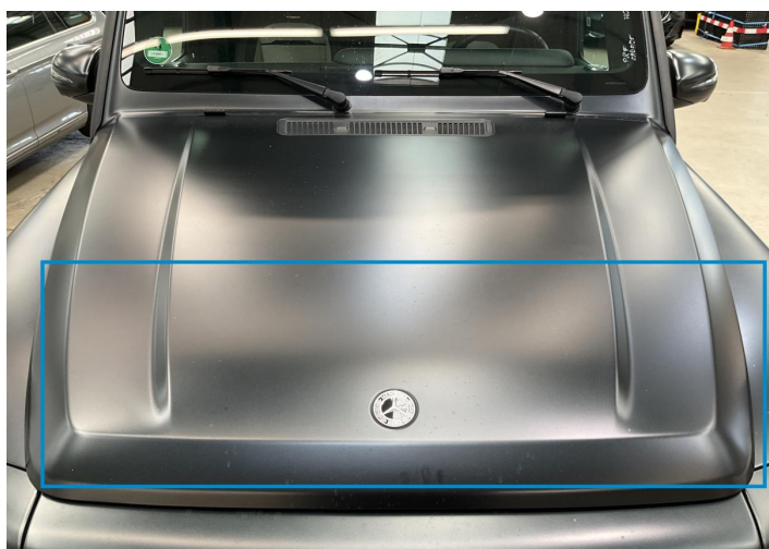
1. Hood Paint / Stone Chip -