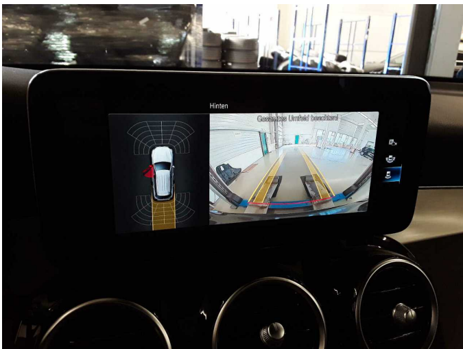
Figure 23: Misc.