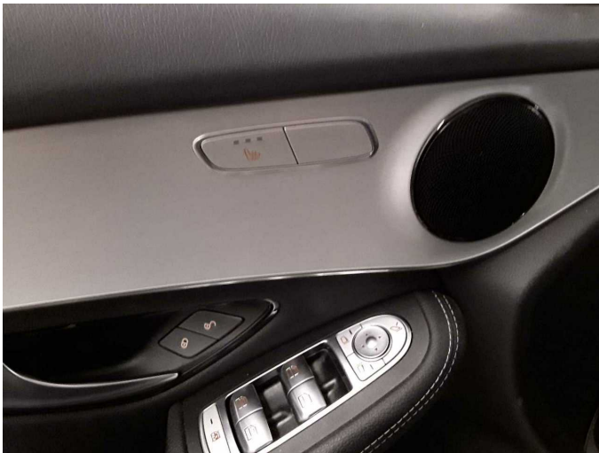
Figure 21: Misc.