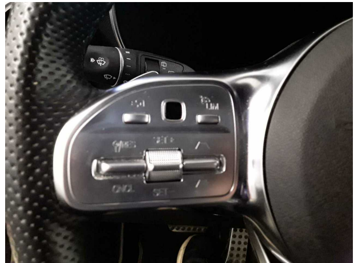
Figure 22: Misc.