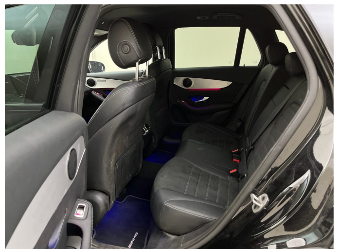
Figure 6: Interior - rear