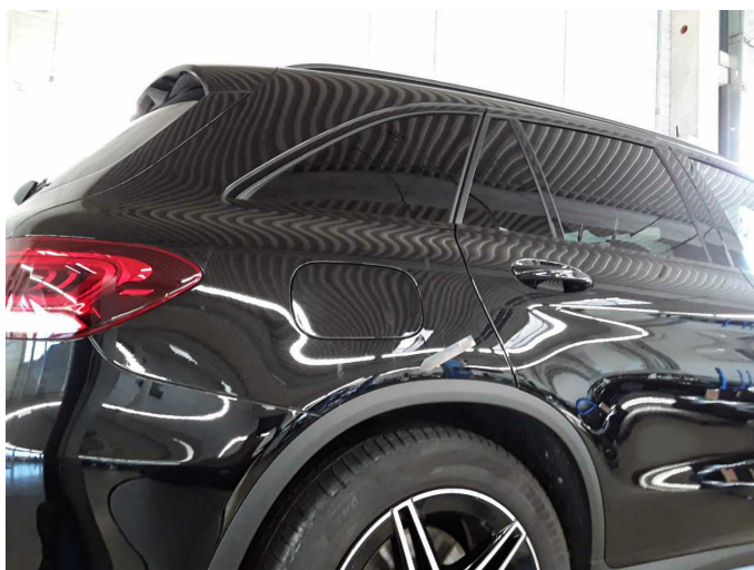
Damage 3: Side panel - rear right side: Side panel - dent(s) - Smart repair