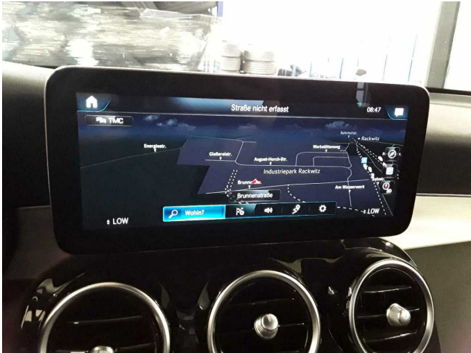
Figure 18: Navigation