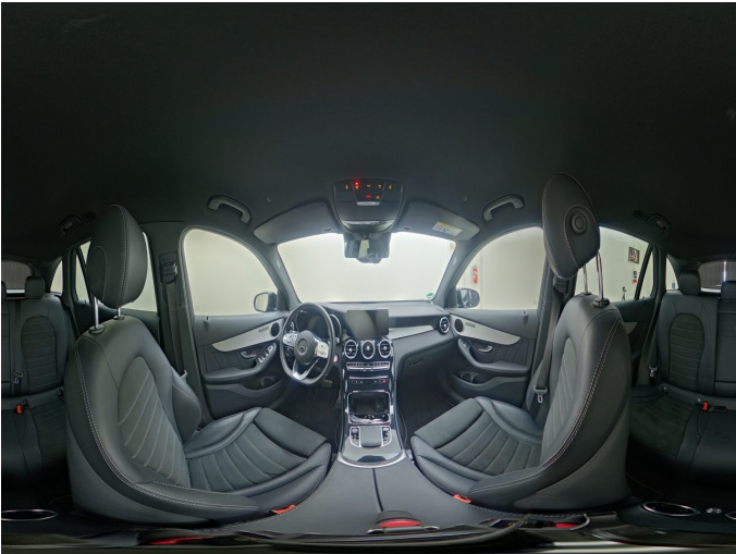
Figure 9: interior 360° view