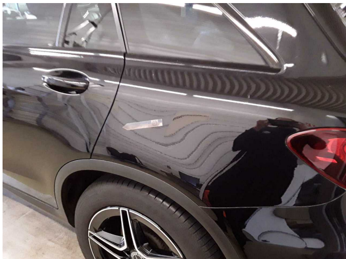
Damage 1: Side panel - rear left side: Side panel - Scratch(es) - Smart repair