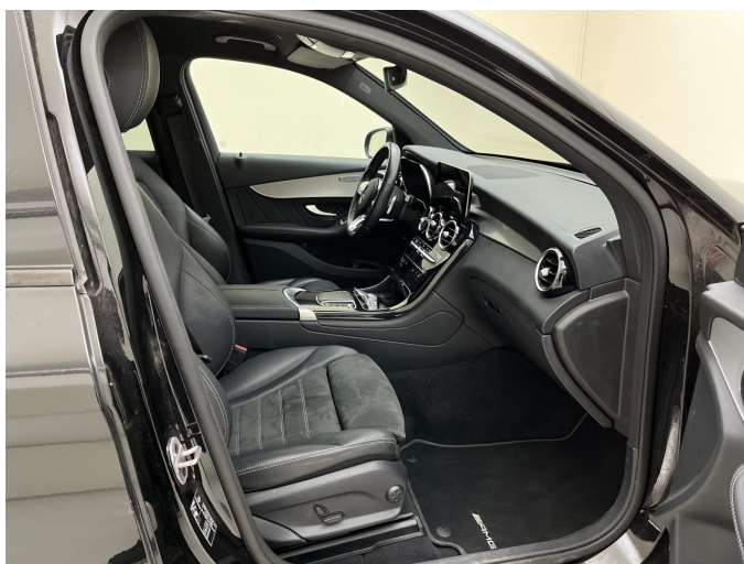
Figure 5: Interior - front