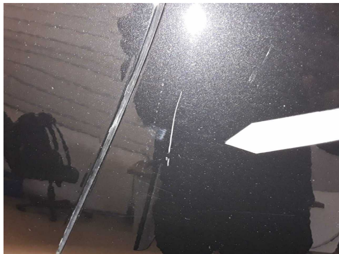
Damage 1: Side panel - rear left side: Side panel - Scratch(es) - Smart repair