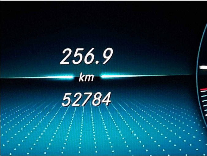
Figure 15: Documents