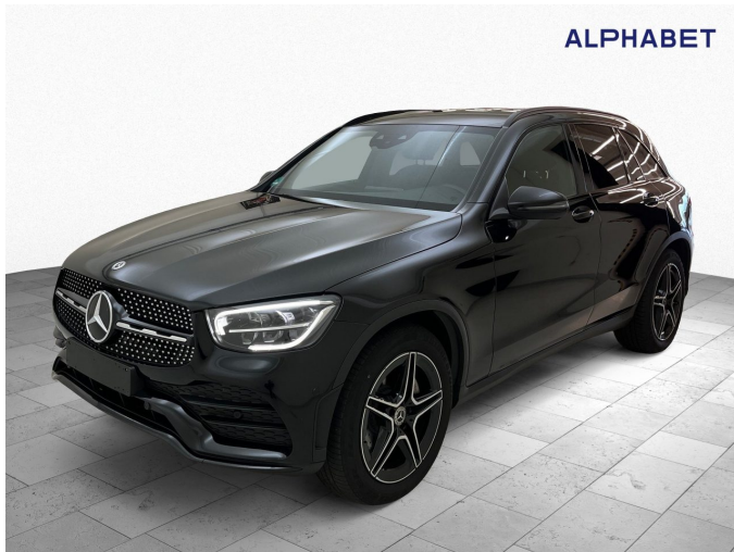
Figure 1: Diagonal front (left)