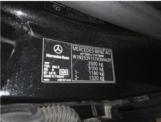
Figure 11: VIN