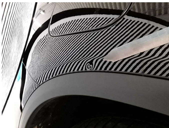
Damage 3: Side panel - rear right side: Side panel - dent(s) - Smart repair