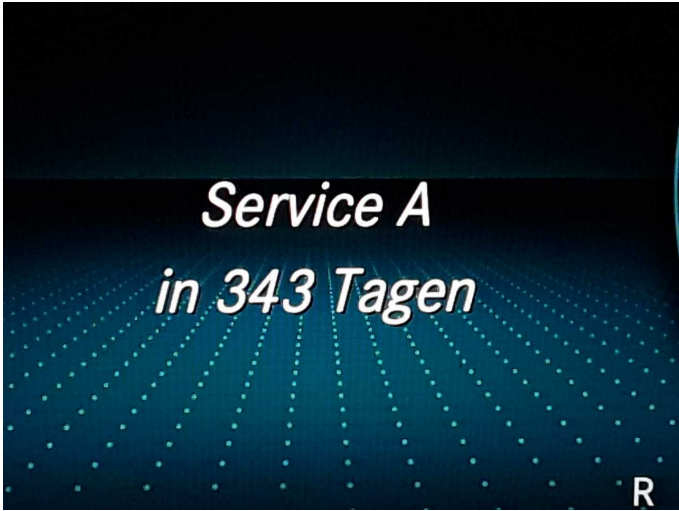
Figure 16: Documents