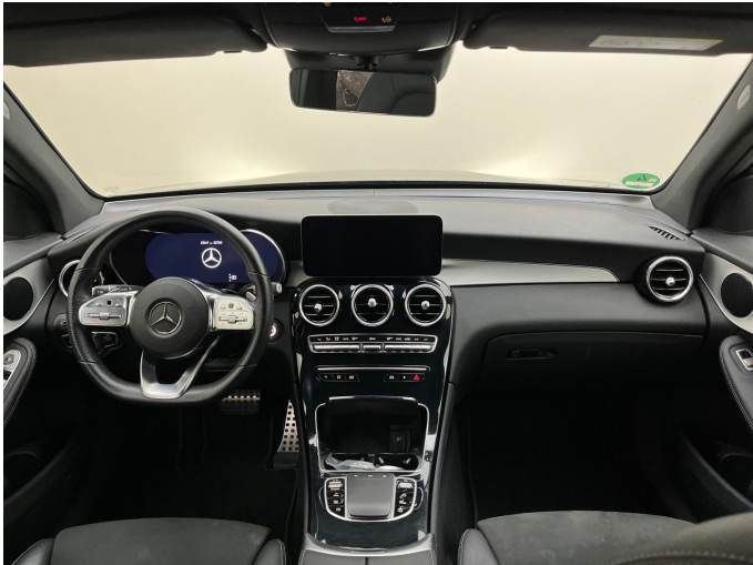
Figure 8: Instrument panel