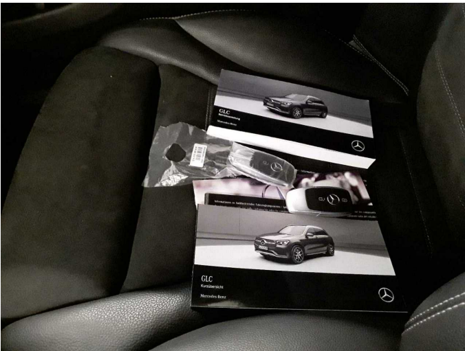
Figure 13: Documents