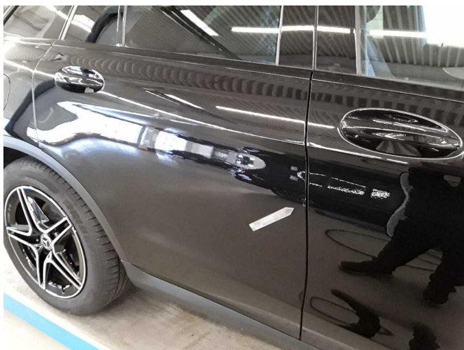
Damage 2: Door - rear right side: Door - Scratch(es) - Smart repair