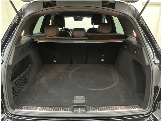
Figure 10: Cargo area