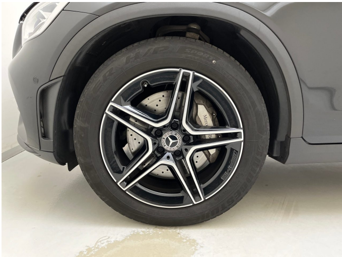
Figure 12: Mounted tyres