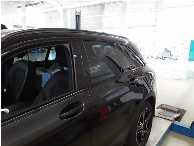
Figure 19: Misc.