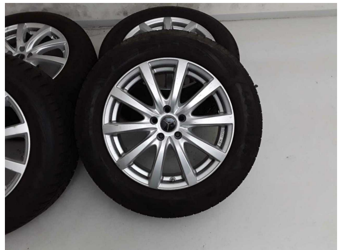
Figure 24: Misc.