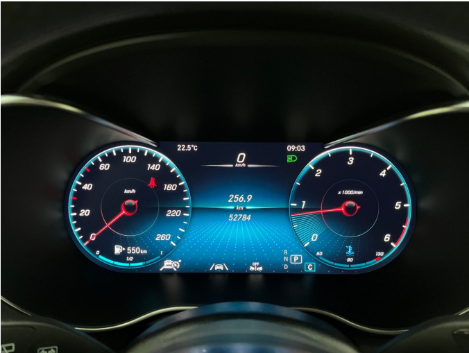
Figure 7: Instrument cluster