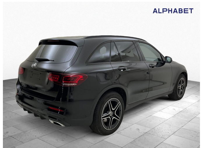
Figure 4: Diagonal rear (right)