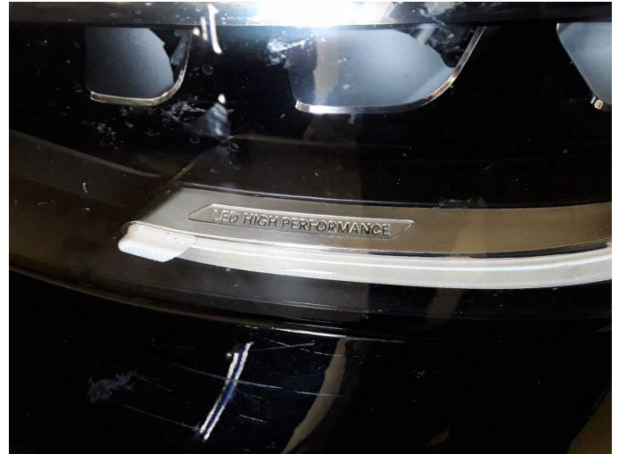
Figure 20: Misc.