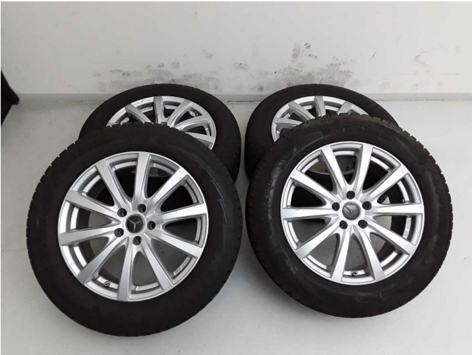
Figure 17: Additional tyres