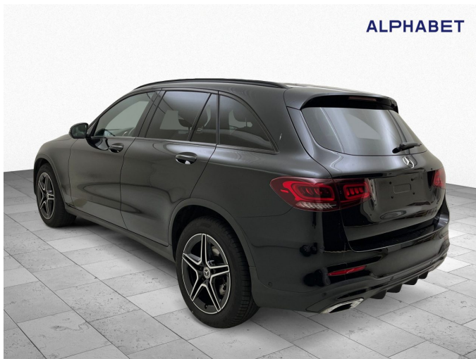
Figure 3: Diagonal rear (left)