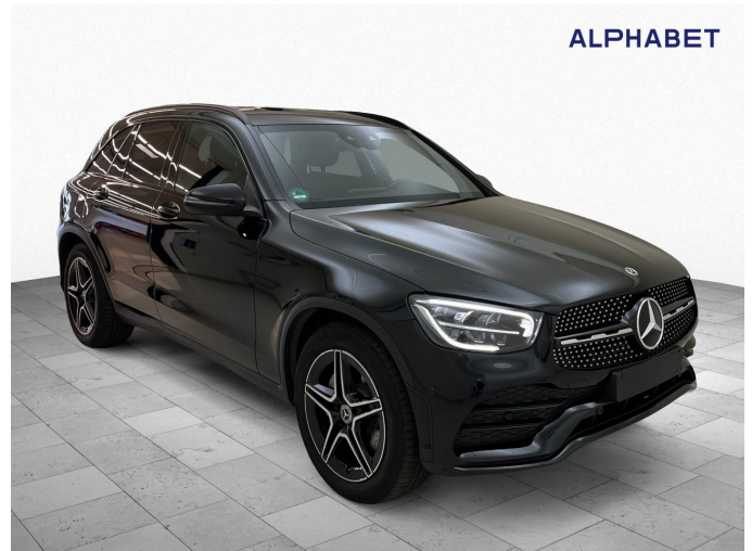
Figure 2: Diagonal front (right)