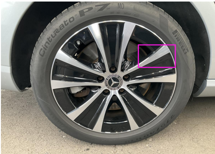
1. Rim / Back Right Out of Bodywork / Scratch -