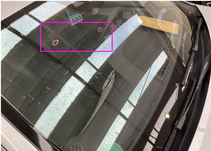
4. Windshield / Front Paint / Chipping -