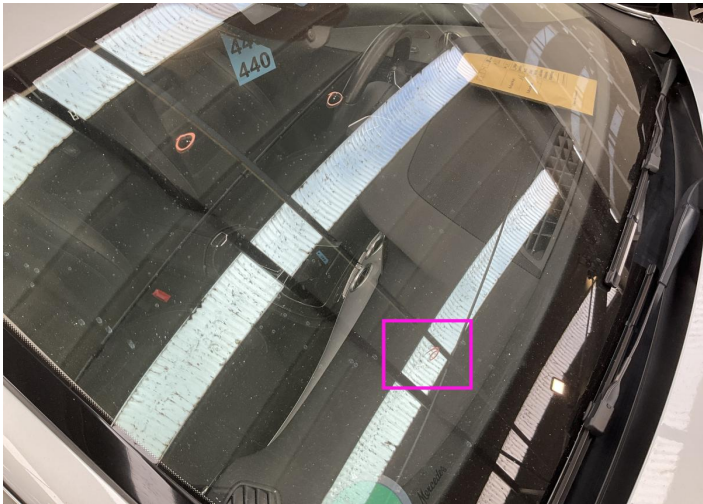
3. Windshield / Front Paint / Chipping -