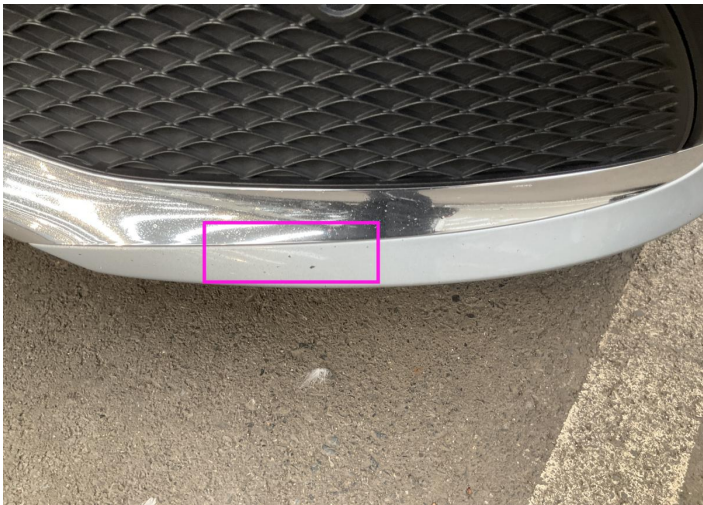
5. Bumper / Front Paint / Chipping -