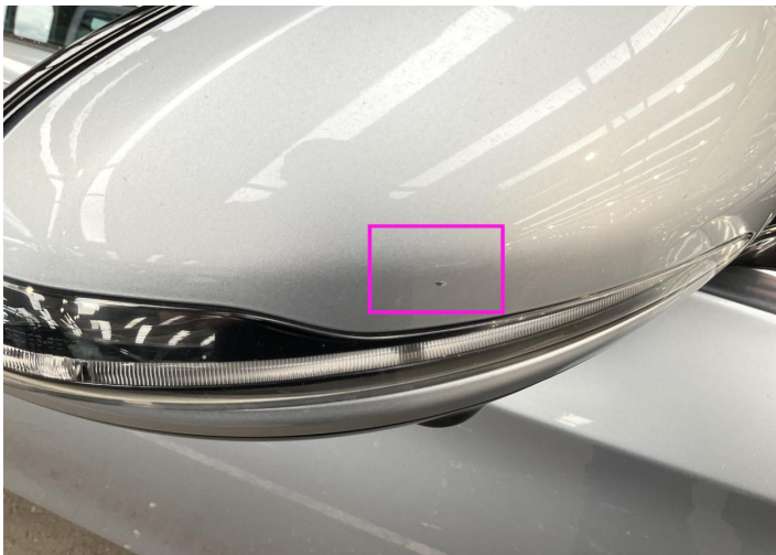
2. Mirror Repeater / Right Glass Break -