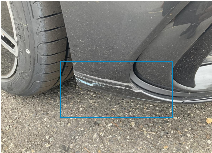
1. Corner Bumper / Front Right Paint / Scratch / Scuff -