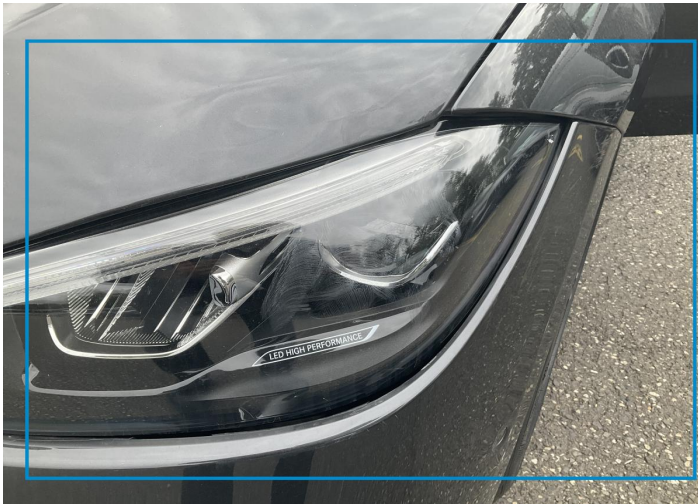
3. Corner Bumper / Front Left Bodywork / Assembly -