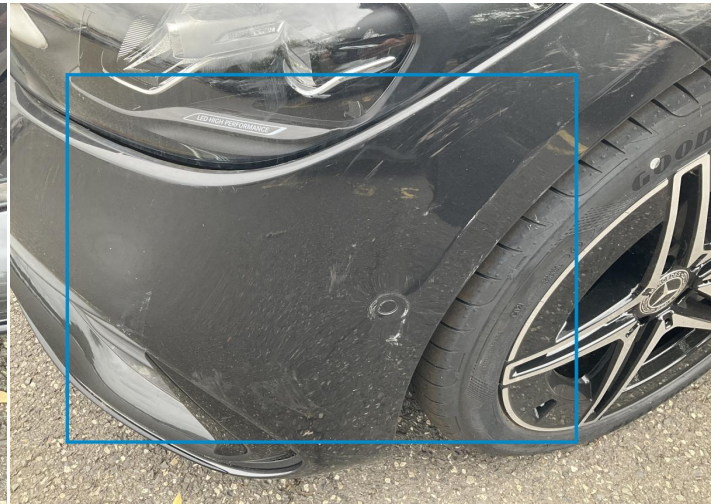
2. Corner Bumper / Front Left Paint / Scratch / Scuff -