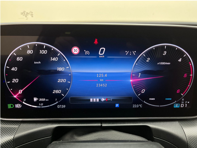
Figure 7: Instrument cluster