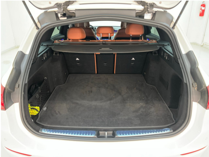
Figure 10: Cargo area