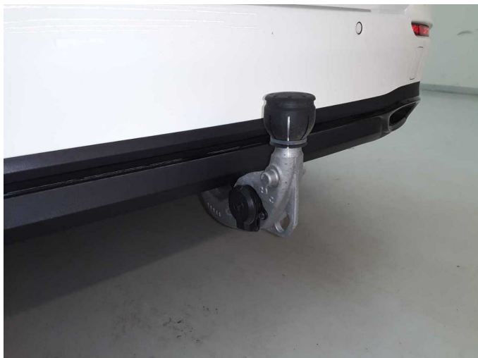
Figure 19: Misc.