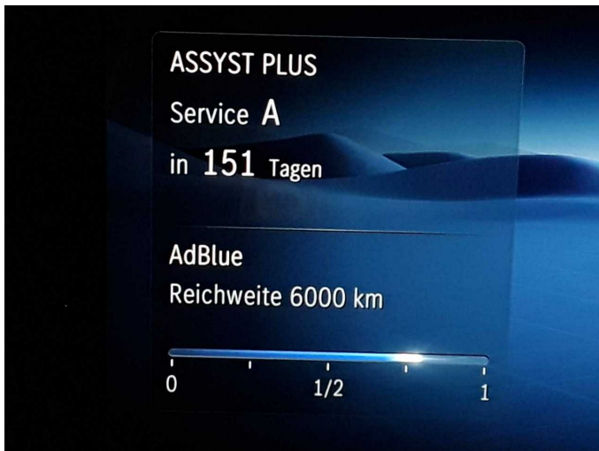
Figure 15: Documents