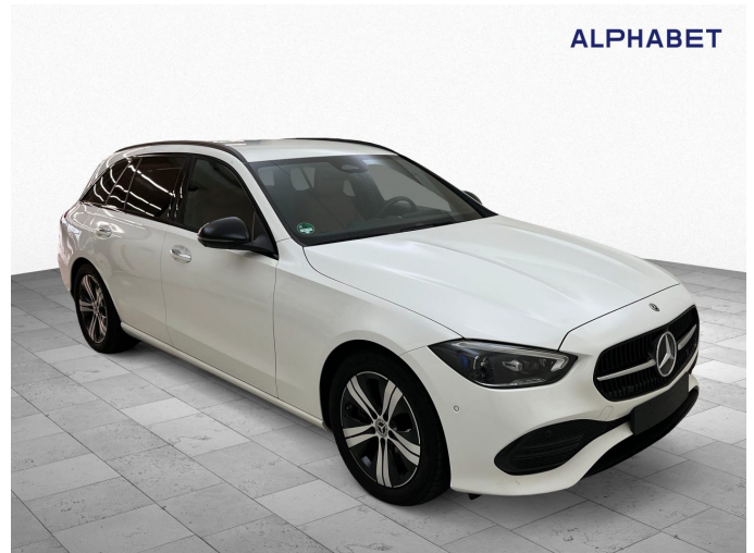
Figure 2: Diagonal front (right)