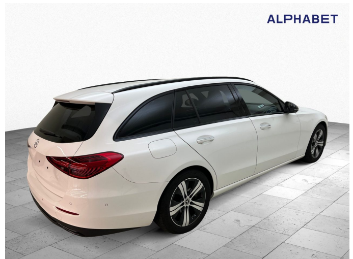
Figure 4: Diagonal rear (right)