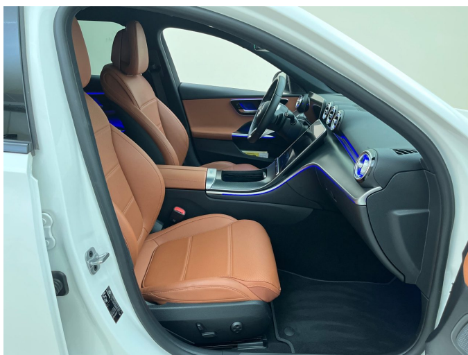
Figure 5: Interior - front