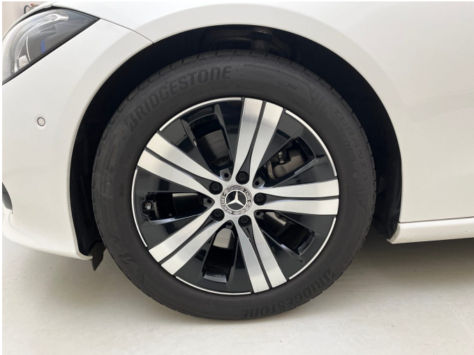
Figure 12: Mounted tyres