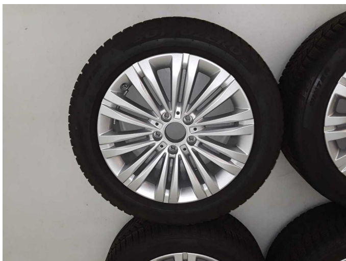
Figure 21: Misc.