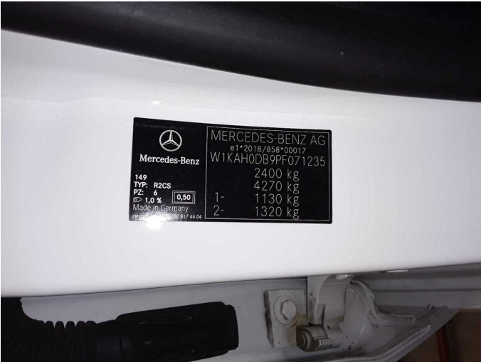
Figure 11: VIN