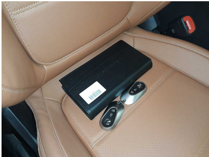
Figure 13: Documents