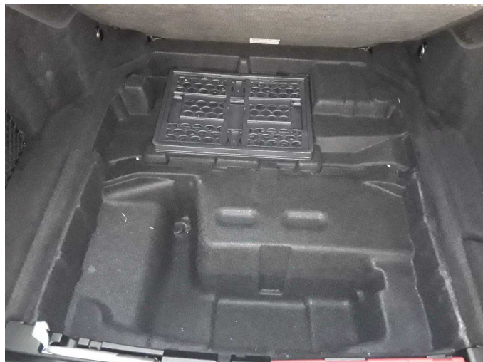
Figure 20: Misc.