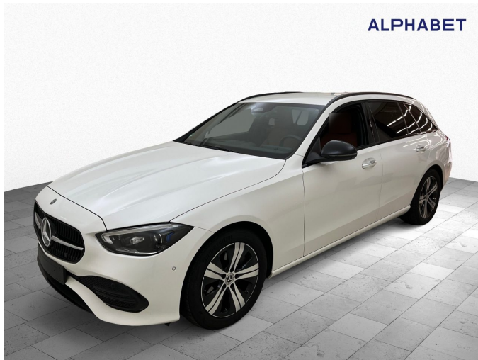
Figure 1: Diagonal front (left)