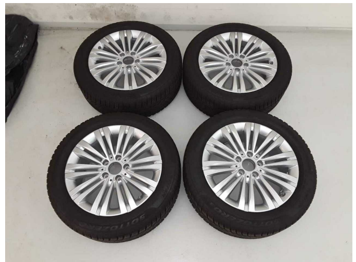
Figure 16: Additional tyres