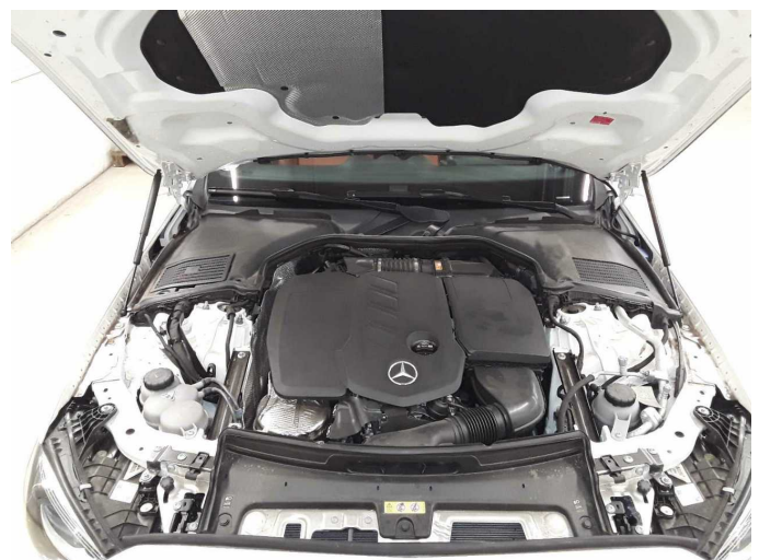
Figure 18: Misc.