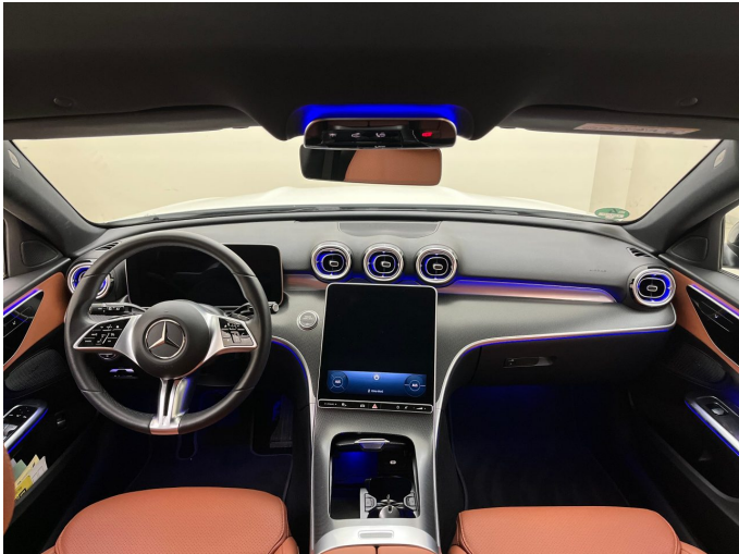
Figure 8: Instrument panel