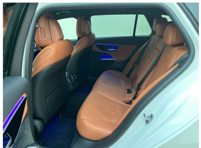
Figure 6: Interior - rear