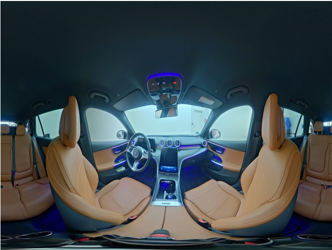
Figure 9: interior 360° view