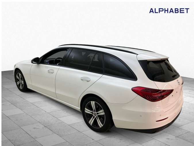
Figure 3: Diagonal rear (left)