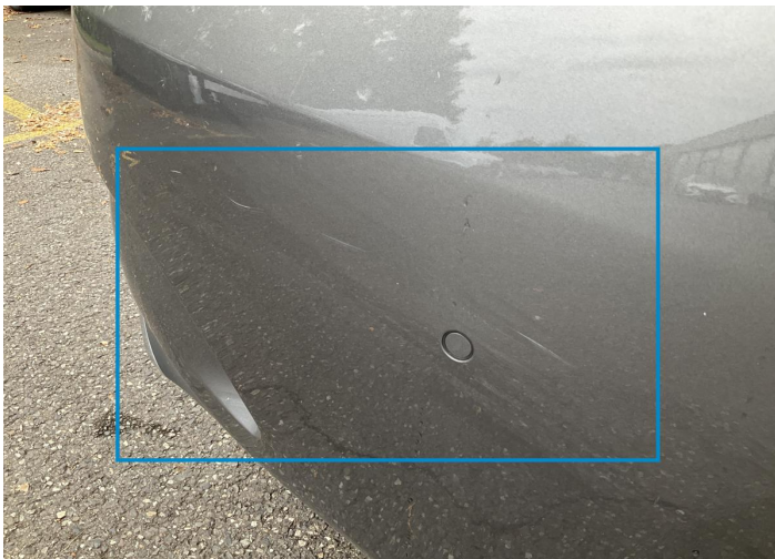
3. Corner Bumper / Back Right Paint / Scratch / Scuff -