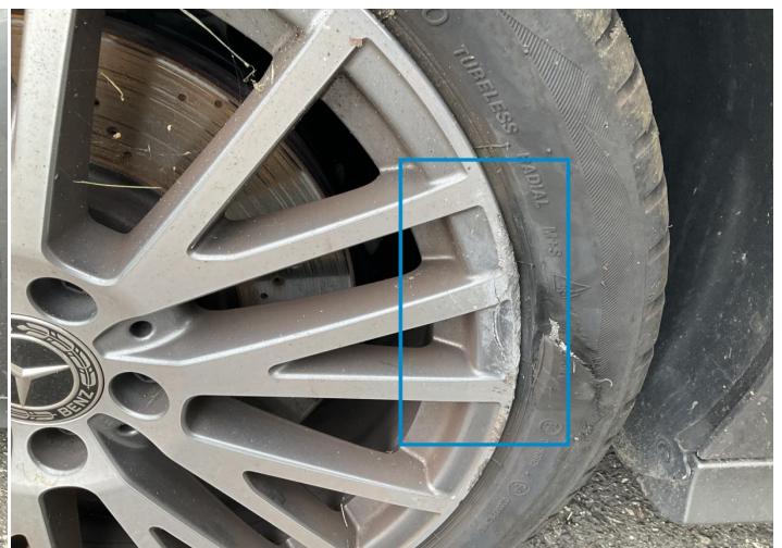
6. Rim / Front Left Out of Bodywork / Scratch -