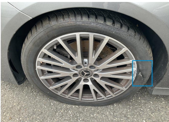
5. Tire / Front Left Tire -