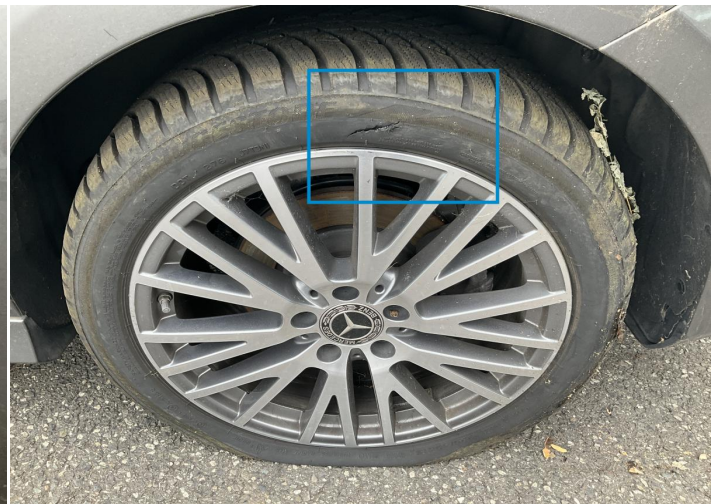
4. Tire / Back Left Tire -