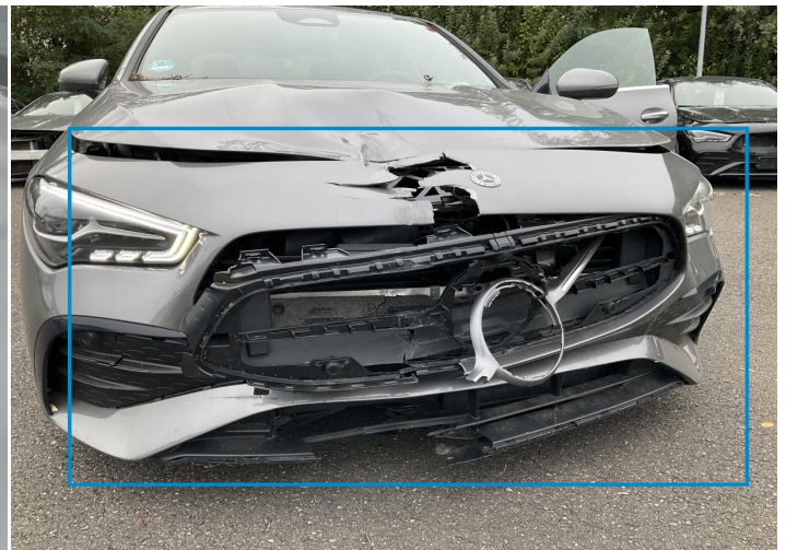
2. Bumper / Front Bodywork / Breakage -