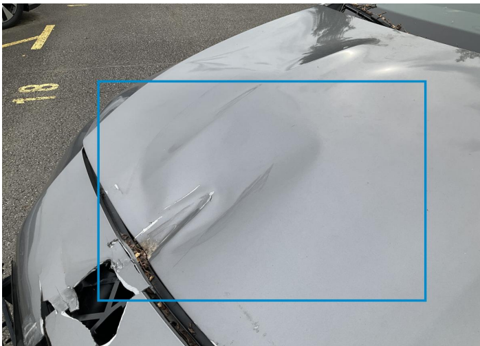
1. Hood Bodywork / Breakage -