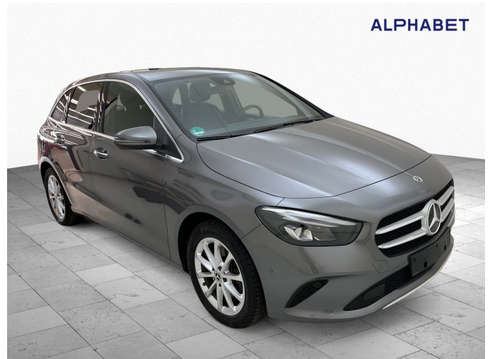
Figure 2: Diagonal front (right)