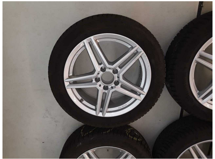
Figure 16: Additional tyres