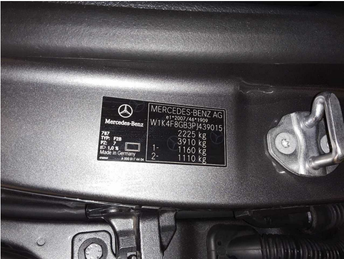
Figure 11: VIN