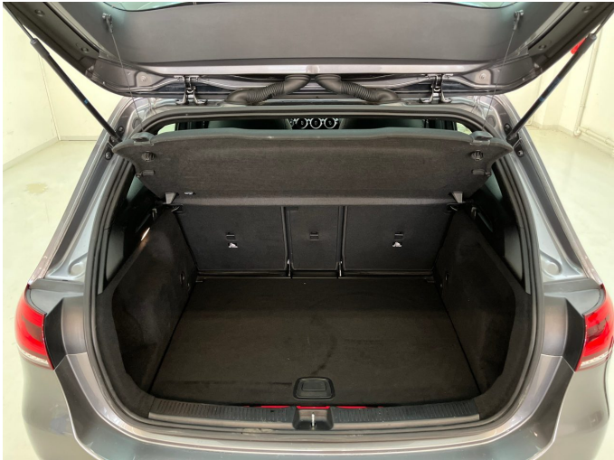
Figure 10: Cargo area