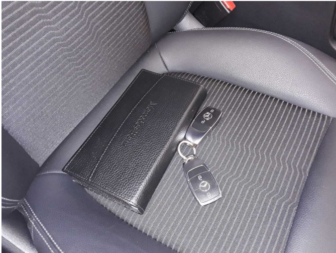
Figure 13: Documents