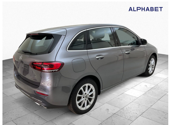
Figure 4: Diagonal rear (right)