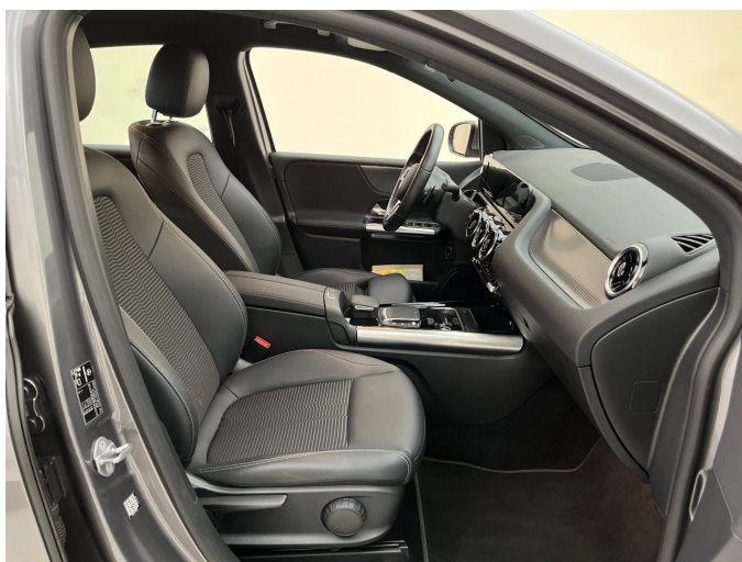
Figure 5: Interior - front