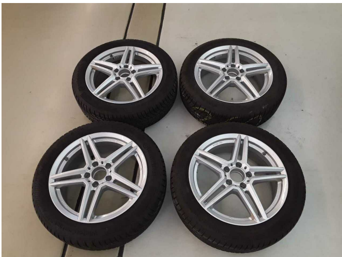
Figure 17: Additional tyres