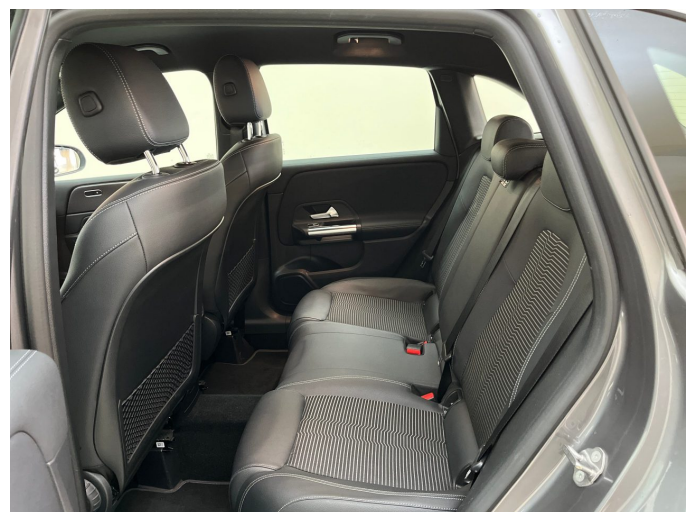
Figure 6: Interior - rear