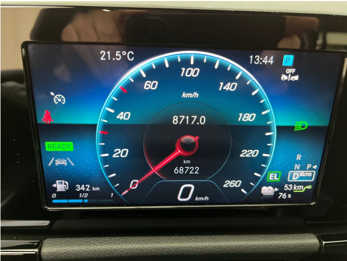
Figure 7: Instrument cluster