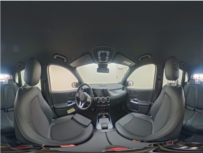
Figure 9: interior 360° view