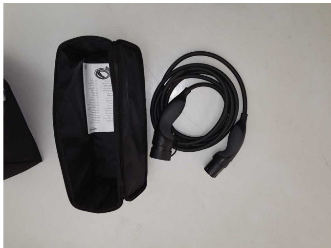
Figure 20: Misc.