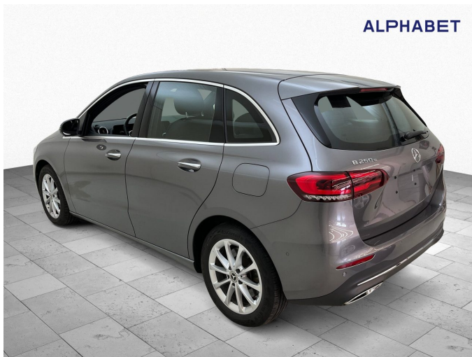
Figure 3: Diagonal rear (left)