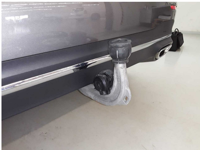
Figure 19: Misc.