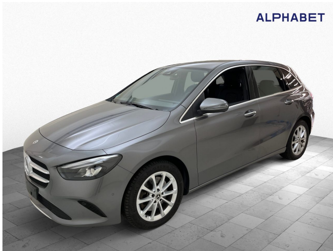
Figure 1: Diagonal front (left)