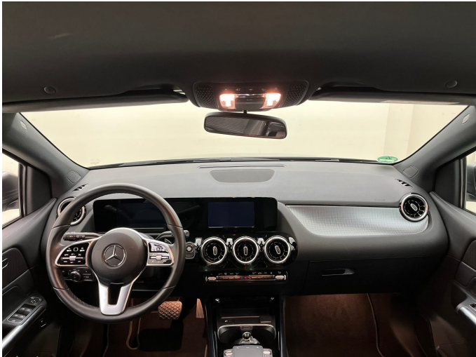
Figure 8: Instrument panel