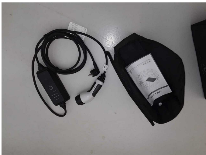
Figure 21: Misc.