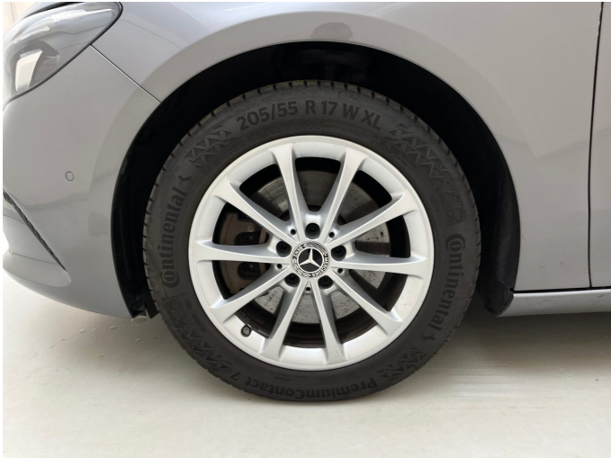
Figure 12: Mounted tyres