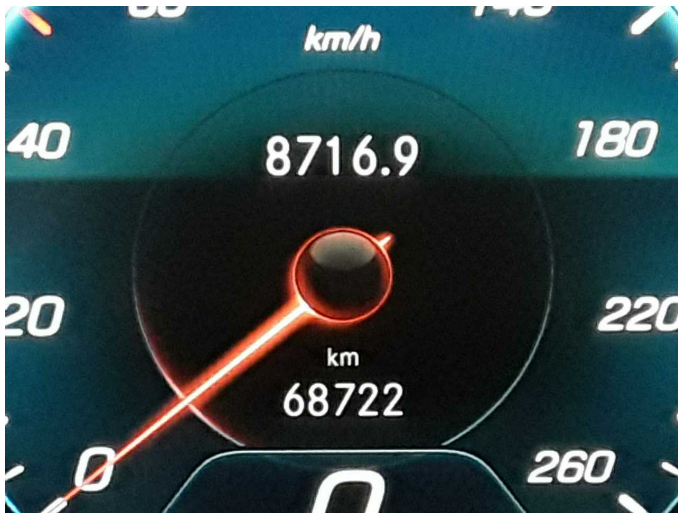
Figure 15: Documents