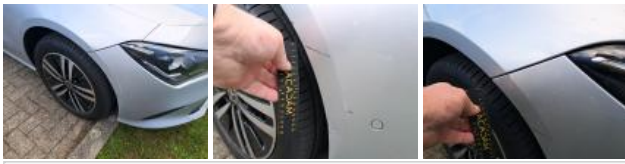
Door RL, Scratch(es), Acceptable