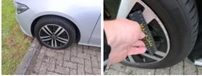
Alloy rim RL polished, Scratch(es), Acceptable