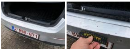
Bumper R, Scratch(es), Spot repair