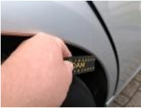
Wing FR, Scratch(es), Repair and paint (complete)