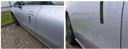
Central pillar L, Dent(s) and scratch(es), Spot repair