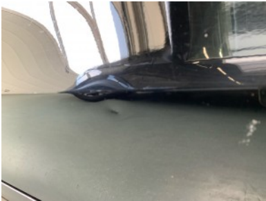
Rear left door - Restyle dent