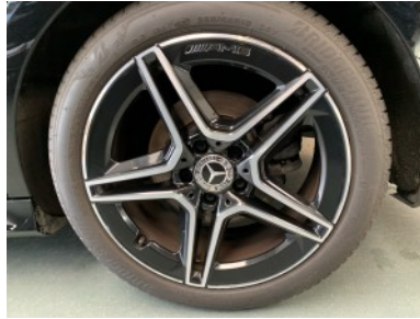
Rear left rim - Scratch