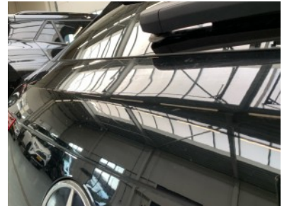
Tailgate/ lid - Restyle dent