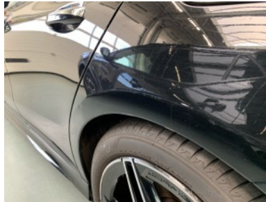
Rear left screen - Scratch