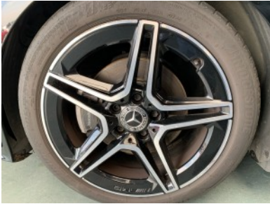
Front left rim - Scratch