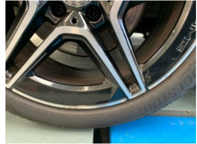
Rear right rim - Scratch