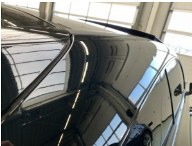
Right C- column - Restyle dent