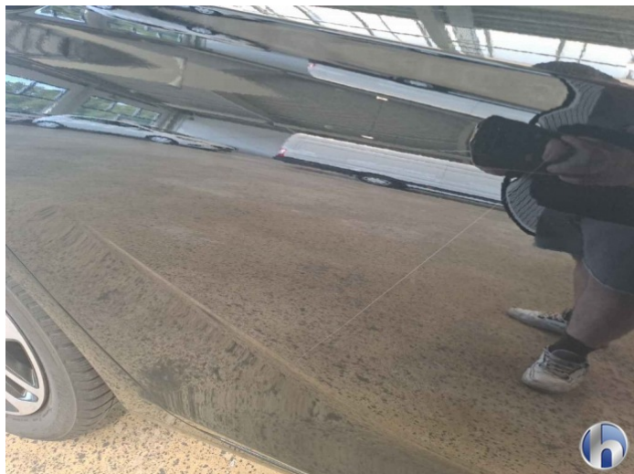
6. Door Rear - right