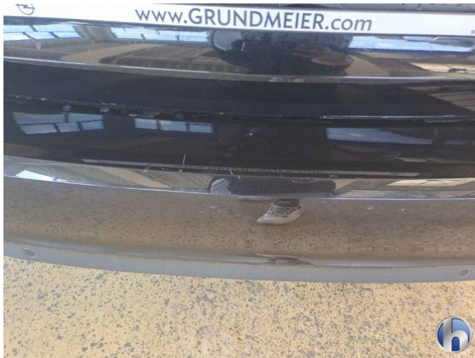
7. Rear bumper