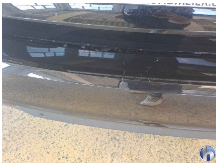
7. Rear bumper