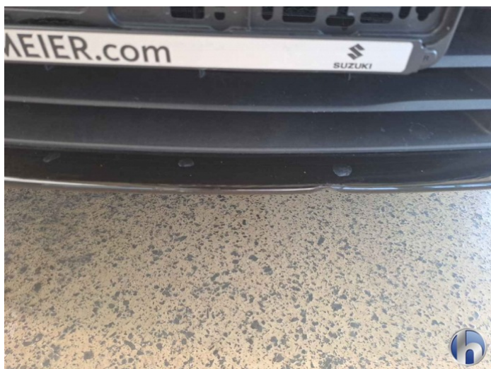
5. Front bumper