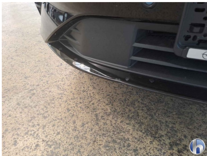
5. Front bumper