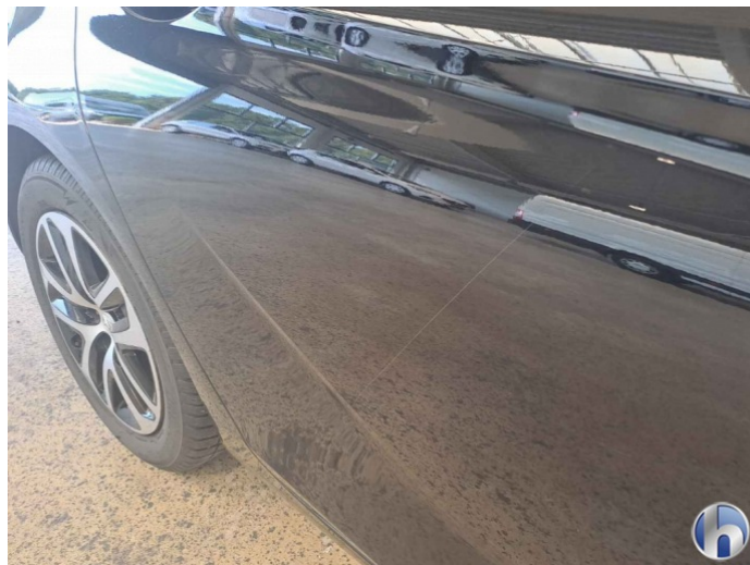
6. Door Rear - right