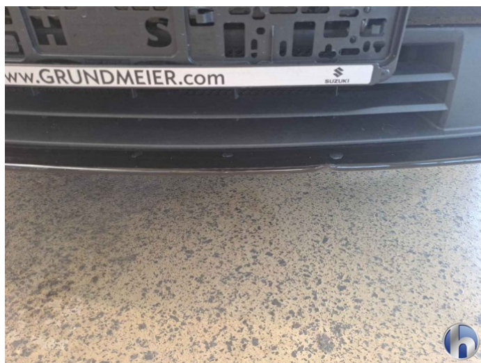
5. Front bumper