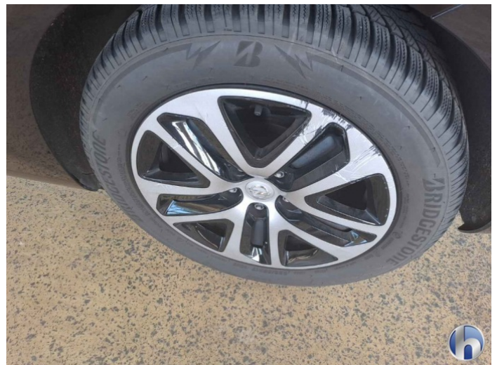
2. Hubcap - Rear - Left