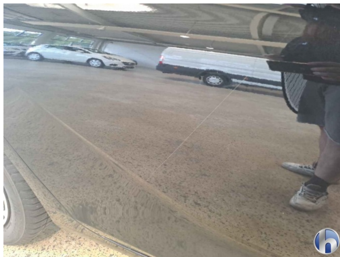
6. Door Rear - right