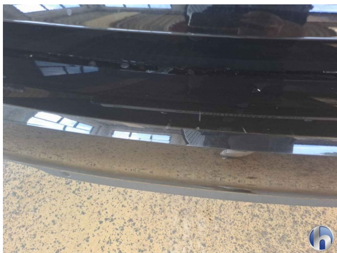
7. Rear bumper