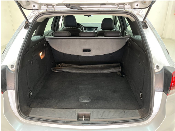
Figure 10: Cargo area