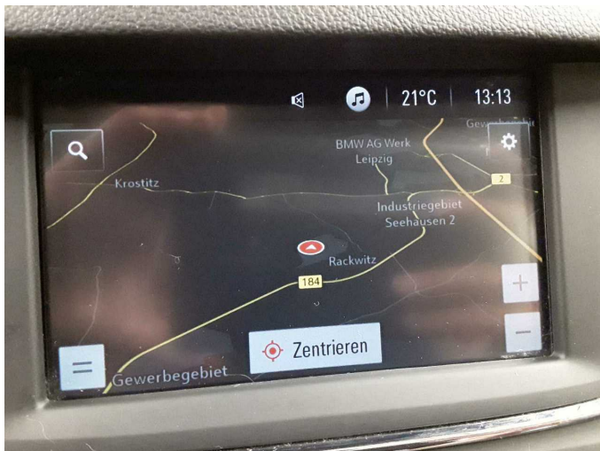
Figure 17: Navigation