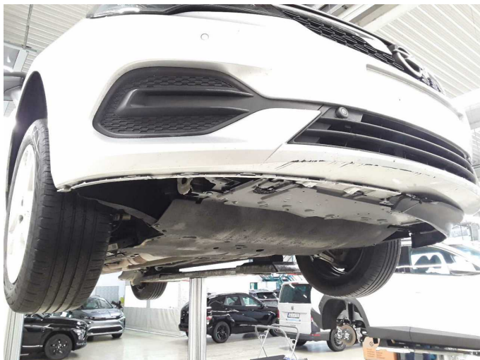
Damage 6: Front bumper: Spoiler (Gumminlippe rechts und links fehlt !) - Broken / torn - Replace