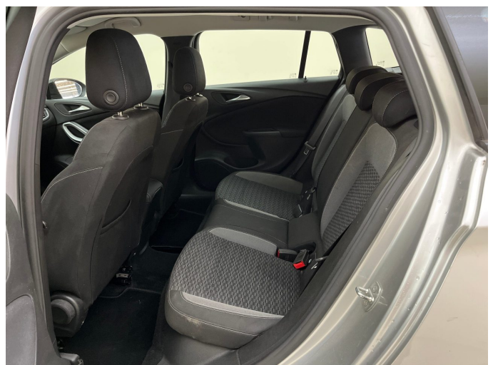
Figure 6: Interior - rear