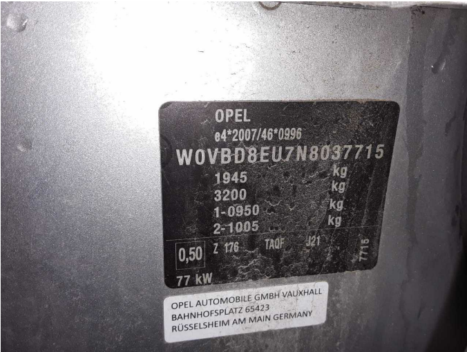
Figure 11: VIN