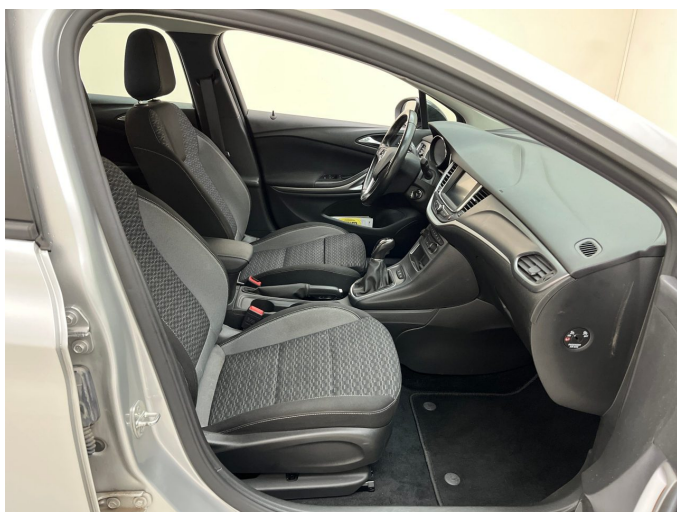
Figure 5: Interior - front