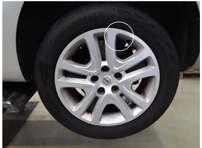
Damage 3: Wheel / tyres: Wheel cover set - complete (4x) - Scratched - Replace