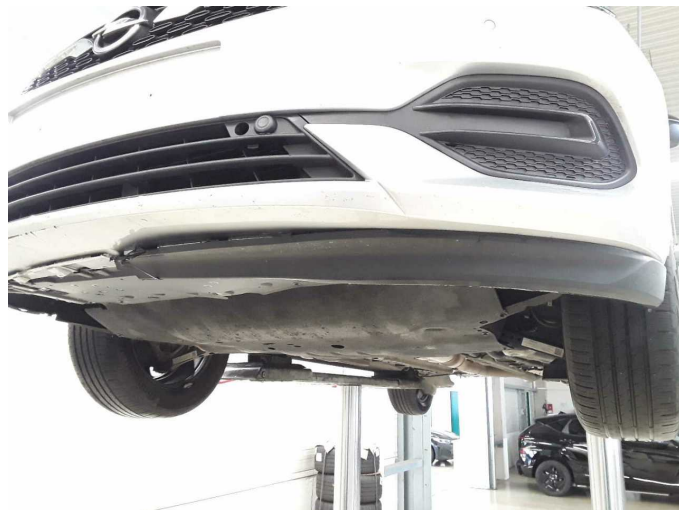
Damage 6: Front bumper: Spoiler (Gumminlippe rechts und links fehlt !) - Broken / torn - Replace