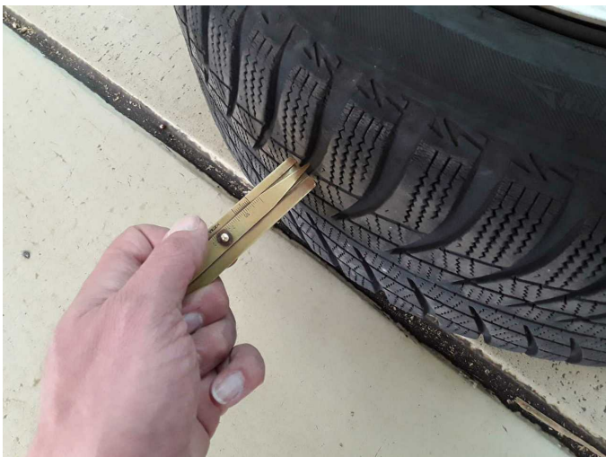
Damage 5: 2nd wheel set: 2 tyres - Does not meet the leasing specifications - Replace