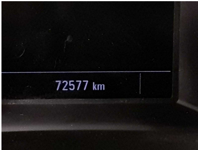
Figure 15: Documents