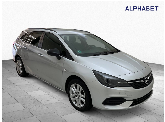
Figure 2: Diagonal front (right)