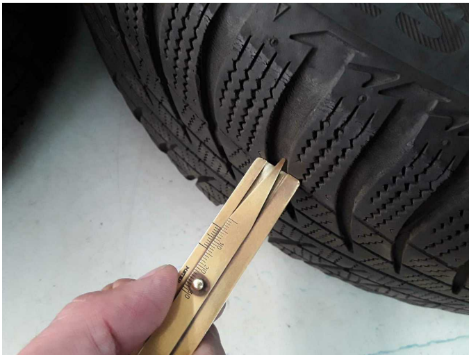
Damage 5: 2nd wheel set: 2 tyres - Does not meet the leasing specifications - Replace