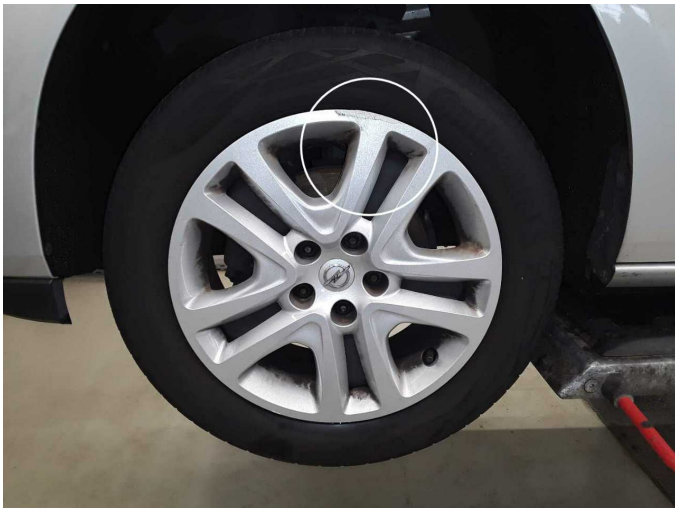
Damage 3: Wheel / tyres: Wheel cover set - complete (4x) - Scratched - Replace