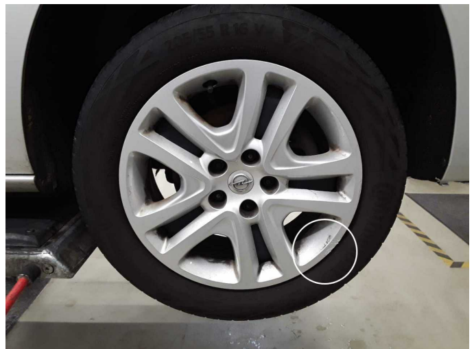
Damage 3: Wheel / tyres: Wheel cover set - complete (4x) - Scratched - Replace