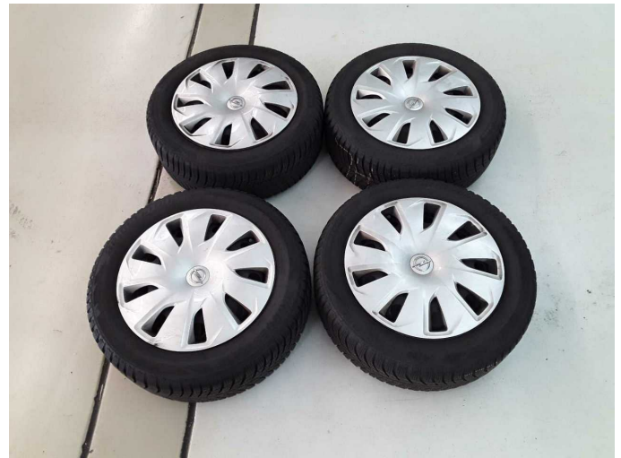
Figure 16: Additional tyres