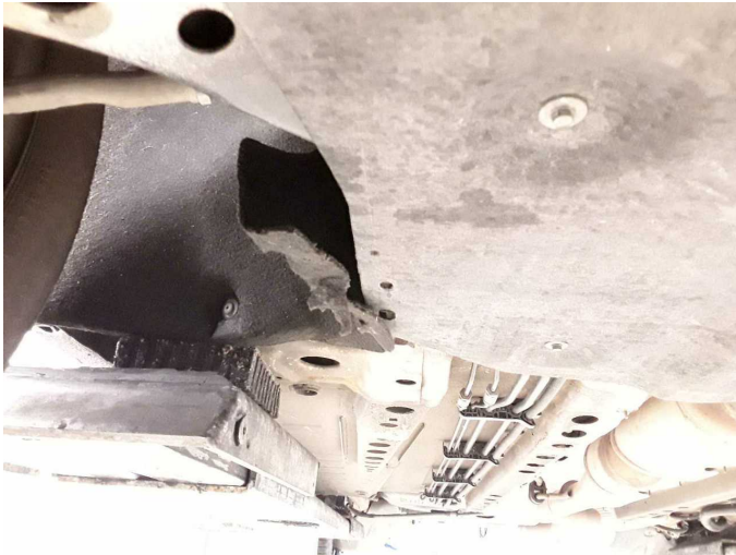
Damage 2: Mudguard - right side: Inner mudguard - Broken / torn - Replace