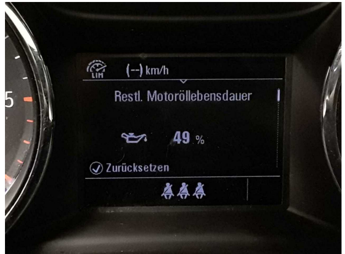
Figure 14: Documents