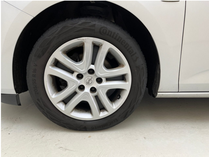
Figure 12: Mounted tyres