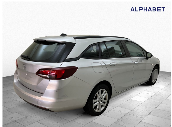
Figure 4: Diagonal rear (right)