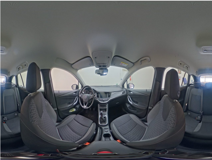
Figure 9: Interior 360° view