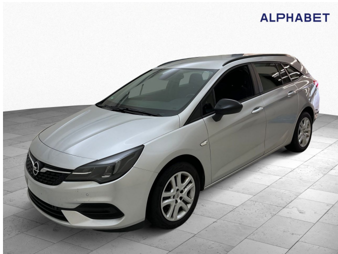
Figure 1: Diagonal front (left)