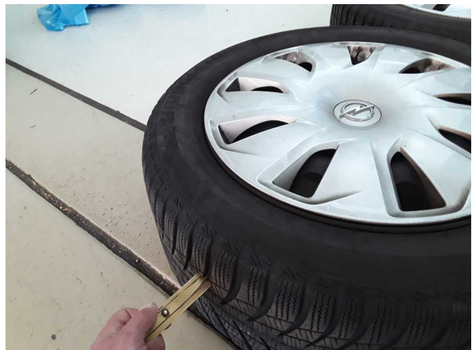
Damage 5: 2nd wheel set: 2 tyres - Does not meet the leasing specifications - Replace