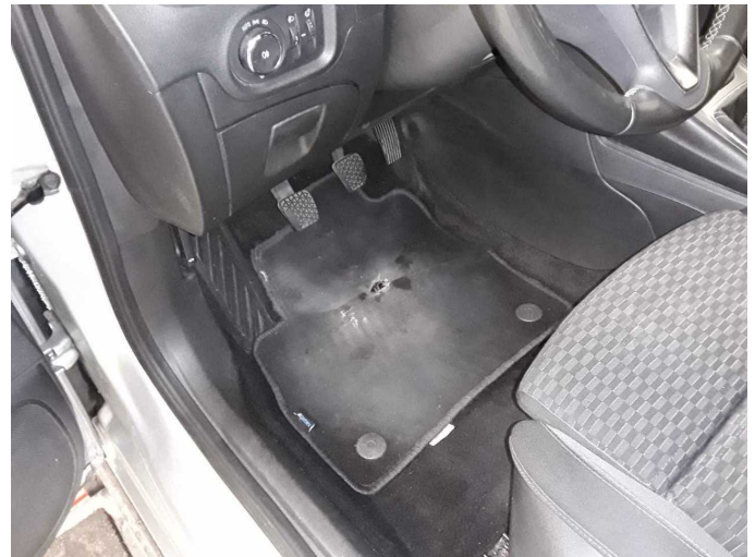
Damage 1: Trim / covers: Floor mats - Broken / torn - No deduction