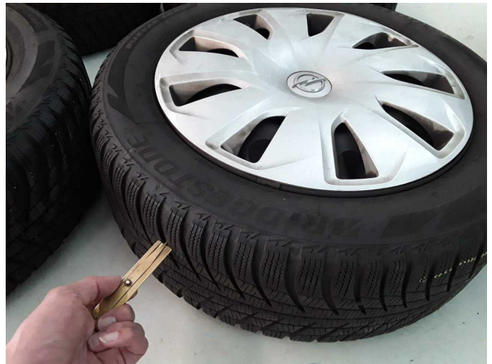
Damage 5: 2nd wheel set: 2 tyres - Does not meet the leasing specifications - Replace