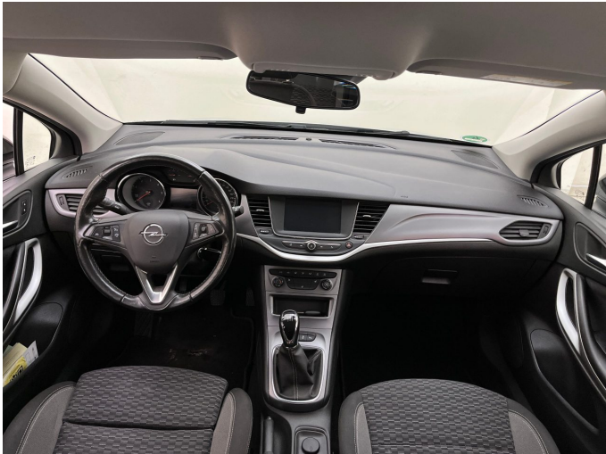
Figure 8: Instrument panel