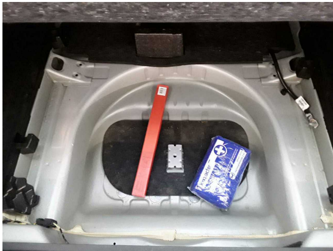
Figure 21: Misc.