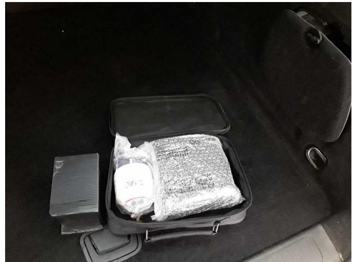
Figure 20: Misc.