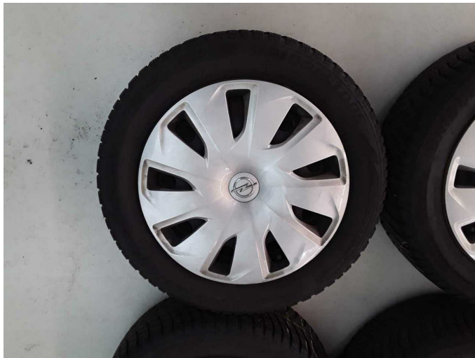
Figure 19: Misc.