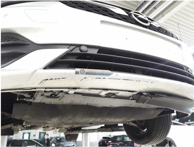
Damage 4: Front bumper: Front bumper - Scratched - Smart repair