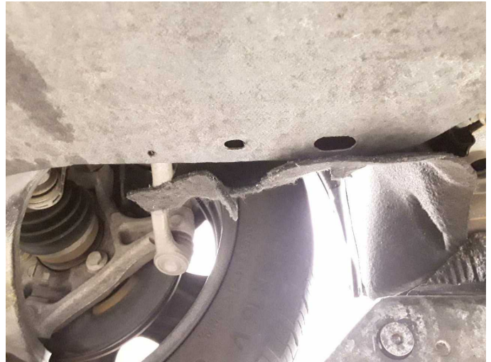
Damage 2: Mudguard - right side: Inner mudguard - Broken / torn - Replace