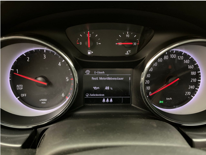
Figure 7: Instrument cluster