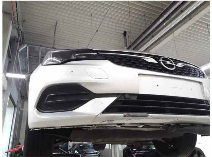
Damage 4: Front bumper: Front bumper - Scratched - Smart repair