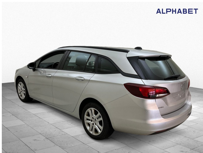
Figure 3: Diagonal rear (left)