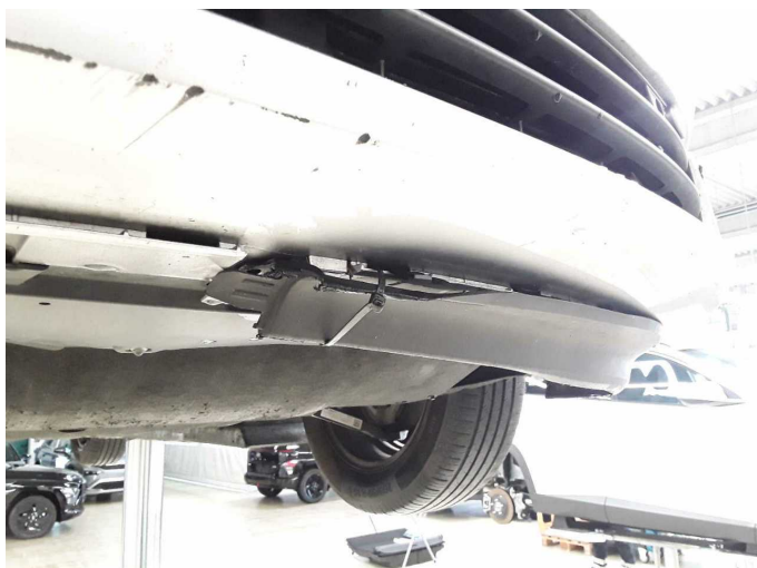
Damage 6: Front bumper: Spoiler (Gumminlippe rechts und links fehlt !) - Broken / torn - Replace