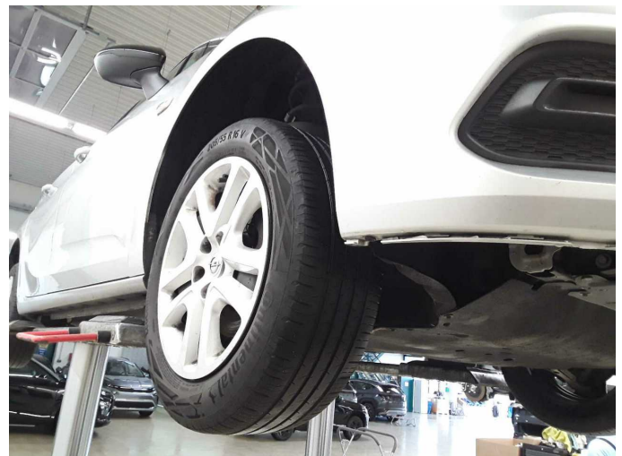
Damage 2: Mudguard - right side: Inner mudguard - Broken / torn - Replace