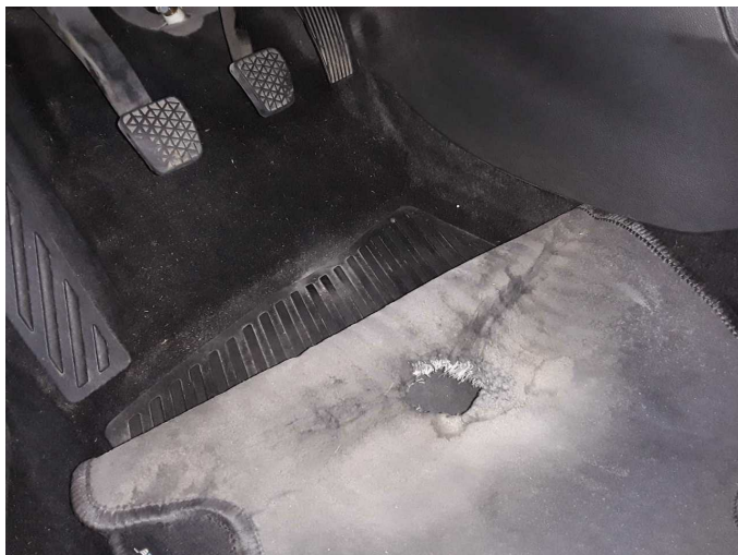
Damage 1: Trim / covers: Floor mats - Broken / torn - No deduction