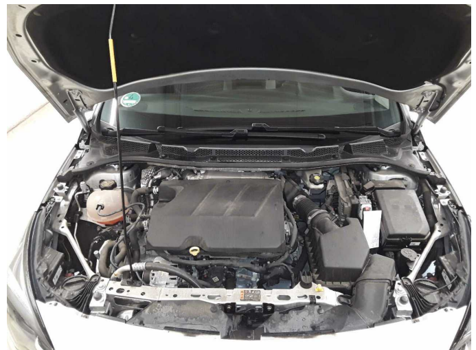
Figure 18: Misc.