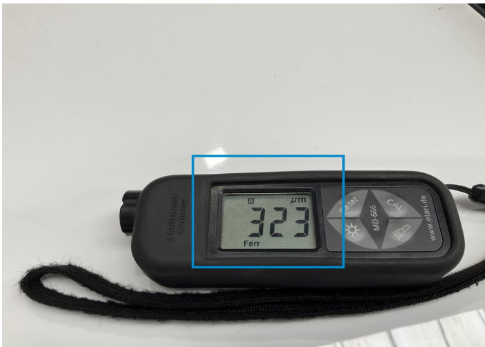
1. Anomalyon Element -