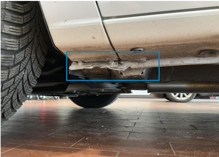
4. Rocker Panel / Center Left Bodywork / Dent / Dent -