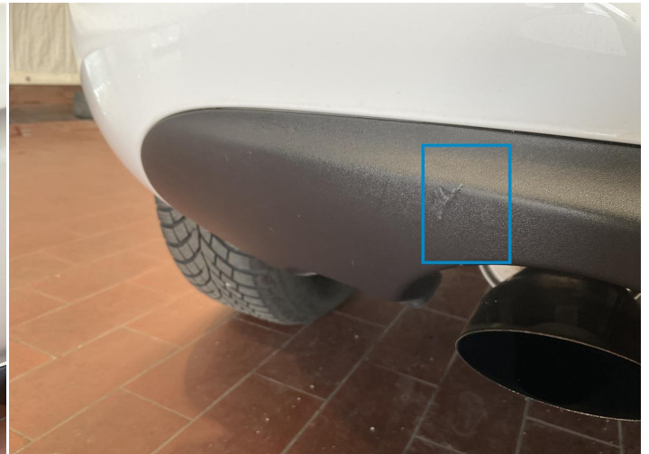
8. Bumper / Back Paint / Scratch / Line -