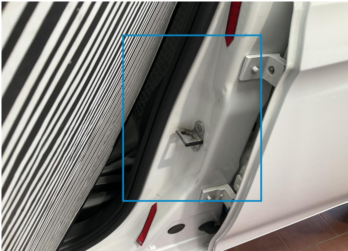
7. Pillar / Front Left Bodywork / Dent / Dent -