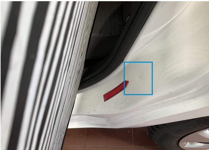
6. Door Edge / Back Left Bodywork / Dent / Dent -