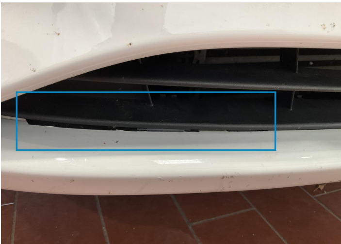
2. Blade/spoiler / Front Bodywork / Breakage -