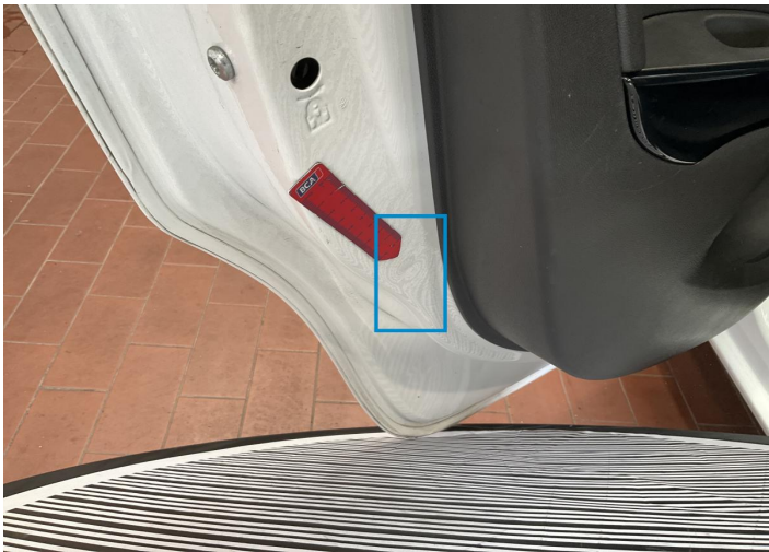
5. Door / Back Left Bodywork / Dent / Dent -