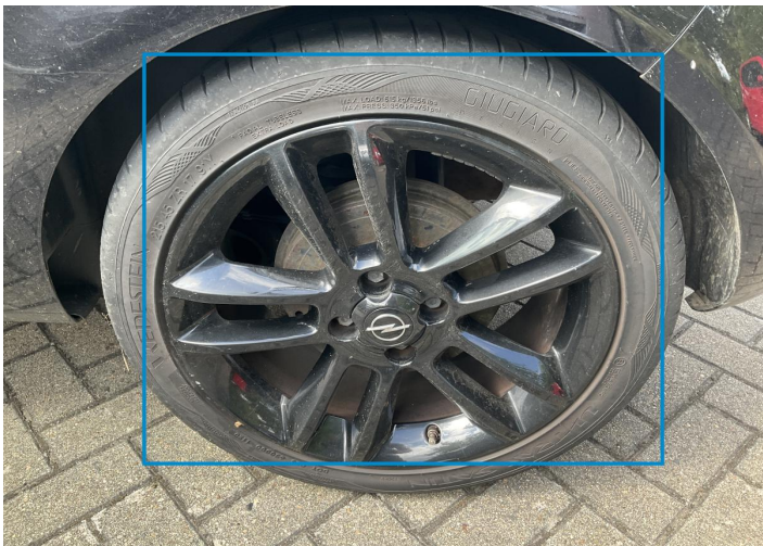
1. Rim / Back Left Out of Bodywork / Scratch -