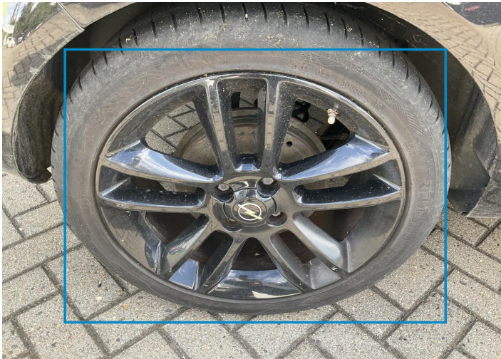
3. Rim / Back Right Out of Bodywork / Scratch -