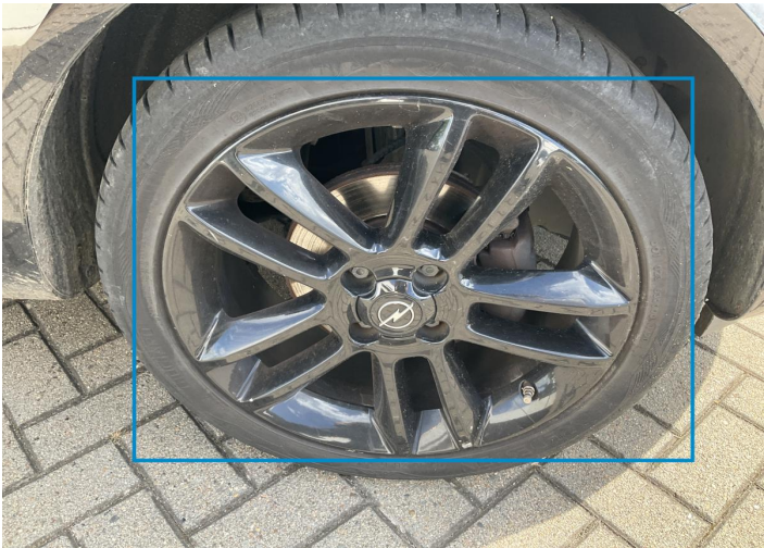
4. Rim / Front Right Out of Bodywork / Scratch -