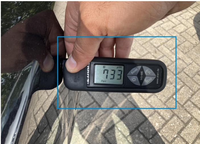
5. Paint / Poor Previous Repair -