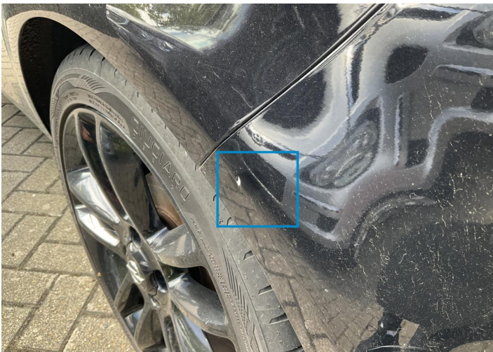
2. Corner Bumper / Back Left Paint / Scratch / Scuff -