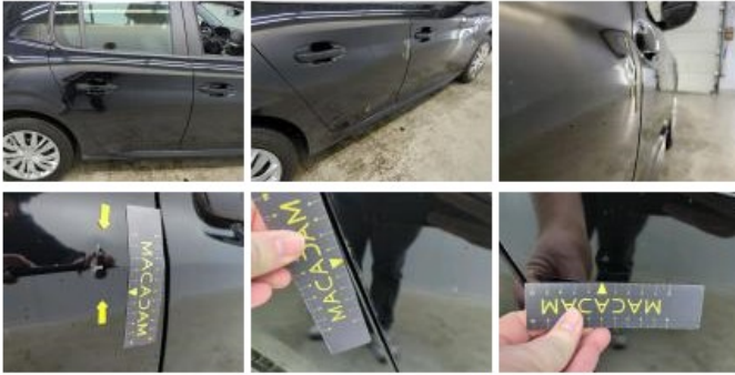
Wing RR, Scratch(es), Repair and paint (complete)