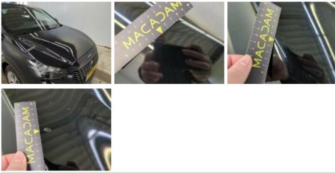
Door RR, Dent(s) and scratch(es), Repair and paint (complete)