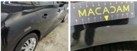
Door FR, Dent(s), Repair and paint (complete)