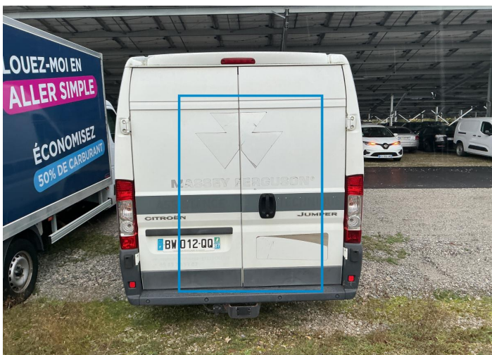
5. Tailgate Paint / Other -