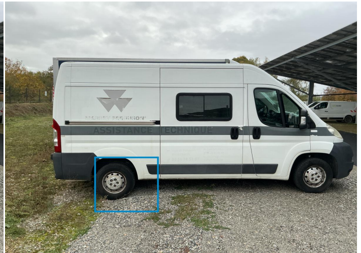
8. Door / Front Right Paint / Scratch / Line -