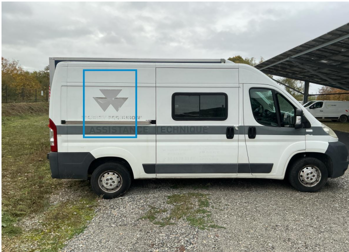
7. Door / Front Right Paint / Other -