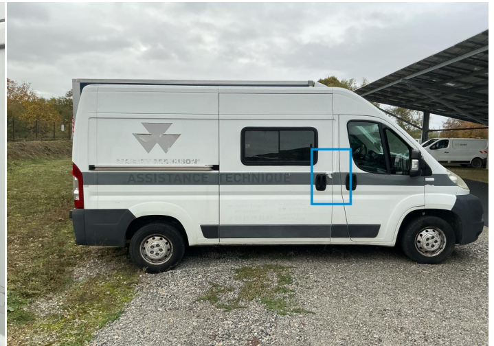
10. Door / Front Right Bodywork / Dent / Deformation -