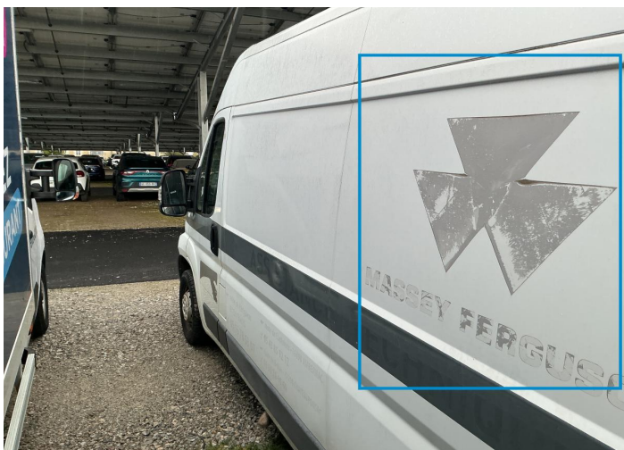
1. Side Panel CL* Paint / Other -