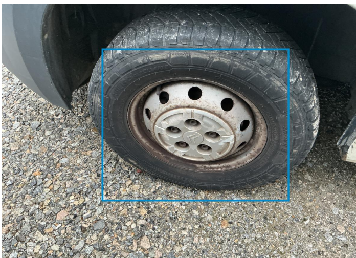
2. Rim / Front Left Out of Bodywork / Scratch -