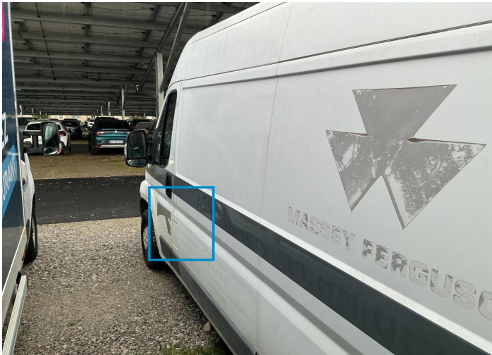
9. Side Panel CL* Paint / Other -