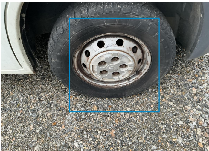
3. Hubcap / Front Right Out of Bodywork / Scratch -