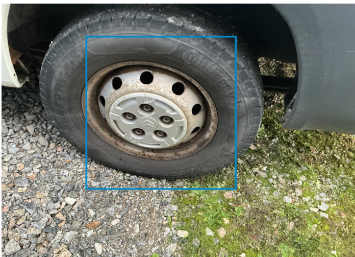
4. Rim / Back Left Out of Bodywork / Scratch -