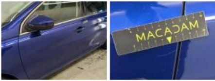
Wing RL, Scratch(es), Polish