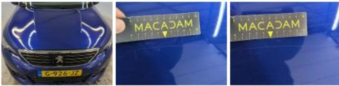
Bumper R, Scratch(es), Repair and paint (complete)