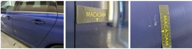
Door FL, Scratch(es), Repair and paint (complete)