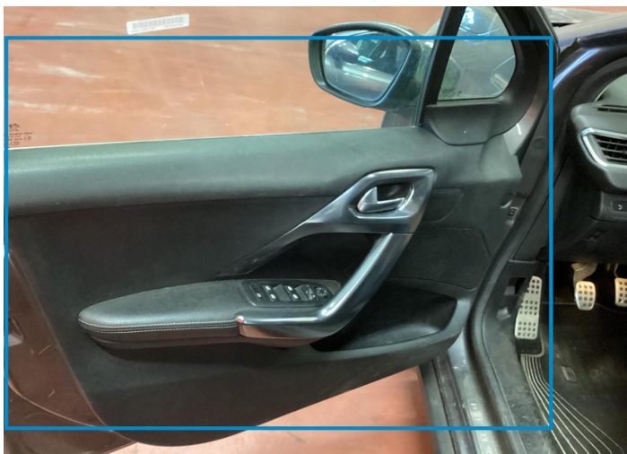
3. Panel Filling / Front Left Interior / Dirty -