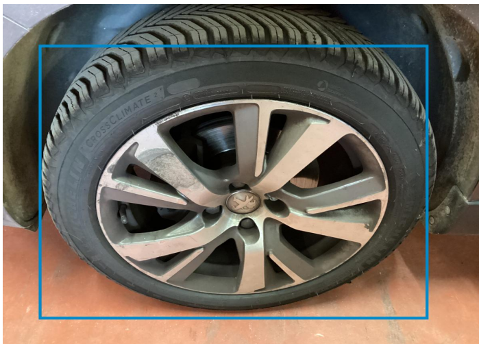
5. Rim / Front Left Out of Bodywork / Scratch -