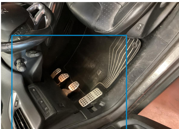
1. Floor Carpet Interior / Dirty -