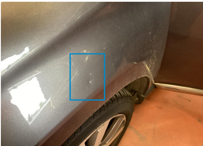
6. Fender / Front Left Bodywork / Dent / Deformation -