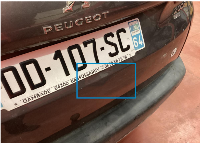
8. Shield / Back Bodywork / Dent / Deformation -