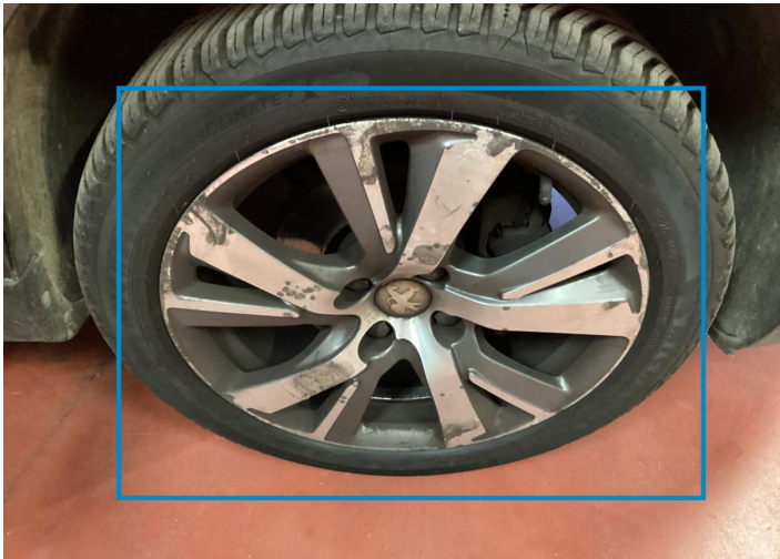
9. Rim / Front Right Out of Bodywork / Scratch -