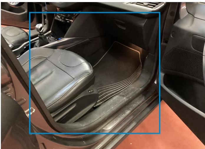
4. Panel Filling / Front Right Interior / Dirty -