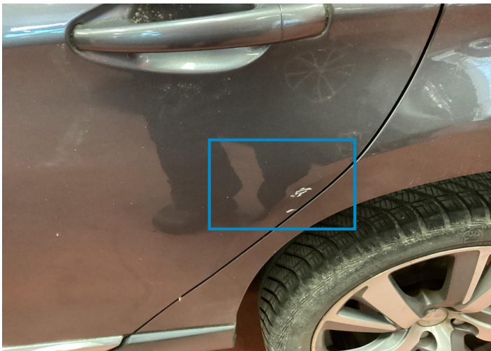
7. Door / Back Left Paint / Scratch / Scuff -