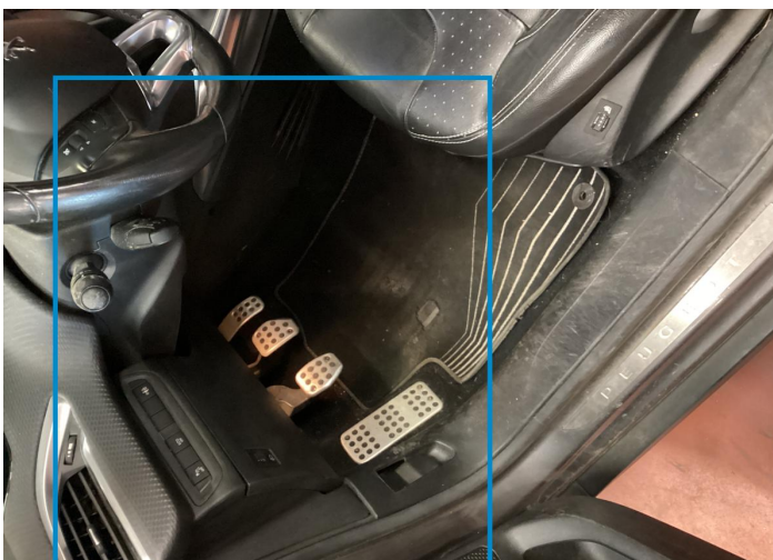
2. Floor Carpet Interior / Holed -