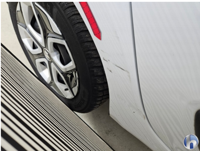
6. Sidewall - Rear - right