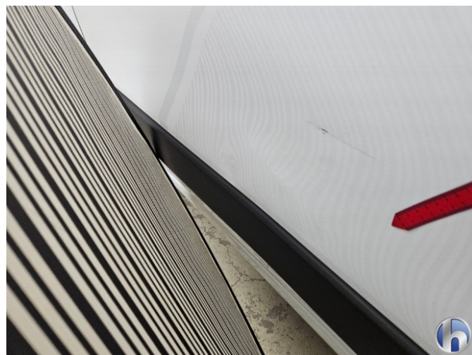
13. Front door - left