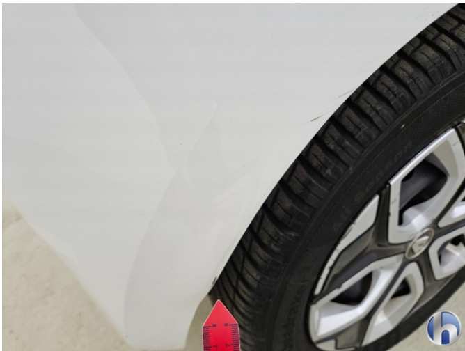
4. Rear bumper