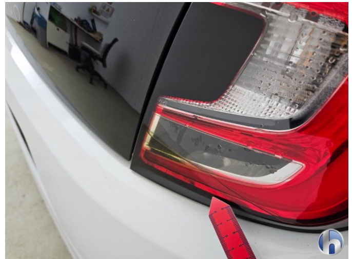
5. Taillight right