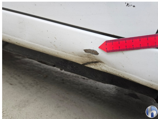
11. side skirt - right