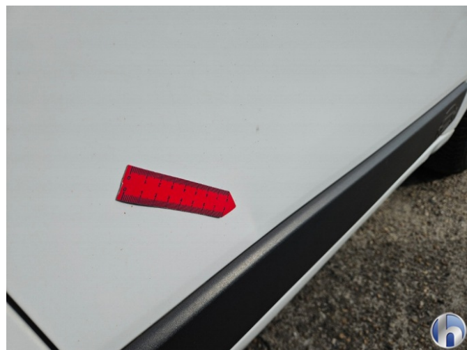
18. Front door - right