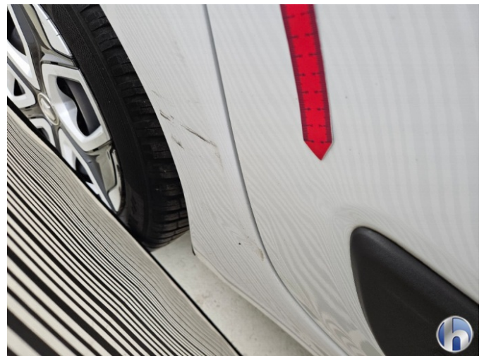
7. Door Rear - right