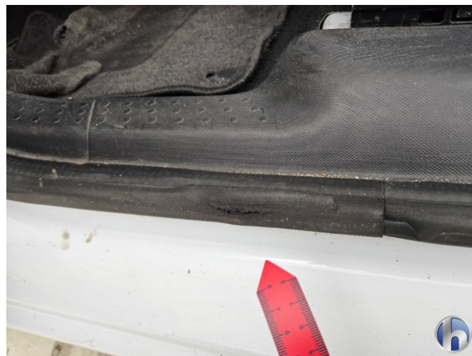
16. Front door seal - left