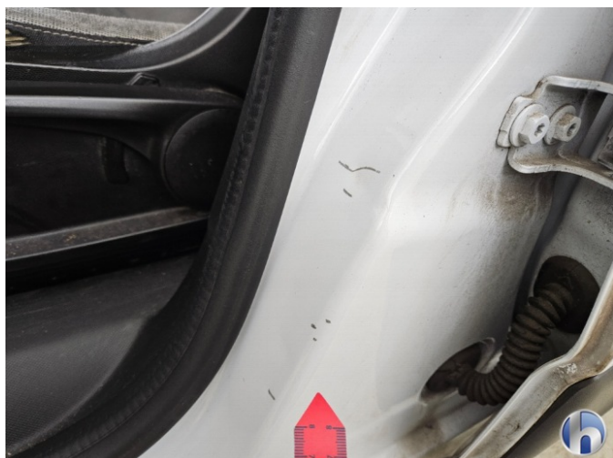
17. Türeinstieg Vorne - Links