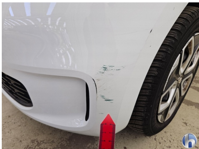
12. Front bumper