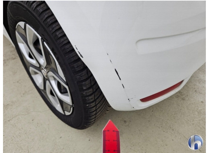
4. Rear bumper