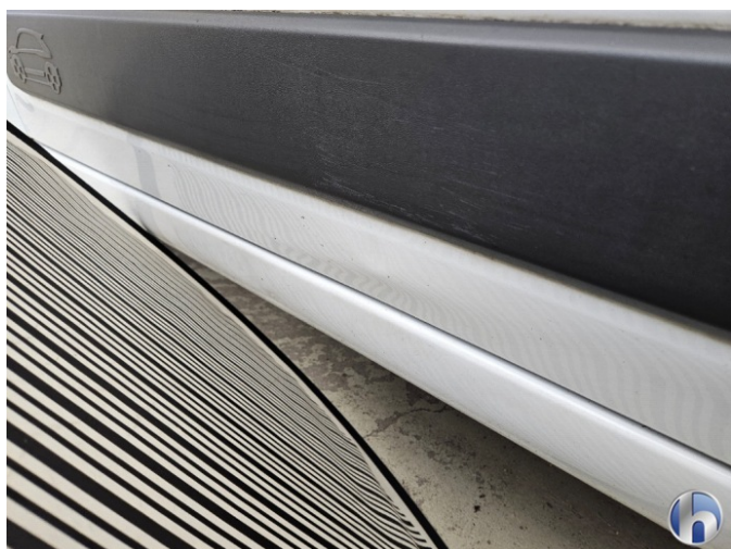
13. Front door - left