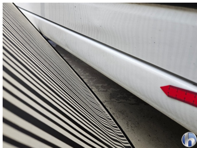
14. side skirt - left