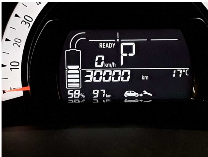
Figure 15: Documents