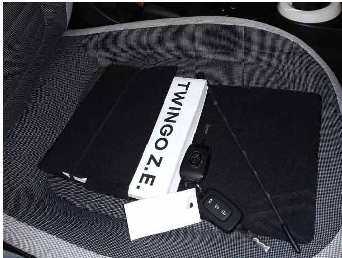
Figure 13: Documents