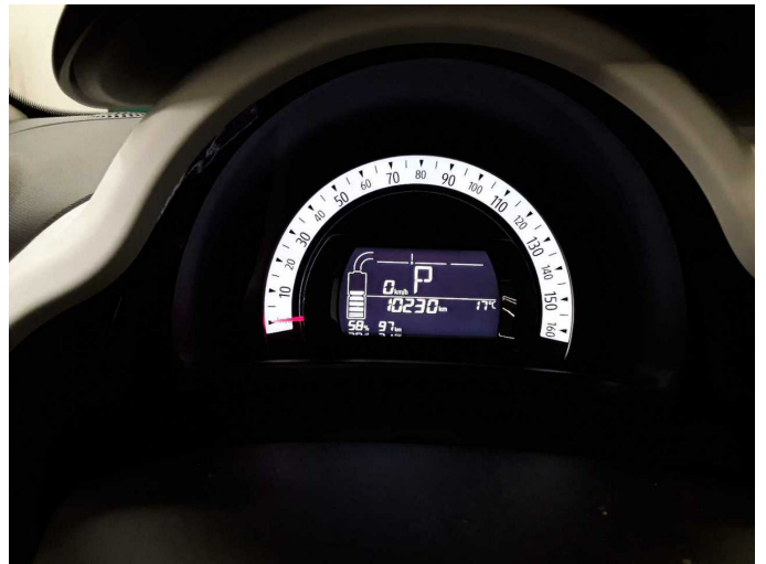
Figure 14: Documents