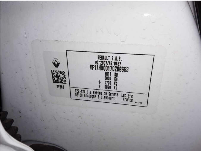
Figure 11: VIN