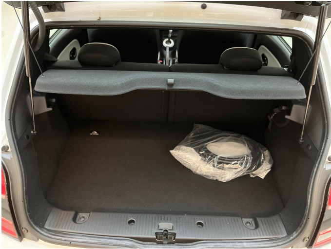
Figure 10: Cargo area