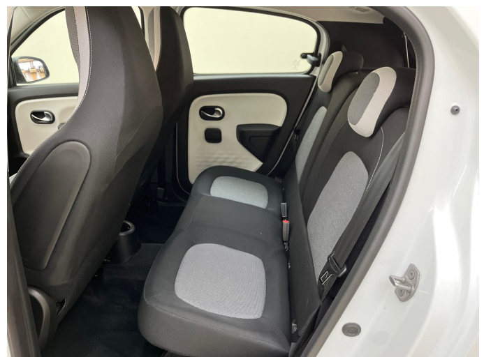
Figure 6: Interior - rear