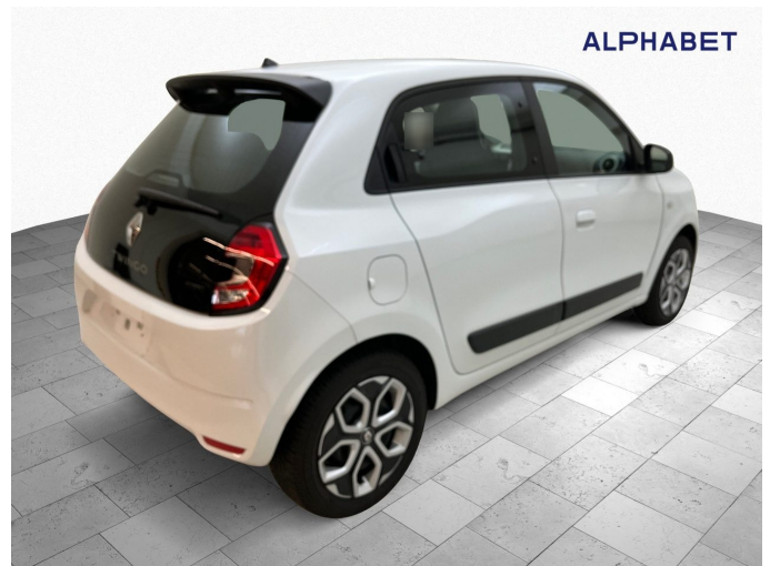
Figure 4: Diagonal rear (right)