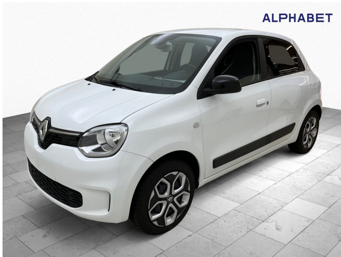
Figure 1: Diagonal front (left)