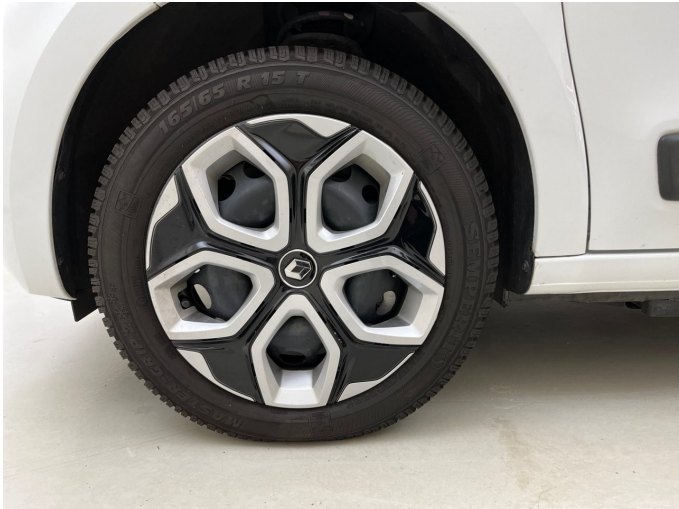
Figure 12: Mounted tyres