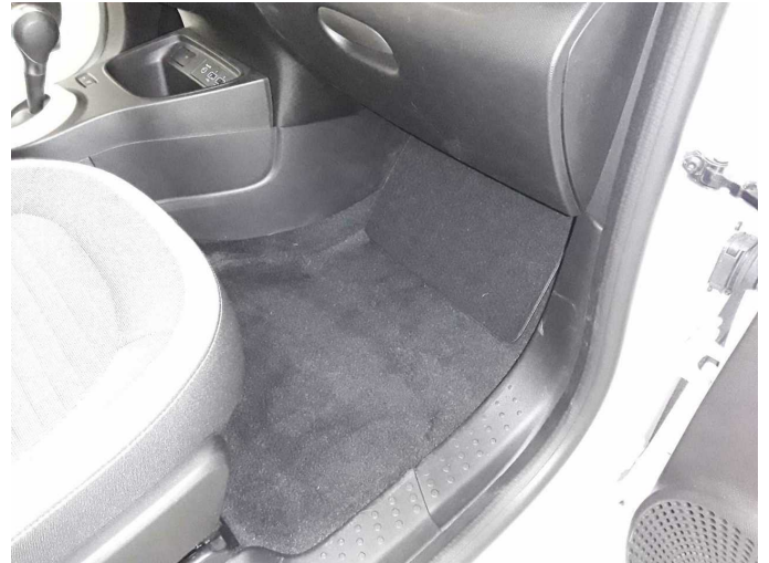
Missing part 1: Trim / covers: Floor mats - Missing - Replace