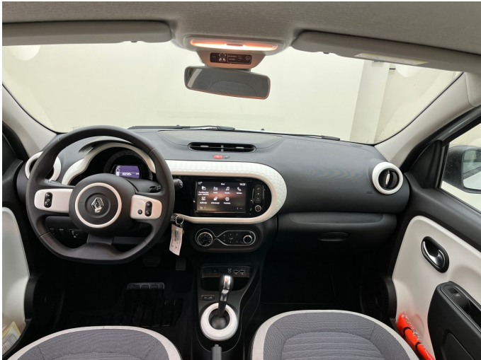
Figure 8: Instrument panel