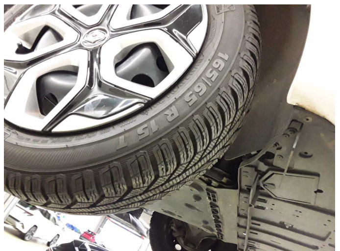
Damage 1: Wheel / tyres: Tyres - complete set (Winter statt Sommer) - Differs from the original configuration - No deduction