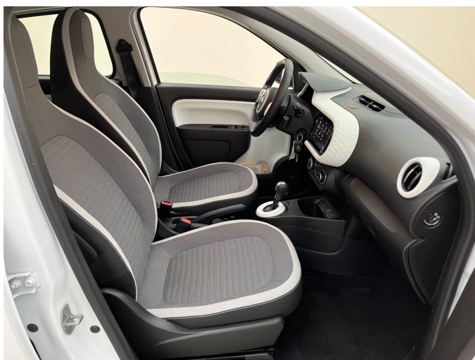
Figure 5: Interior - front