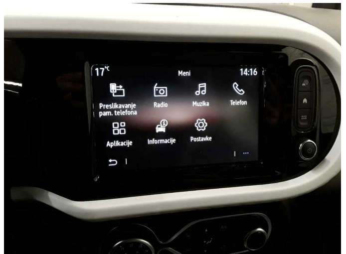
Figure 16: Misc.