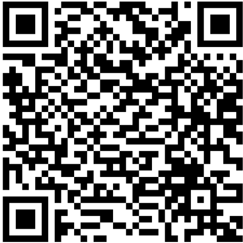
Figure 9: Interior 360° view ( Online Link )