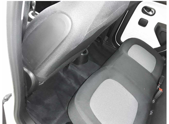
Missing part 1: Trim / covers: Floor mats - Missing - Replace