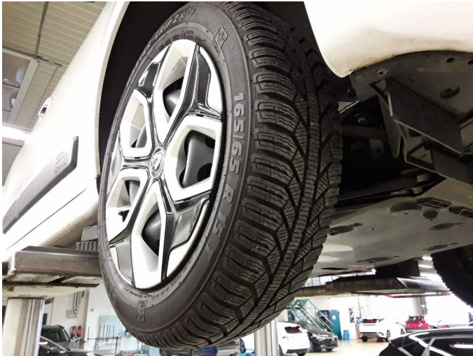
Damage 1: Wheel / tyres: Tyres - complete set (Winter statt Sommer) - Differs from the original configuration - No deduction