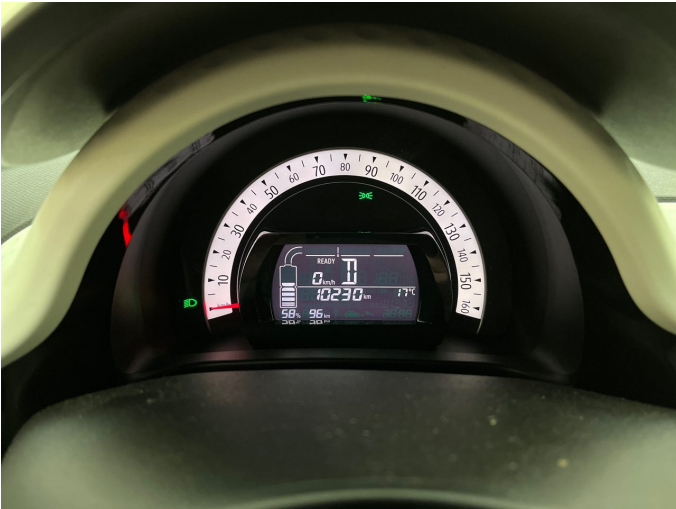
Figure 7: Instrument cluster