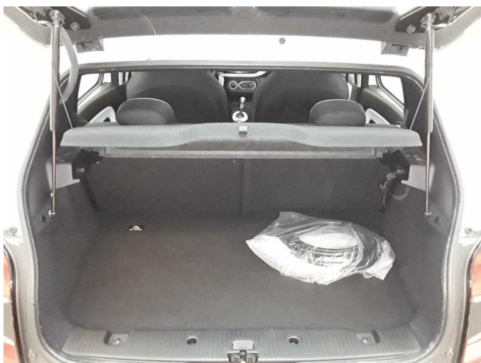
Figure 17: Misc.