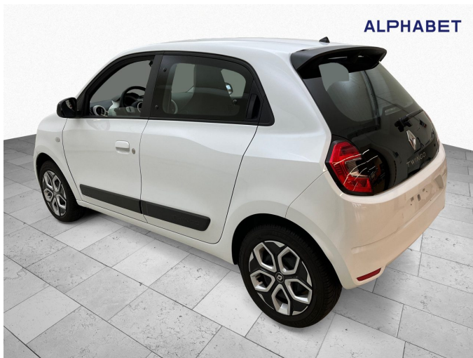
Figure 3: Diagonal rear (left)