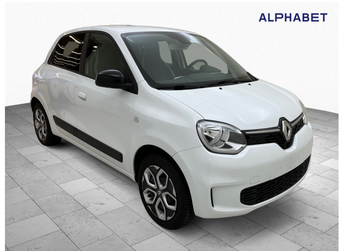
Figure 2: Diagonal front (right)