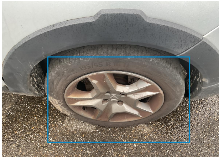
7. Rim / Front Right Out of Bodywork / Scratch -