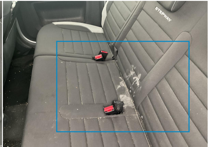
2. Seat / Back Center Interior / Stained -