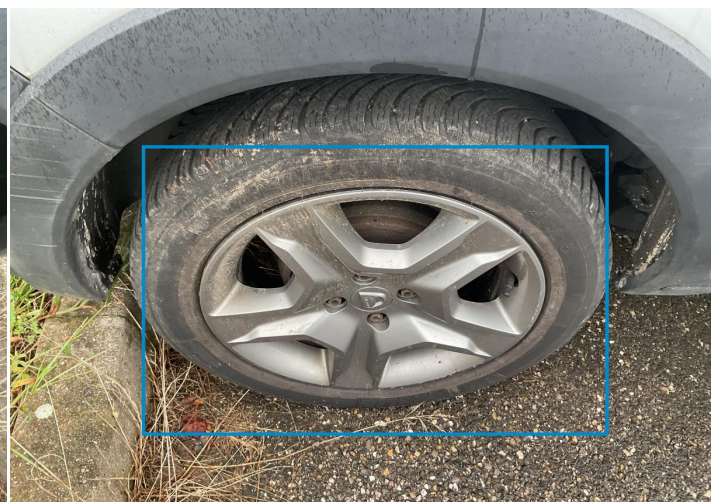
6. Rim / Back Right Out of Bodywork / Scratch -