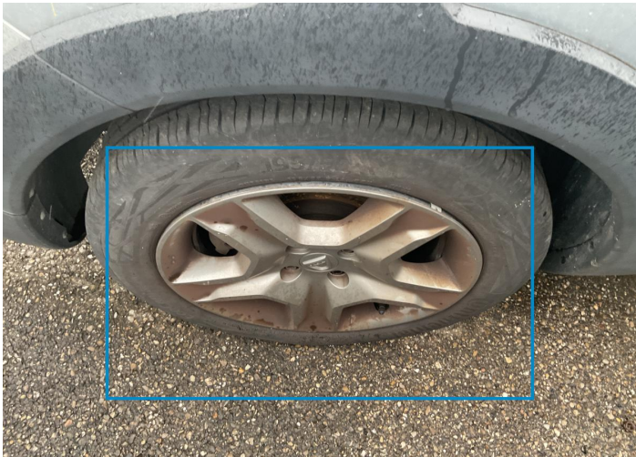
3. Rim / Front Left Out of Bodywork / Scratch -