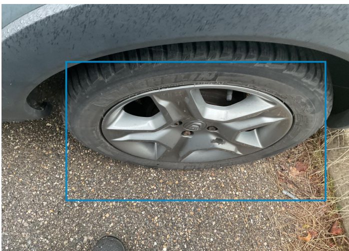
5. Rim / Back Left Out of Bodywork / Scratch -