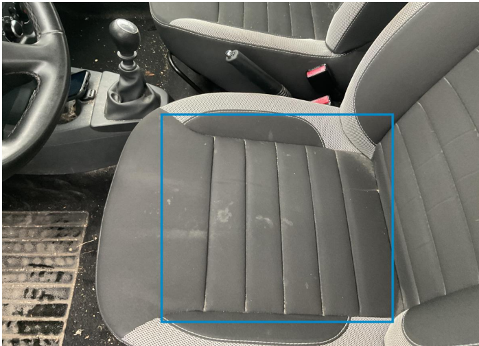
1. Seat / Front Left Interior / Stained -