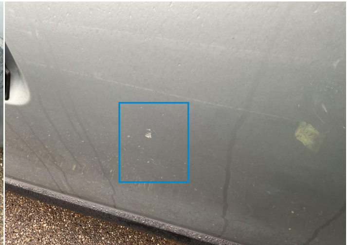
4. Door / Back Left Paint / Scratch / Line -