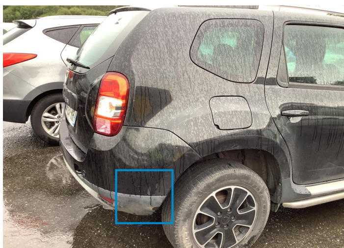
5. Side Panel / Back Right Paint / Scratch / Scuff -