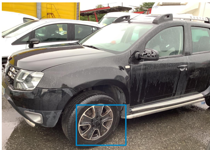
1. Fender / Front Left Paint / Scratch / Scuff -