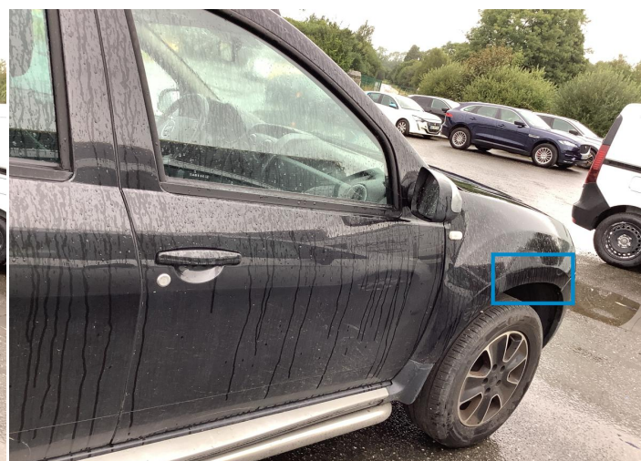
10. Fender / Front Right Paint / Chipping -