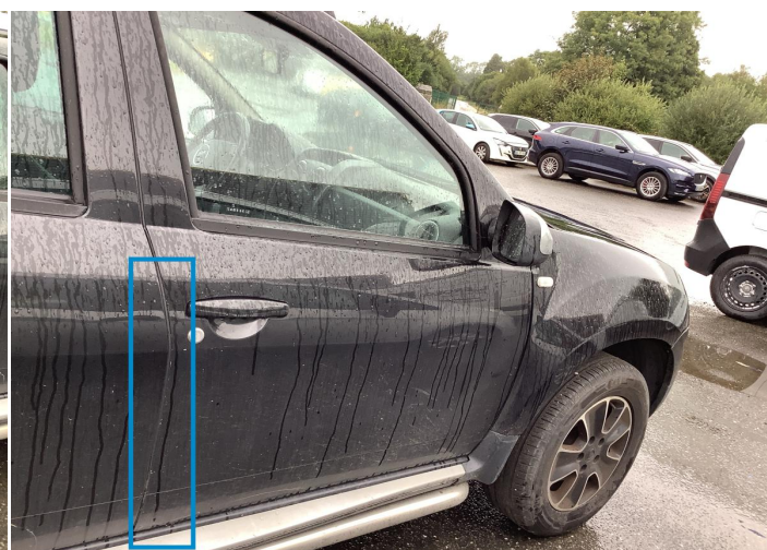
8. Fender / Front Right Paint / Stone Chip -