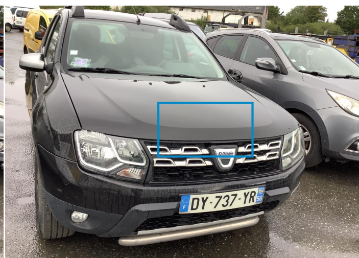
12. Hood Paint / Stone Chip -