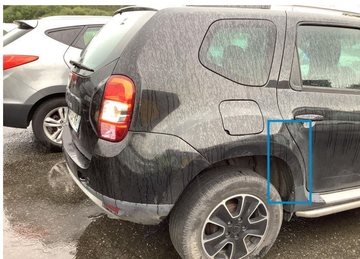
7. Side Panel / Back Right Paint / Scratch / Line -