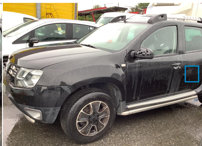
4. Fender / Front Left Bodywork / Dent / Dent -