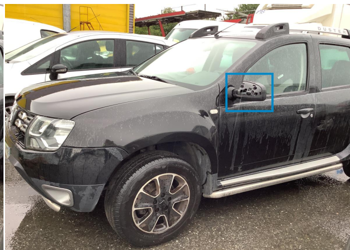
2. Fender / Front Left Bodywork / Breakage -