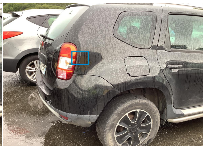
6. Side Panel / Back Right Bodywork / Dent / Dent -