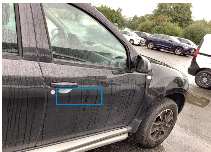
9. Fender / Front Right Paint / Scratch / Line -