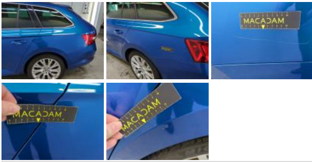
Door RL, Scratch(es), Repair and paint (complete)