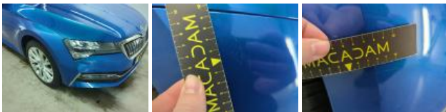
Door RR, Dent(s) and scratch(es), Repair and paint (complete)