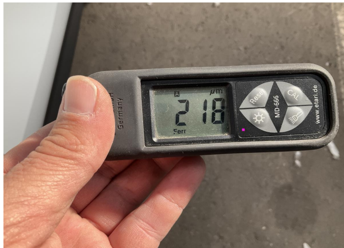
1. Door / Front Left Paint / Poor Previous Repair -