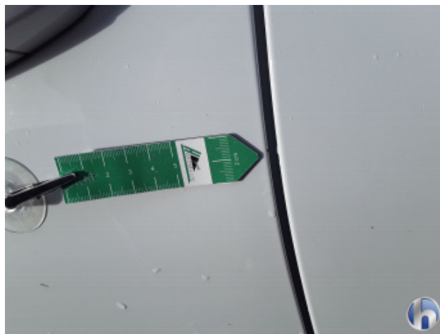
1. Front door - left Wear and tear - Without repair