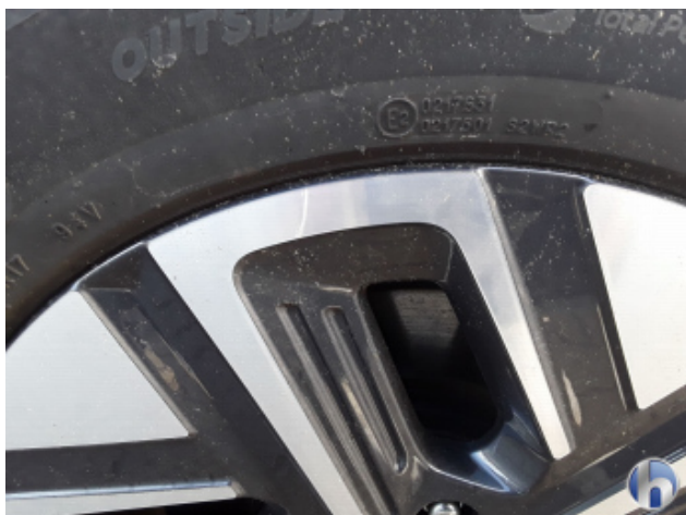
2. Rim front - right Wear and tear - Without repair