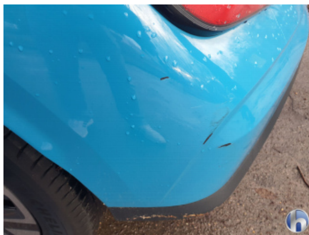
1. Rear Bumper Light scratch - Paint