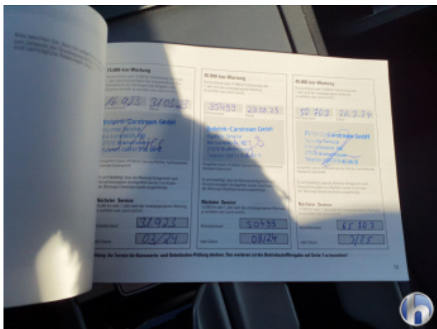
Service book / proof